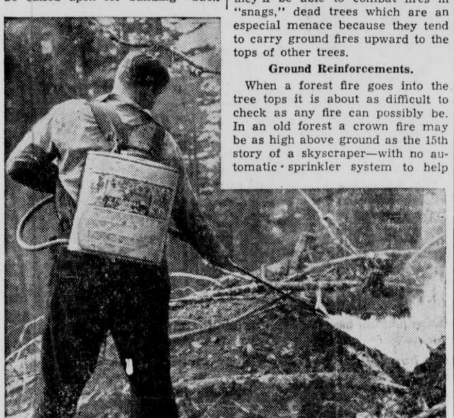
After landing the "smoke jumper" unstraps his parachute and goes to work with his portable fire extinguisher. He carries other tools such as axes and spades. The heavier equipment can be dropped by parachute when necessary.

Even flame-throwers developed by the chemical warfare service may be called upon for building "back | they'll be able to combat fires in