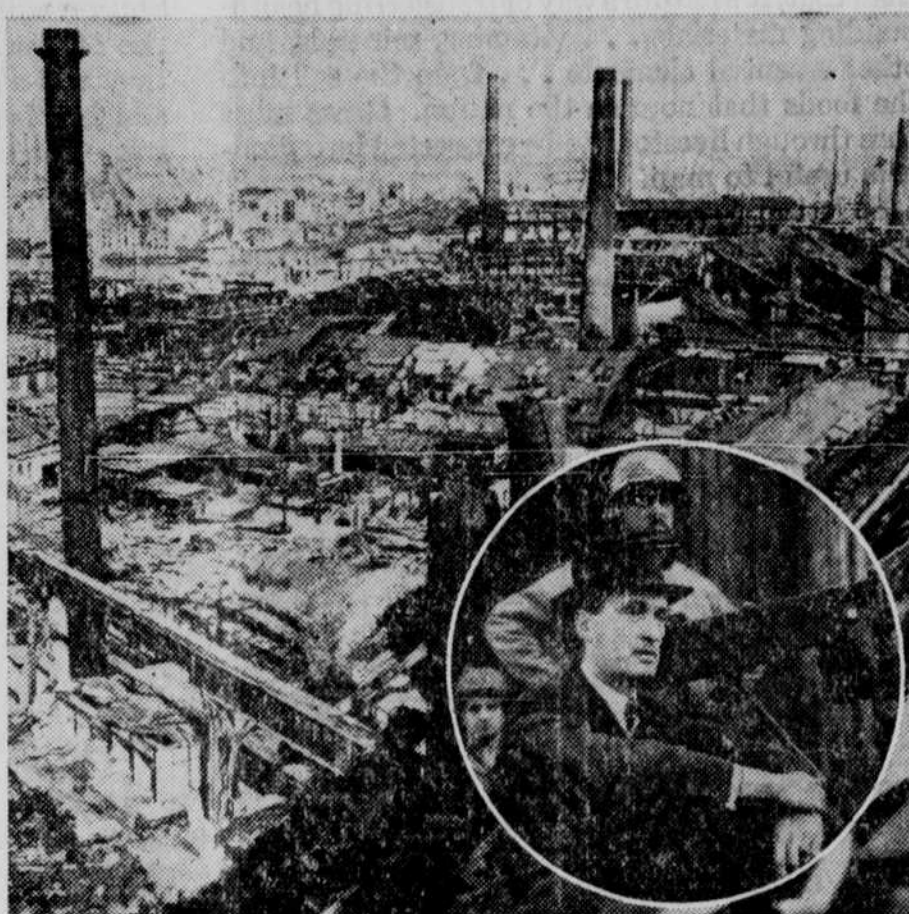
View showing the ruins of what was the world's largest armament works, the Krupp plant in Essen, Germany. It was captured by American forces. Insert, Alfred Krupp.