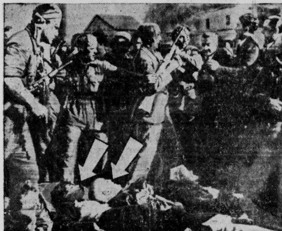
The body of Benito Mussolini, one time dictator of Italy, and that of his mistress, Clara Petacci, lie on the sidewalk in Milan, where they were dumped by partisans who executed them.