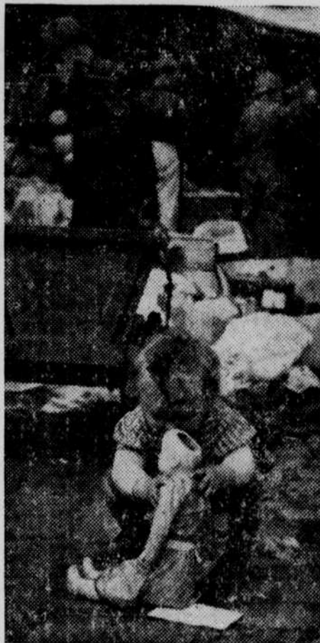
Her fatherland may be torn to shreds by Allied armies, her home may be amongst those leveled by the tide of war, but all that means little to this German child who tries to comfort her scalped doll in a Leipzig street. Liberated labor slaves are shown in background.