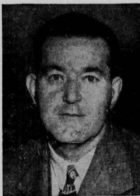
Robert E. Hannegan, chairman of the Democratic National committee who has been named to succeed Frank C. Walker, who resigned as postmaster general effective July 1. Hannegan will remain as chairman of the Democratic national committee.