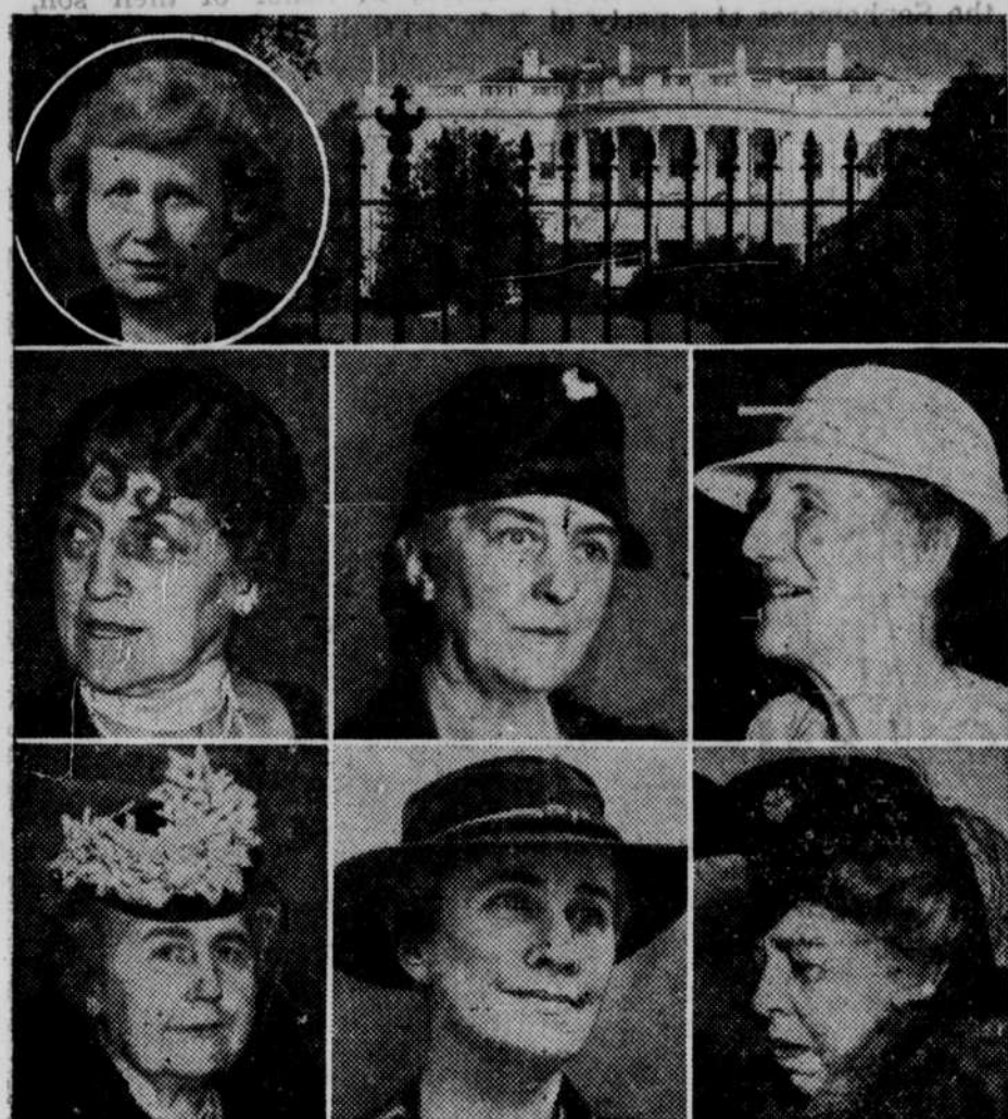
Six widows of former Presidents of the United States are still living. Above, Mrs. Truman, present first lady of the White House and her new home. Center: Mrs. Benjamin Harrison, Mrs. Thomas Preston (Grover Cleveland), Mrs. Theodore Roosevelt. Lower: Mrs. Woodrow Wilson, Mrs. Calvin Coolidge, Mrs. Franklin D. Roosevelt.