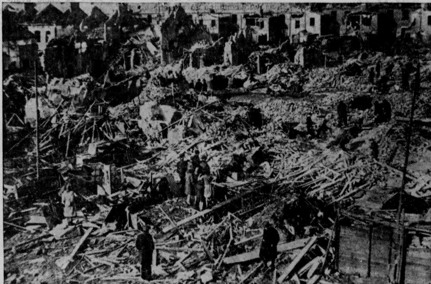
This area of devastation was caused by a single V-2 rocket bomb that struck London's Stratford street. Dead 2,754, injured 6,523, was the toll reported in England. Allied armies report that they are equipped to turn rocket bombs loose on Tokyo and other centers of Japanese empire. This photo was just released, following lifting of veil on the final German desperation campaign. Churchill revealed that 1,050 of these missiles had fallen on England prior to March 27, 1945.