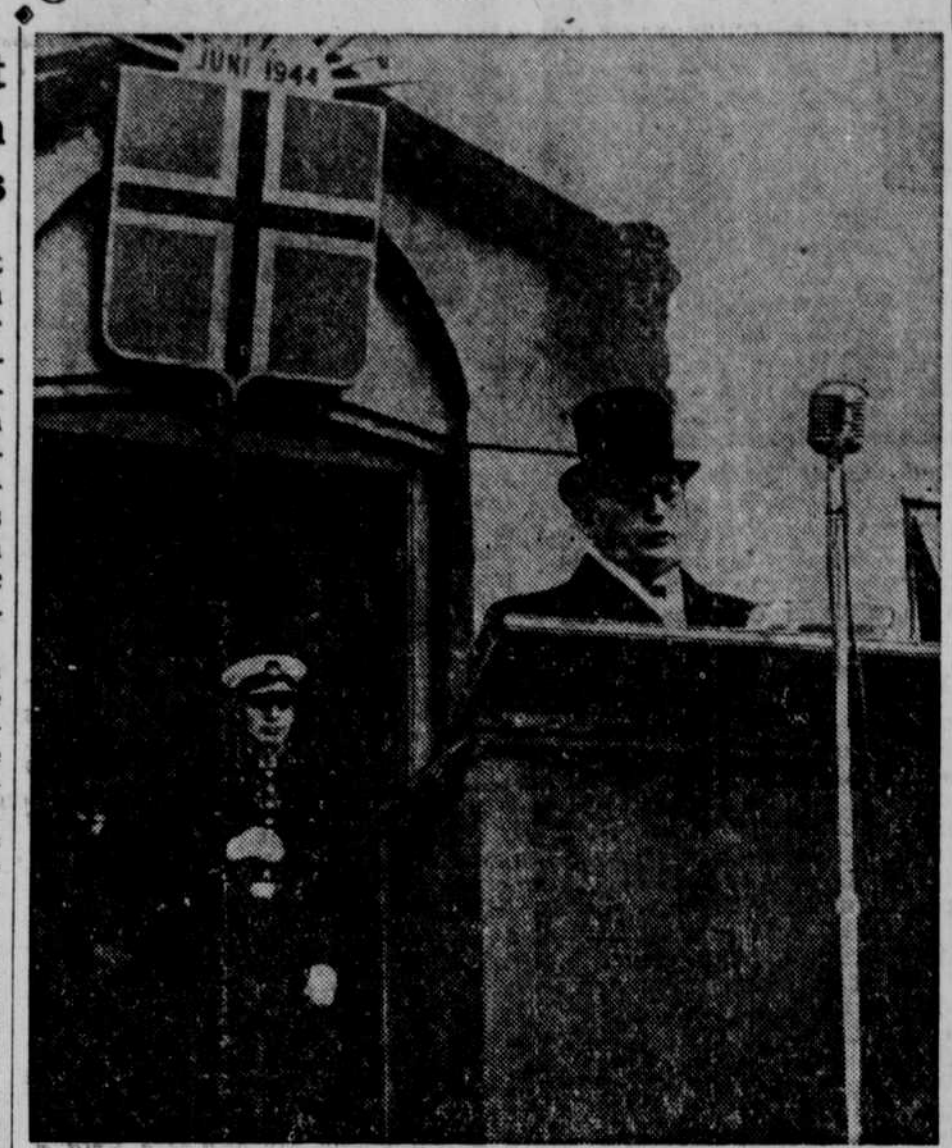
The president of the newly established Icelandic republic, Sveinn Bjornsson, addresses the nation by radio on June 17, 1944, the day the island dissolved its union with Denmark.

General Charles de Gaulle's Committee of National Liberation was recognized on October 23 by the U. government of France. On Septem-