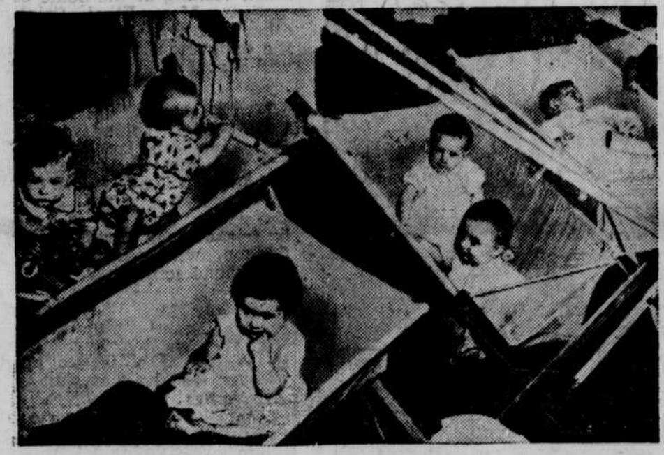
Aboard a coast guard manned troop transport, a ship's hatch serves as a nursery for this healthy group of New Zealander-American war bables, with their mothers, all natives of New Zealand. They are on their way to a new home in the United States. Crewmen rigged the lines for the inevitable washing and made the hatch "comfy."