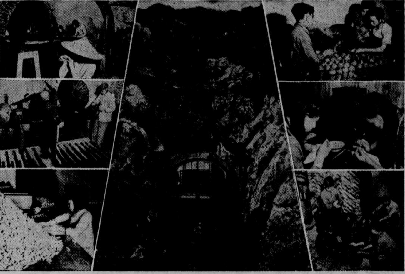
Chinese, forced below the surface of the earth by the incessant bombing raids of Japanese airmen, are working tirelessly to produce the munitions of war so sorely needed by their armies in the field. This enormous underground arsenal has been hewn out of the solid rock foundation of a mountain in southwestern China. Here are electrically lighted rock caverns, connected by arched tunnels lined with cement.