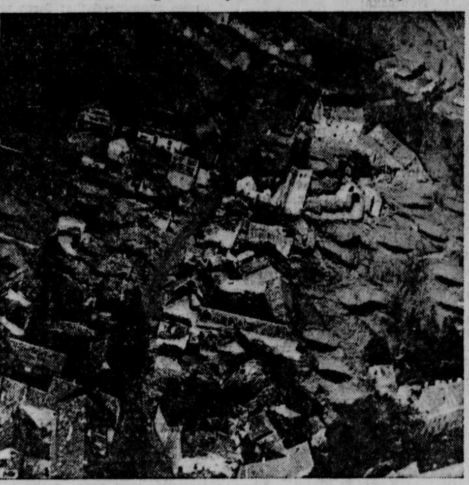
Heavy artillery, part of the U. S. First army commanded by Lieut. Gen. Courtney H. Hodges, contributes its share in repaying Germany for the wrecked cities of Europe. Photo shows the effect of complete saturation of American artillery of the town of Durviss, Germany, one of the border cities laid to ruins.