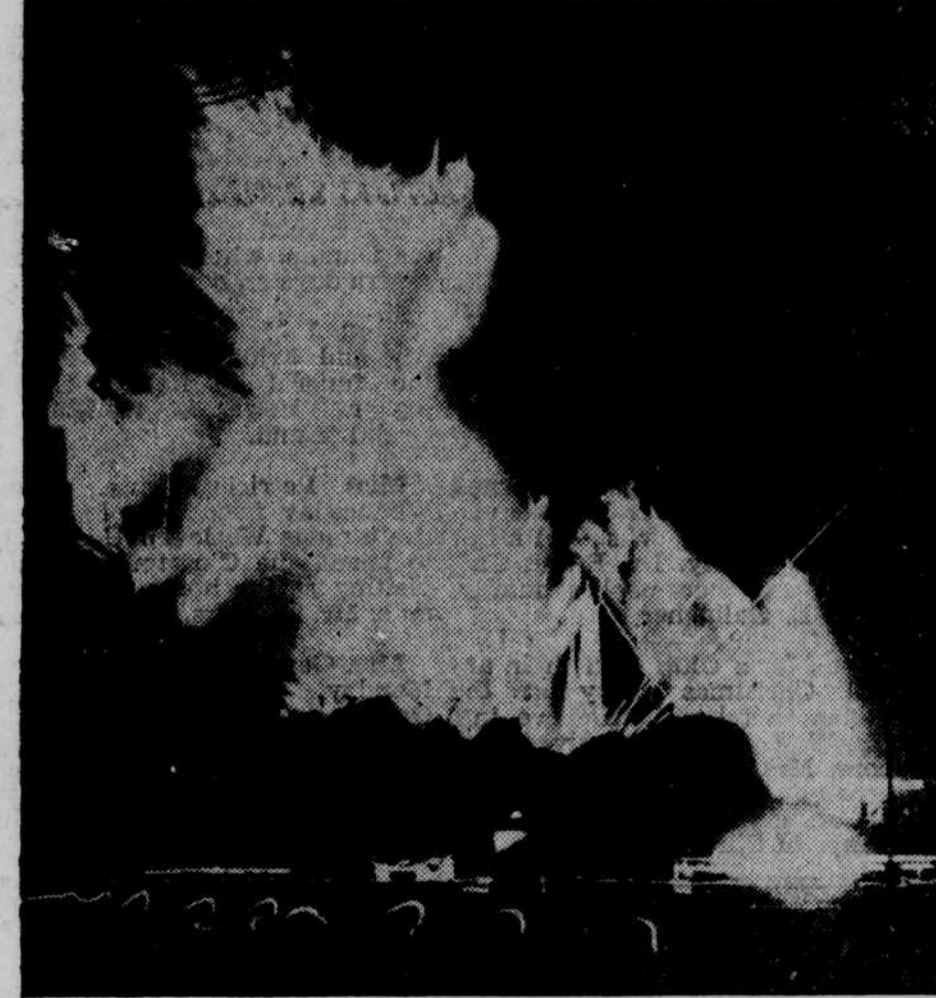
This scene is typical of night life on Peleliu, in the vicinity of the Second marine air wing encampment. The streaks across the foreground are the headlights of jeeps and trucks. The curving line is a marine swinging a flashlight. The skies are lit up with tracer bullets and star shells during attack on Jap positions.