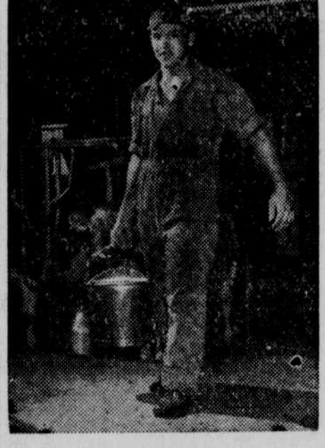
Ideal Dairy Layout

Conclusions reached from the tests also showed that the temperature of the water was not nearly so important as the temperature of the air. In other words, if the cow had to stand outside in near zero weather, she was likely to drink