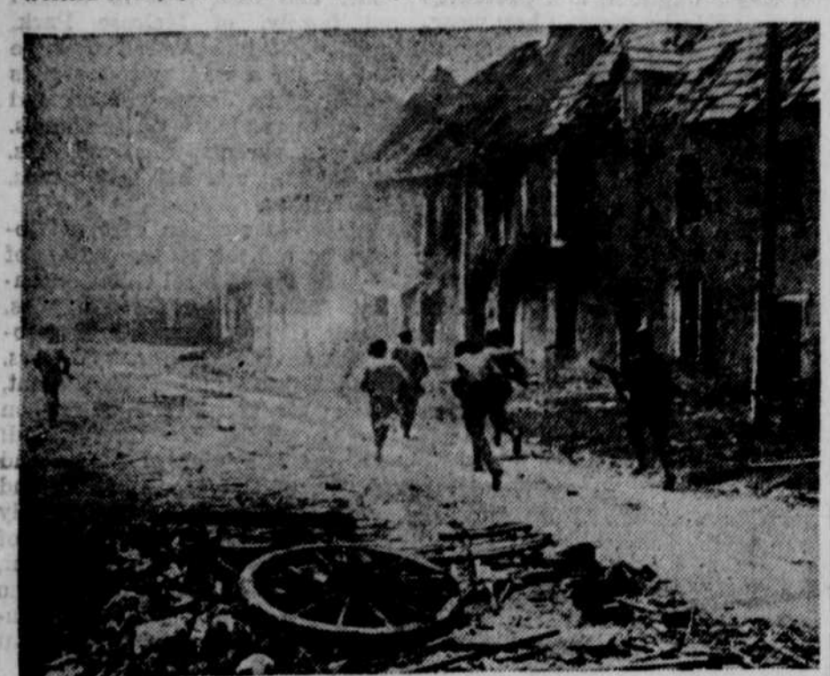
France-With comrades covering their advance with gunfire, U. S. infantrymen sprint down village street in Normandy to new positions.

(EDITOR'S NOTE: When opinions are expressed in these columns, they are those of Western Newspaper Union's news analysts and not necessarily of this newspaper.)