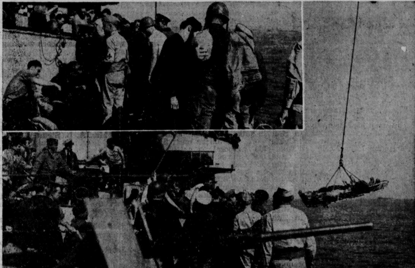
Insert shows United States navy hospital corpsmen aboard the battleship giving speedy treatment to wounded Yank army Rangers, casualties of the fierce battle for the beachheads that marked the first few days of the Allied invasion of Normandy. In lower photo the casualties are being brought aboard. Wounded in France, the Rangers were carefully hoisted aboard the battleship U. S. S. Texas after a speedy trip out from the embattled shoreline in one of the latest landing crafts.