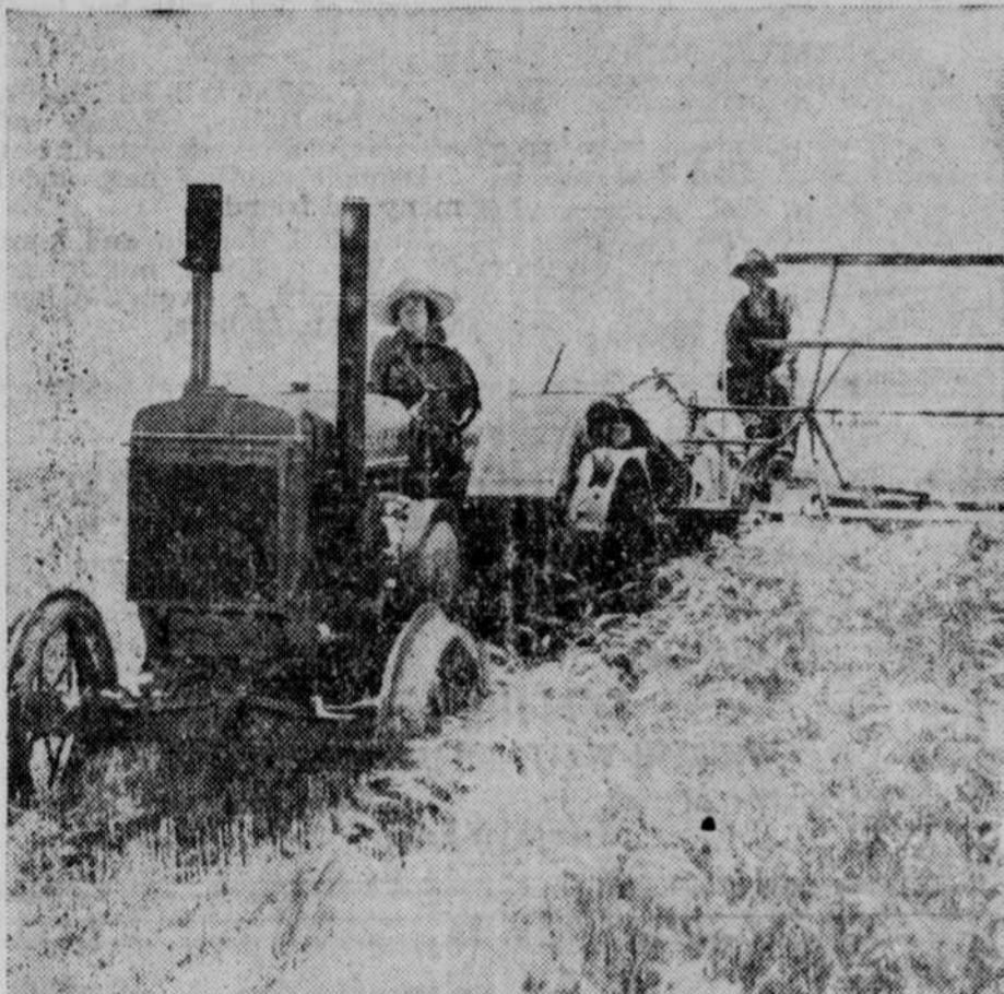
With sons and farm hands in the armed services and defense plants, 1944 harvest begins to look like a "ma" and "pa" job. In many parts of Kansas the farmers are pooling their work in order to get the harvest done. Prisoners of war as well as a large number of school children and city people on vacation will be doing their part.