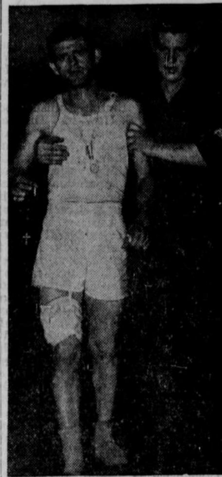
An Allied casualty a few turns around the deck of an LST invasion ship after his wound was bandaged. A medical corpsman lends him a hand. This landing ship was converted into a first aid station after it had delivered its load.