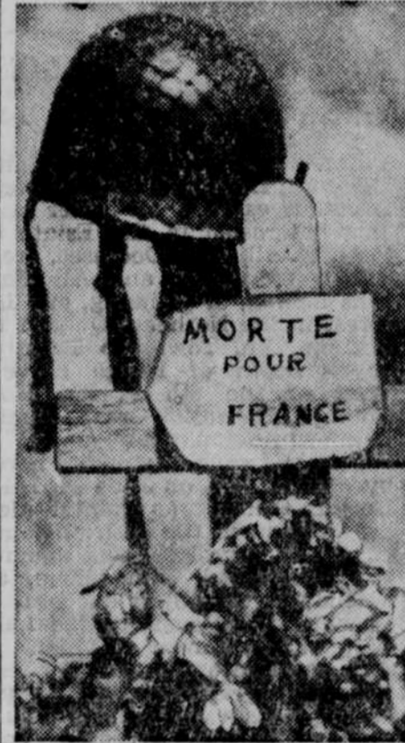
"Morte Pour La France," translated means, "Died For France." The French civilians made this grave for a Yank who died in action. He was one of the first to land on the Normandy beachhead during the initial landing stages of the invasion operations.