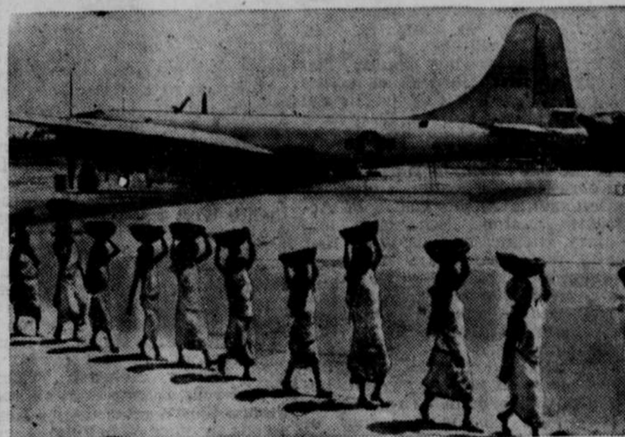
Somewhere in India, B-29s, America's most powerful bombers, were tuned up at this base and started from there on the mission to bomb the steel center of Japan. This photo shows the native women, used to enlarge the airport to enable the mammoth ships to take off, in the foreground, as the plane is worked on in the background.