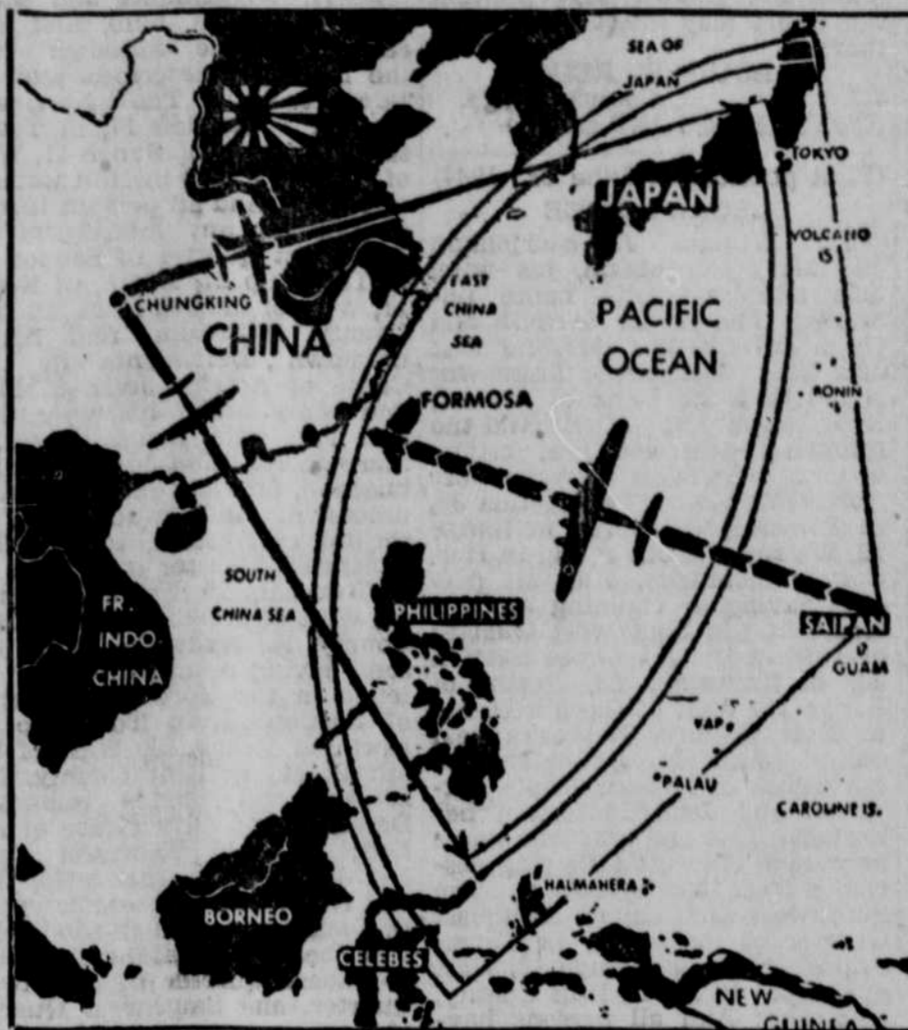
This map shows why Japan's empire is no longer safe, with the capture of Saipan, now that the Yank's amphibious and 20th air force are in operation. Saipan, Guam and China will all prove effective bases from which attacks can be launched against Tojo's industries and military bases. Tokyo is less than 1,500 miles from Saipan.