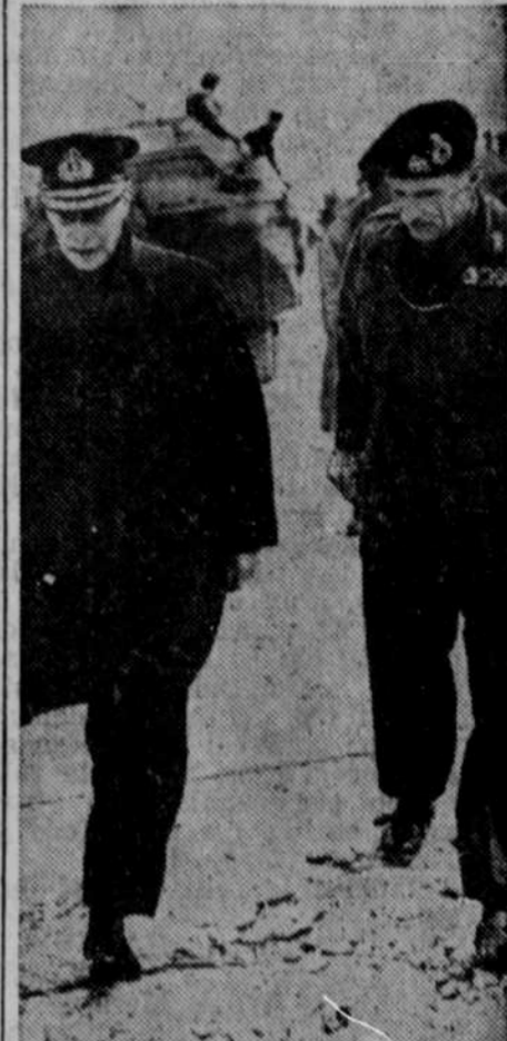
King George (left) was met by Gen. Bernard Montgomery, commander of the Allied ground forces in the Eto, when he landed on the French beachhead, to make an inspection of his forces and objectives won.