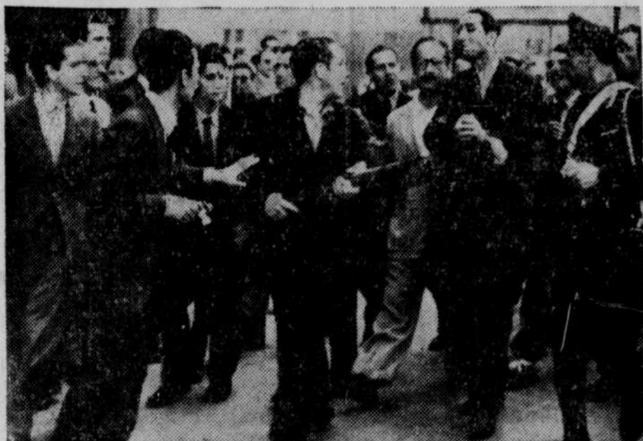
Armed anti-Fascistic civilians help a Roman policeman escort an ex "big shot" of the Fascists to the jail where he will be held until tried for crimes committed under the Mussolini regime. The civilians, soon after the fall of Rome to Allies, armed themselves and began an open hunt, until Allied authorities took over the job.