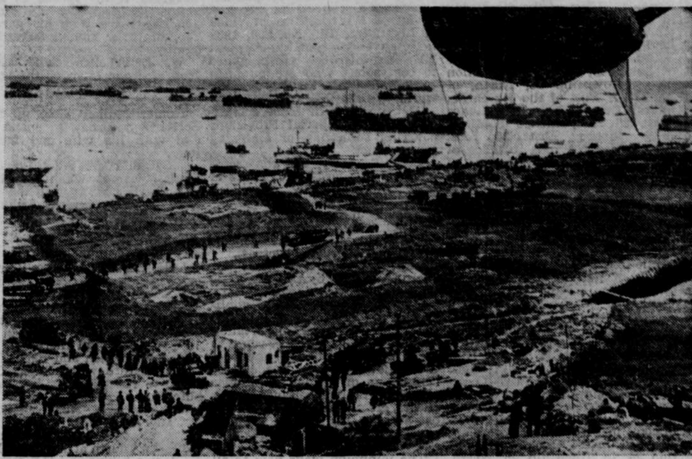
This is how the American section of the Normandy beachhead looks, viewed from a bluff where German gunners once had a position. As far as the eye can see there are invasion craft, ferrying fighting Yanks and other Allied soldiers as well as munitions and equipment to the beach. Barrage balloons swing above the transports like lazy crows to protect them against possible dive bombing attack. All is quiet on this strip of beach now, but in the first hours of the invasion death and terror ran rampant here.