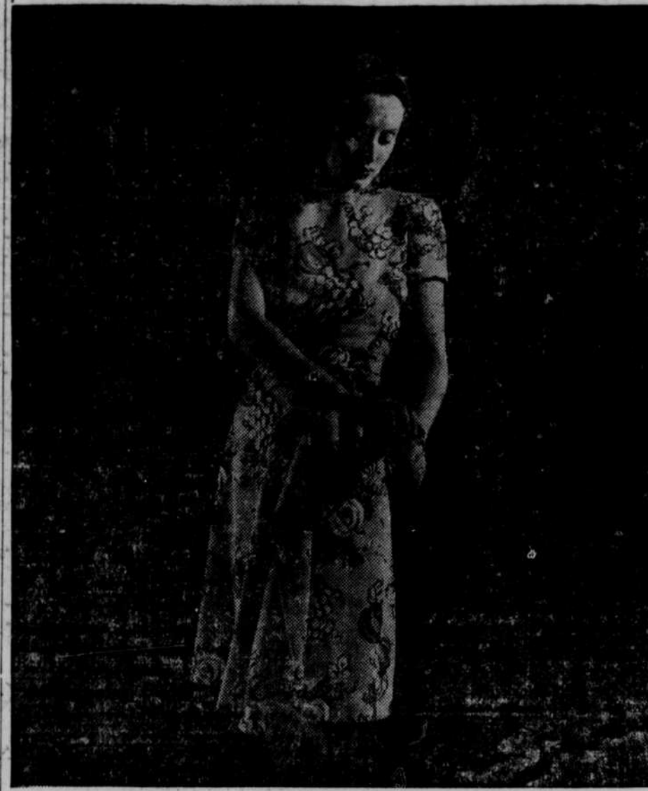
A youthful silhouette is attained by the brief sleeves, slim skirt and graceful ruffle of this dress. In a breezy rayon print of yellow, grey and white, you will find it a perfect choice for spring-through-summer wear. This style requires little fabric, and by making it yourself, you will have extra money to put into War Bonds. Sewing Leaflet No. M 5591, "Before Beginning to Cut," may be obtained by sending a stamped, self-addressed envelope to the Needlework Department of this paper.