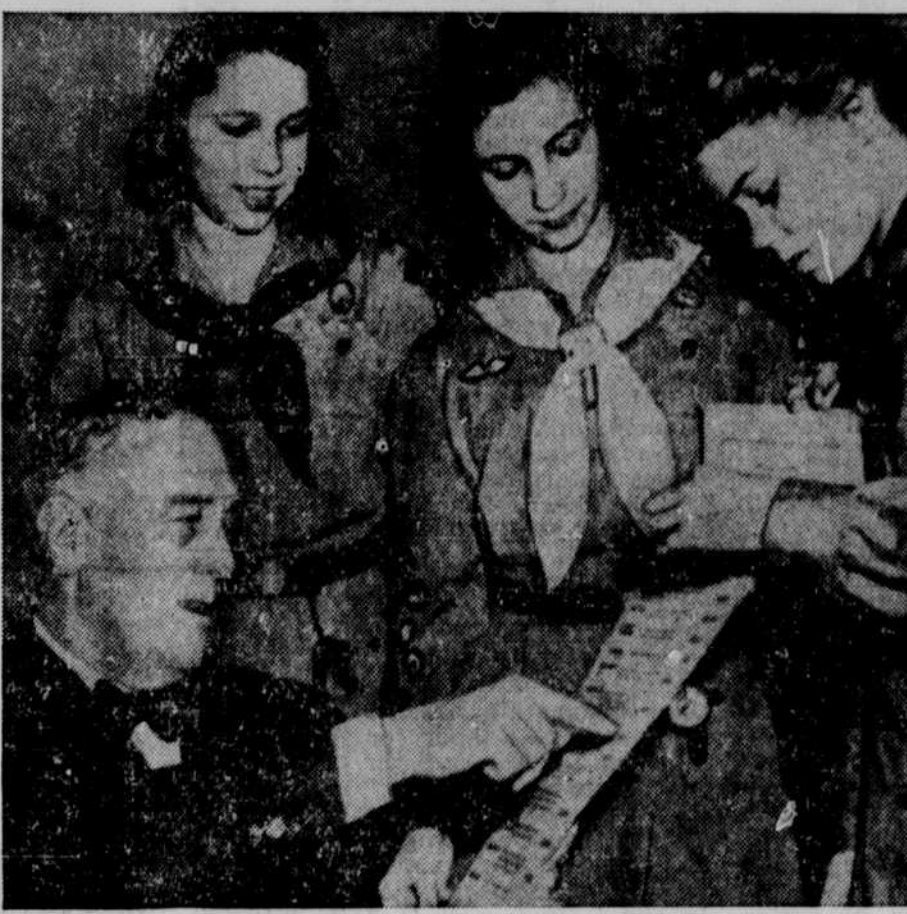
A "check" for 15,430,000 hours of service by Girl Scouts since Pearl Harbor was presented to the President by three Girl Scouts, who represented the 850,000 members of their organization. Attached to the check was an invoice listing the type of work the Scouts have done for their country in wartime.