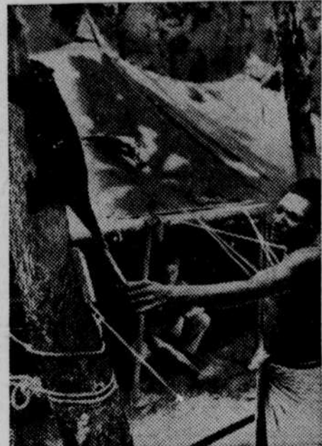
Their prowling through the tree-tops at night, which keep U. S. infantrymen in state of tension, have earned for banana bears the name "ghosts of Bougainville." Specimen shown here jumped from a tree onto a headquarters tent.