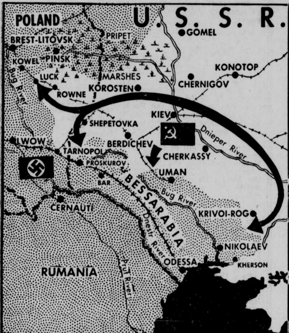
This map shows how the new Russian drive which ripped a 106-mile gap in the German lines south of the Dnieper bend, placing some 500,000 German troops in danger of capture or slaughter, may carry the Red army to the border of Rumania. From the north below the Pripiet marshes, one spearhead strikes towards Rumania via Tarnopol while another strikes towards Luck.