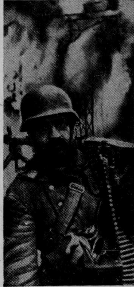
Bag-eyed with battle-weariness, a German grenadier shoulders his light machine gun against the usual "New Order" background of fire and destruction. This photo was taken in Zhitomir, Russia.