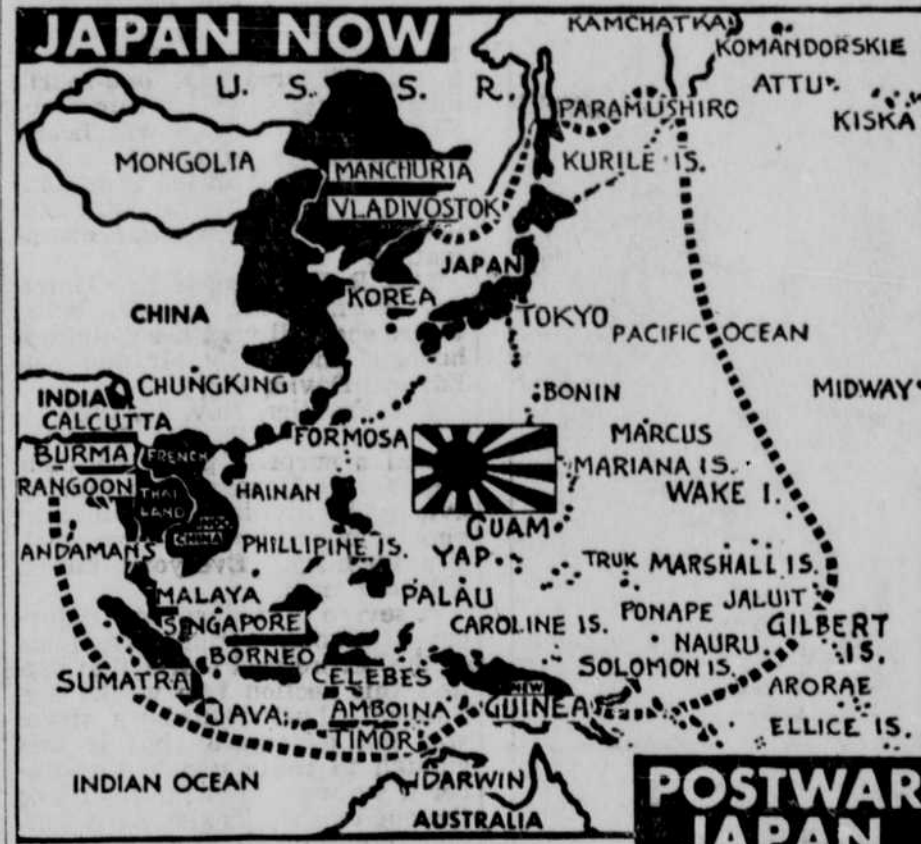
Roosevelt, Chiang Kai-shek, and Churchill decreed at their Cairo conference that Nippon will be stripped of Pacific islands seized or occupied since the First World War and China will reclaim such islands as Formosa, Manchuria, and the Pescadores. Within the dotted line of this map are the Jap-held properties of today. Inset is Japan of tomorrow. The trio stated they "have no thought of territorial expansion or gain for themselves."