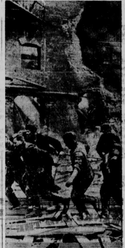
Shattered remains of a building are seen in this picture received through neutral Lisbon which also shows retreating Germans carrying explosives to a new target. This is a sample of the destructive techniques carried out by the Germans before they evacuate a town.