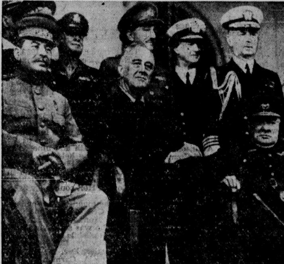
Premier Joseph Stalin of Russia, President Franklin D. Roosevelt of the United States, and Prime Minister Winston Churchill of England, as they appeared during their conference in Teheran, Iran, where they committed their peoples to full co-operation during the war and after it. Their declaration read in part: "The common understanding which we have reached guarantees that victory will be ours. And as to the peace we are sure that our concord will make it an enduring peace. We recognize fully the supreme responsibility resting upon us and all the United Nations to make a peace which will command the good will of the overwhelming masses of the peoples of the world and banish the scourge and terror of war for many generations. We came here with hope and determination. We leave here friends in fact, in spirit, and in purpose."