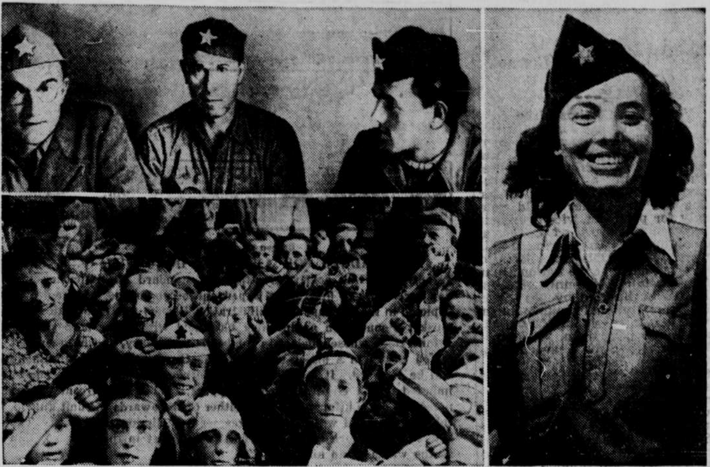
When British naval officers recently visited a Yugoslavian village held by patriot partisan forces they were taken to meet the commander (top left). At his right is his interpreter. Bottom left: Using the partisan army's clenched fist communist salute, Yugoslavian children greet the British officers. They wear the star-marked caps of their organization. Right: She doesn't look it, but this young woman has the reputation of being an outstanding sniper and anti-Nazi saboteur. Women like her comprise 25 per cent of the partisan army. No names are given to shield friends and relatives from possible Nazi reprisals.