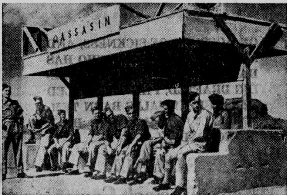
Hitchhiking is now organized on a military basis in the Middle East. A group of hikers is pictured at a "bus stop" in Cairo near the Suez canal. These shelters have been built at points on the main road traffic routes in the desert and here servicemen may rest until they find a military vehicle going their way.