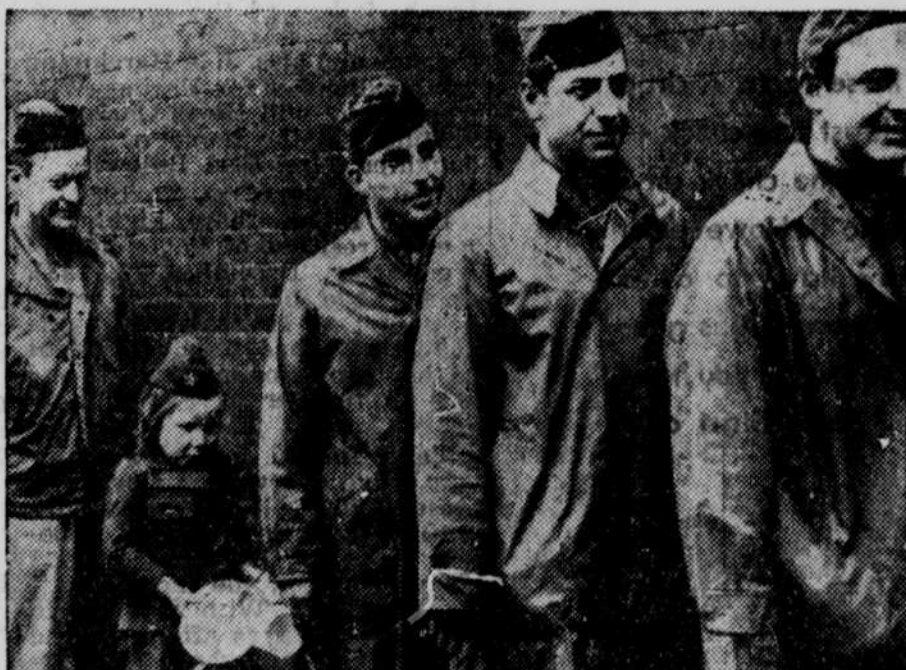
Under the auspices of the "Stars and Stripes" this little British war orphan enjoyed a day's outing with a U. S. quartermaster battalion which has adopted her. She is pictured somewhere in England standing in line for ciow with buddies.