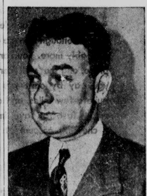
Charles A. Halleck of Indiana, who was unanimously elected by the Republican Congressional campaign committee to lead the 1944 presidential campaign.