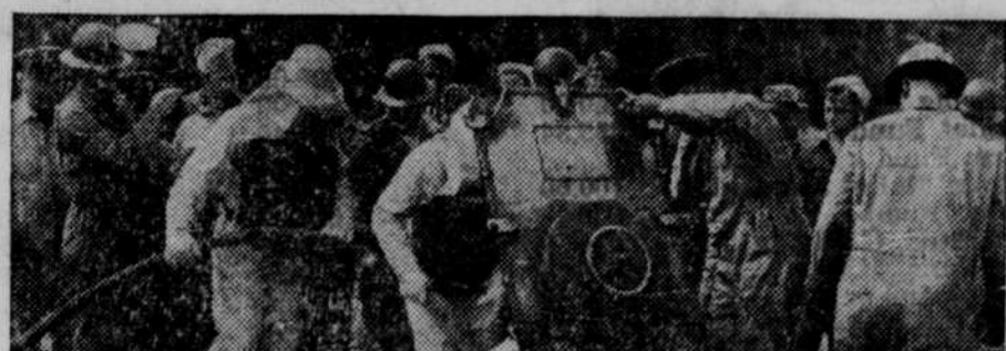
DOWN THE HATCH go asbestos clad fire-fighters and soon a blaze spreading below will be out.