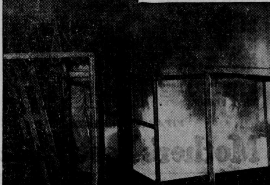
INFERNO—A member of the fire-fighting school is almost veiled from the camera by smoke arising from a roaring blaze below the decks of a training ship.