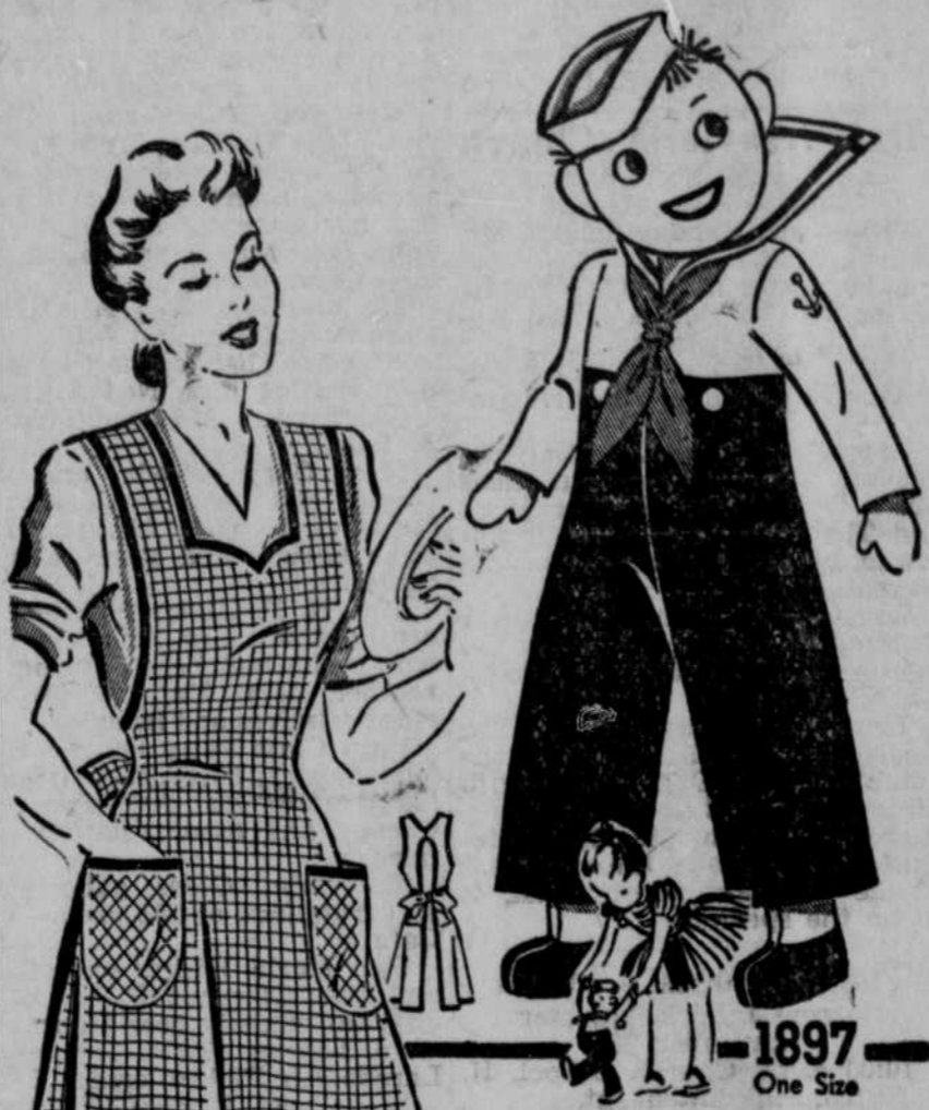
1897 One Size Happy Sailor

START toy making early—here's a doll which is easy even for beginners! First, make the 15-inch body, soft and cuddly, then outfit with the gob cap, middy and sailor pants!