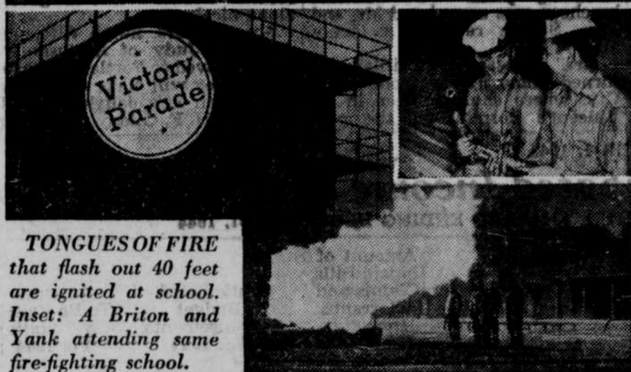
TONGUES OF FIRE that flash out 40 feet are ignited at school. Inset: A Briton and Yank attending same fire-fighting school.