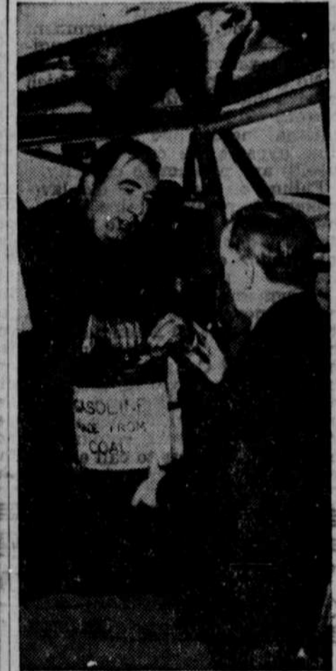
Gasoline made from coal was used in an airplane for the first time in the U. S. recently. It carried the plane from Morgantown, W. Va., to Washington, D. C. Senator Joseph O'Mahoney, Wyoming, receives a can of the gasoline from Representative Jennings Randolph.