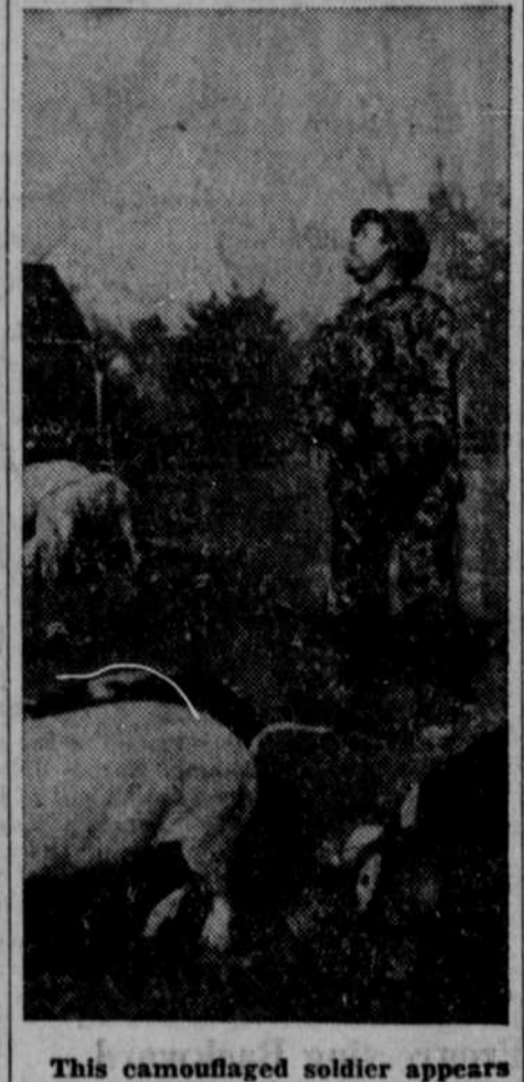
This camouflaged soldier appears to be hunting wild boars. Actually he is trying to spot an "enemy" plane during maneuvers in Tennessee. His uniform closely matches the hides of the spotted pigs.