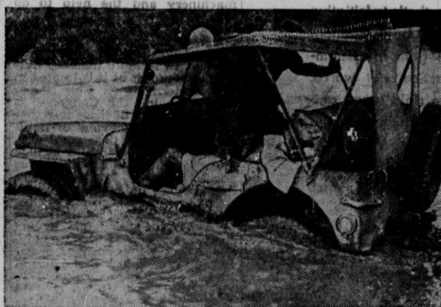
German troops destroyed a bridge near Caserta, Italy, to halt the advancing Allies. Their failure is illustrated by these British soldiers who run their jeep into the river and cross without the bridge. In an effort to protect their winter line, the Germans launched a series of furious counter attacks against most portions of the Allied Fifth army.