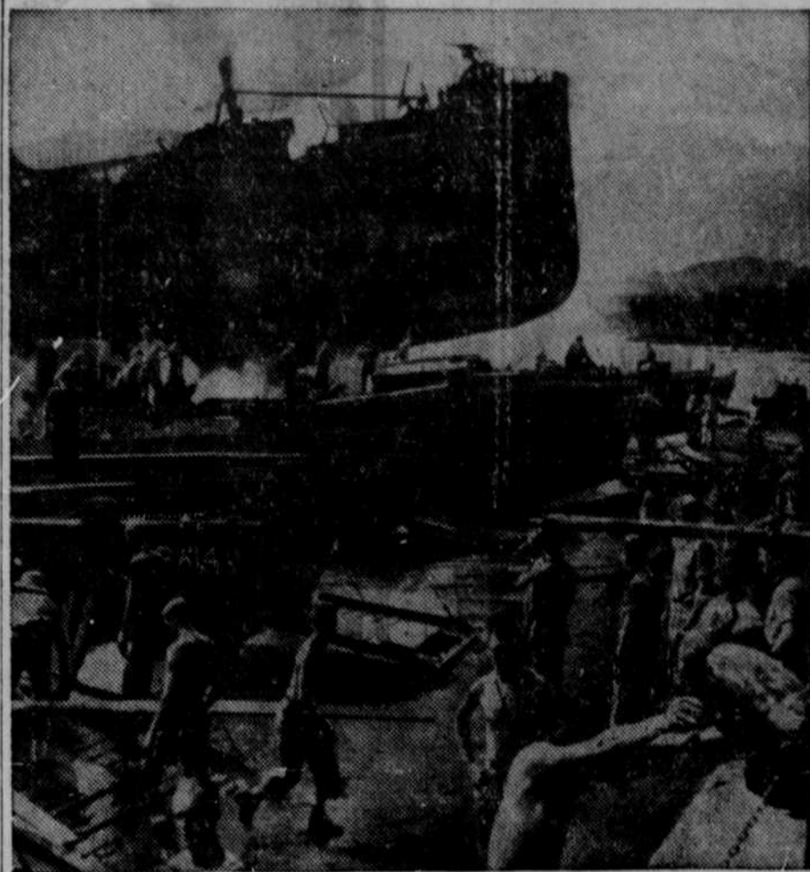
Japanese landings in the South Pacific, probably for the purpose of regaining the offensive, were foiled by United States forces. This sound-photo shows U. S. coastguardsmen and marines unloading supplies near a Jap warship, the Kinugawa Maru, which was beached after a battle. Admiral Nimitz warned the enemy of new offensives.