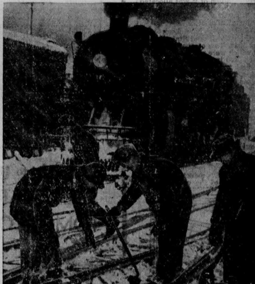
Early blizzards which swept the central west brought about the deaths of seven persons, five of them in Minnesota, where 11 inches of snow was reported in some localities. Track laborers are shown struggling to keep switches open in the Minneapolis railroad yards. Transportation and communication systems were stricken and most trains ran late.