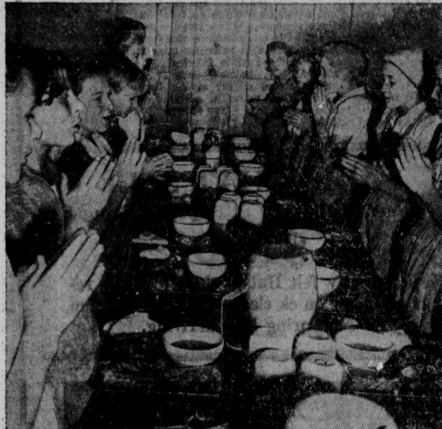
Although the words are not uttered in English they could readily be understood by a casual observer as these Polish refugee children say grace at a camp in Santa Anita, Calif. They are some of the 300 Polish refugee children who are on their way to Mexico where they will remain for the duration as wards of the Polish government in exile.