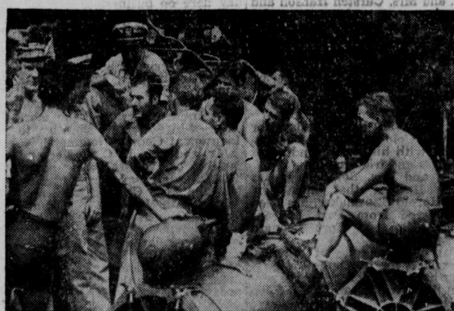
The morning after a night raid on Japanese objectives in the South Pacific, members of a patrol torpedo boat crew discuss the battle. This picture was made at a concealed base in New Guinea where the "Green Dragons," as the Japs call the PT boats, hide out between forays. The men are leaning on a torpedo tube.