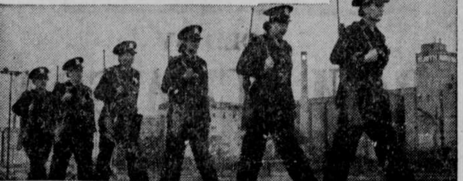
SINGLE FILE—With tommy guns slung over their shoulders vigiladies drill.