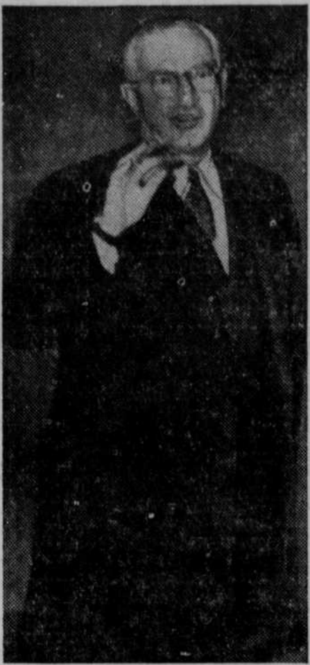
Nicholas M. Schenck, president of Loew's Inc., as he left federal court in New York, after testifying that he was forced to pay extortion money to a ring of racketeers. Eight men were on trial for the extortion of more than $1,000,000.