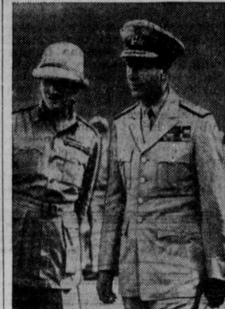
British Admiral Lord Louis Mountbatten (right), supreme Allied commander in Southeast Asia, is greeted by General Sir Auchinleck, commander in chief in India, as Mountbatten arrived in New Delhi. This will be Mountbatten's headquarters.