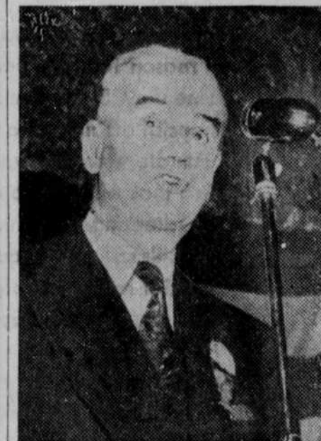
Philip Murray, president of the Congress of Industrial Organizations, opening the CIO's sixth annual convention in Philadelphia, Pa. CIO members now number 5,285,000.