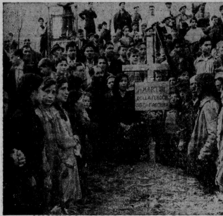
Mourning relatives gather around the fresh graves of 16 Italians who were killed by the Nazis in retaliation for the shooting of a German soldier. The soldier had stolen a chicken from a local family. Inscription on the cross reads: "They died from the forces of Nazism and Fascism." According to reports from Italy, this scene is common in many towns through which the Nazis are retreating before the might of Allied armies which were steadily rolling toward Rome and Berlin.