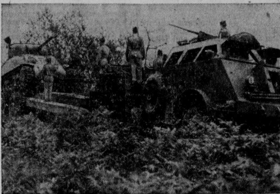
Wear and tear on our tanks is cut down considerably by this tank recovery vehicle which carries the tanks up to battlefronts. Thus, they enter an engagement with cool engines and full fuel tanks. The carrier is 58 feet long and weighs over 40 tons. It is armed for protection against enemy ground and air attacks. It carries enough ammunition and rations to enable the crew to operate independently for four days. The army has labeled this new craft the M-25.