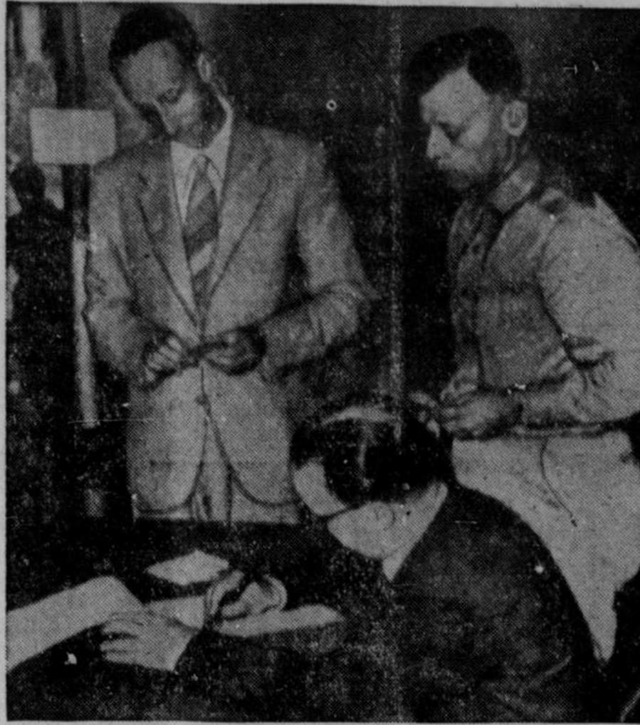
Gen. G. Castellano, chief of staff to General Ambrosio of Italy, is pictured as he signed the military armistice between Italian and Allied forces at advance headquarters of the Allied forces in Sicily. Witnessing the historic signing are Italian Foreign Minister Monteneri, and Maj. Gen. W. B. Smith of the United States. Brig. Gen. W. D. Strong, representing England, was also present but out of range of the camera.