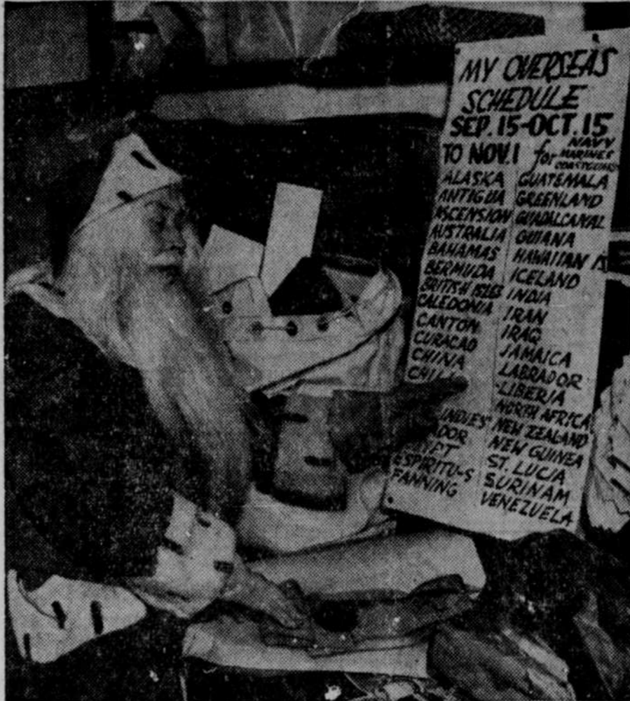
Santa Claus is shown in Chicago's Merchandise Mart, as he packs up for his coming visit to American battlefronts of the world. Many of his gifts are now on the way to soldiers stationed overseas. November 1 is the deadline for mailing presents to overseas sailors, coastguardsmen and marines.