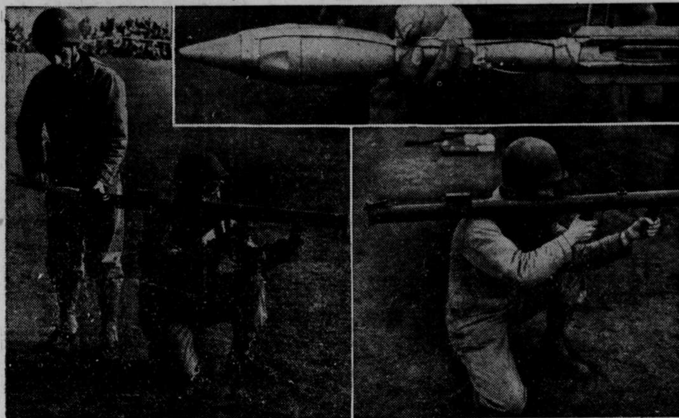
The similarity in the appearance of the army's new rocket gun to a popular freak wind instrument caused the gun to become known as the "Bazooka." Its official name is "Launcher Rocket, AT, M-1." It has enough hitting power to disable a tank, yet it can be used by one or two soldiers in places which are inaccessible to regular, large, anti-tank guns. Left: Loading a rocket into the rear of the Bazooka. Top right: This is the anti-tank rocket shell which is fired by the Bazooka. Bottom right: The proper way to hold the Bazooka. The new weapon is more than 50 inches long and approximately three inches in diameter. It is open at both ends.