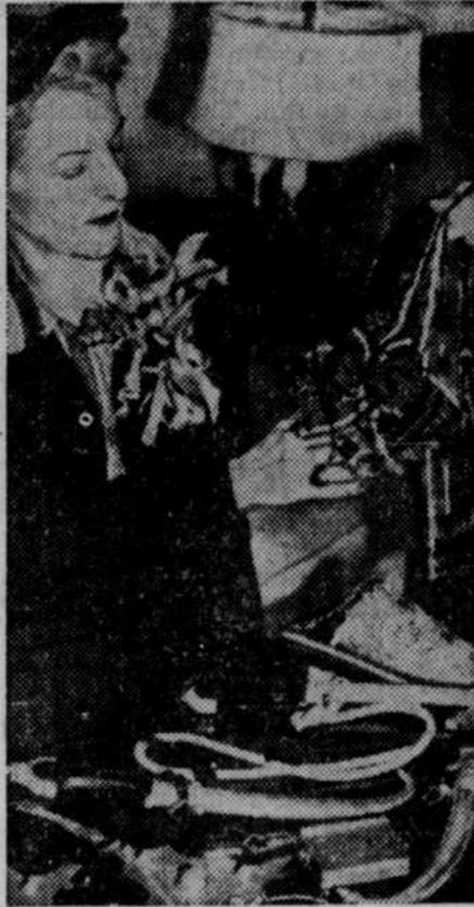
Mrs. Mark W. Clark, wife of the commander of the U. S. Fifth army, is shown with some of the souvenirs he sent home from North Africa. His troops were reported to be battling stubborn German resistance at Salerno, on the Italian west coast.