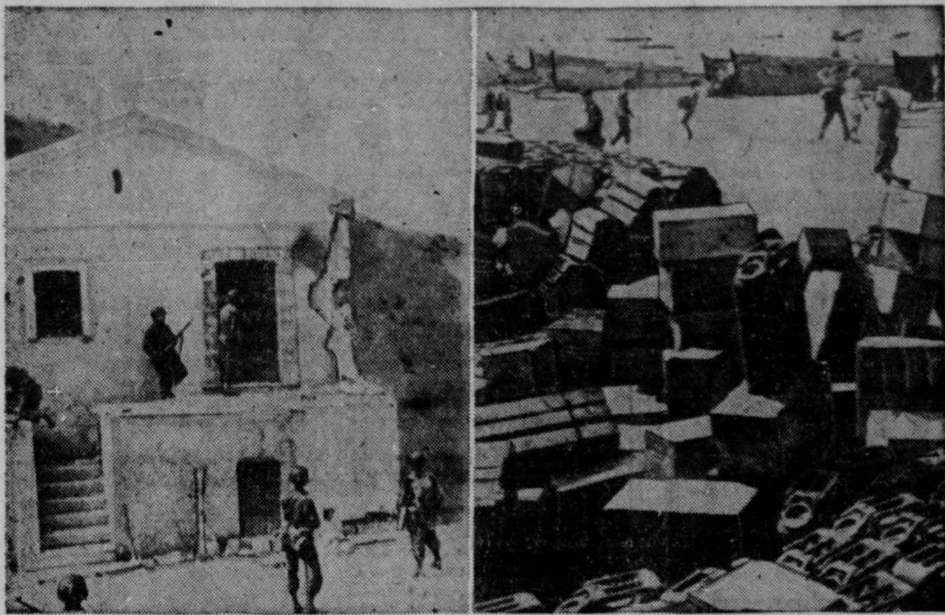
When the American Fifth army landed on the beach at Salerno it was subjected to some of the most desperate German fighting of World War II. For several days the Germans poured ammunition down on the beach. But the Fifth army held its position. Aided by planes and warships it gained the initiative and, as the British Eighth army rushed toward the fight, the Germans were apparently resorting to defense tactics. Left: U. S. infantrymen hunt for German snipers in this house during their advance in Italy. Right: Supplies for invading troops are unloaded despite constant strafing and bombing by German planes.