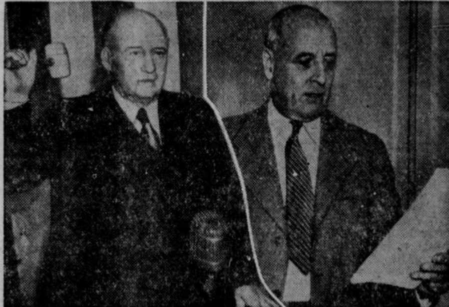
Speaker of the House Sam Rayburn is shown, at left, just before he reconvened the house for the present session of the 78th congress. Right: Rep. Andrew J. May of New York, chairman of the house military affairs committee, who was expected to introduce a bill to ban the draft of fathers and to bring about the discharge of fathers already drafted.