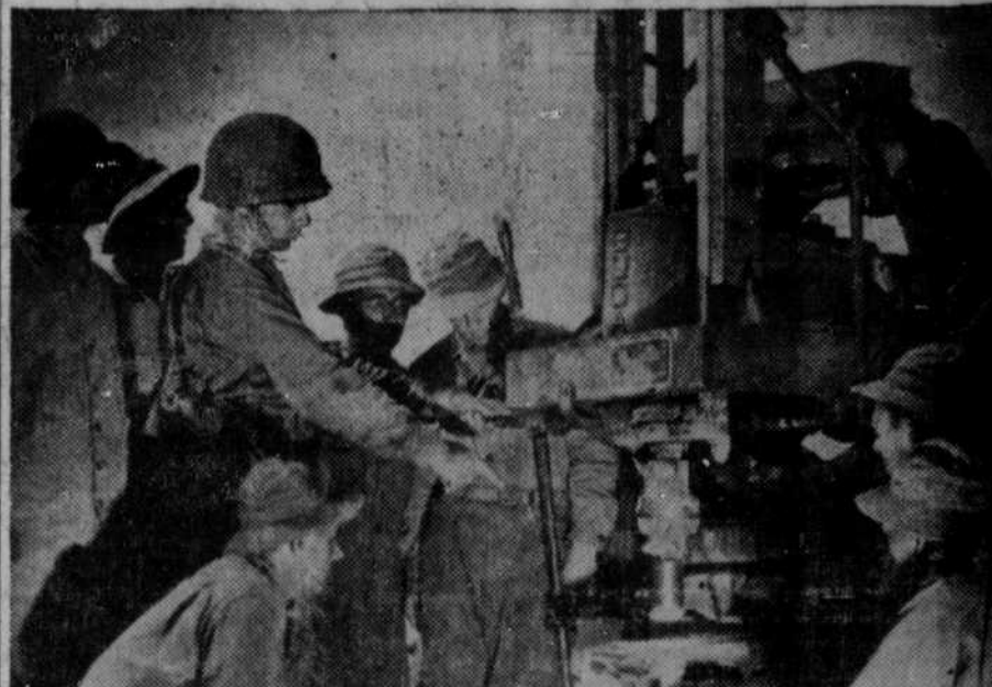
The best engineering equipment in the world is at the disposal of the U. S. Army Corps of Engineers, including lots of special-purpose machinery that's going to help in building the postwar world. The earth auger shown in the picture above is one of the machines the Engineers use to build and fight.

Volunteers for the Army Engineers are needed—men with skill as construction workers, mechanics, machinists, and over 150 similar specialties. These men will follow in the Army their civilian trade and help the Engineers build and fight for Victory.