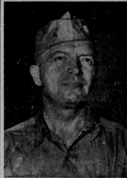
Lieut. Comdr. Harold Stassen, USNR, former governor of Minnesota, who recently became the flag secretary to Admiral W. E. Halsey, commander of the South Pacific force. This picture was taken shortly after Stassen's appointment.