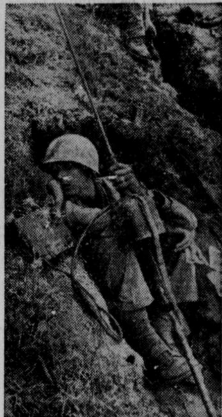
With shells fired by his buddies exploding nearby, this U. S. soldier in Sicily crouches near enemy lines and directs American artillery fire with his walkie talkie.