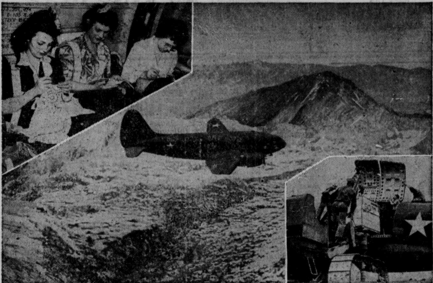
Planes of the Air Transport command carry men and material to every battlefront of the United Nations on rigid schedules enabling Allied armies to continue their advances and maintain supply lines. Upper left: An unusual cargo for an ATC plane are these women civil service employees who are being flown to a new post in a C-46 plane. Center: An ATC plane soars over Mount Whitney in the Sierra Nevada mountains. Rough terrain, rough weather, and extremities of northern and southern climates are no deterrent to this service. Lower right: A catpillar crane lifts a heavy box into one of the giant planes.