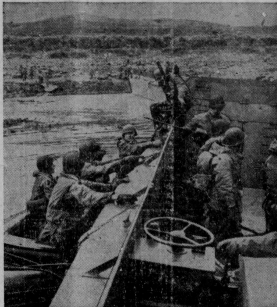
Moving speedily and cautiously, American and Canadian troops are pictured as they neared the island of Kiska on the first day of operations there. They are transferring to a landing craft. The Japanese, in their first such action of the war, made no attempt to defend the island. They fled, allowing the Allies to take it without a battle. According to Vice Admiral Thomas C. Kinkaid, commander of the North Pacific forces, the fall of Kiska puts America in an offensive rather than a defensive position in the Aleutians. This new victory makes the use of land based bombers against Jap bases in the Kurile islands more feasible.