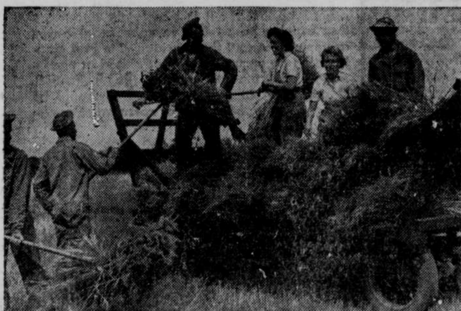
United States soldiers have volunteered to gather the harvest near their camp at Herts, England. Many were farmers before the war and are old hands at handling a pitchfork. English girls are pictured with the Yanks as they gather in the wheat.