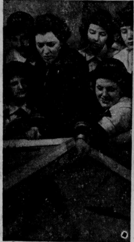
It's important for servicemen and women to be able to identify friendly and enemy ships. These WAVES are learning to classify a vessel by its outlines and salient features at Hunter college in New York, where the girls are conditioned to navy military regime.