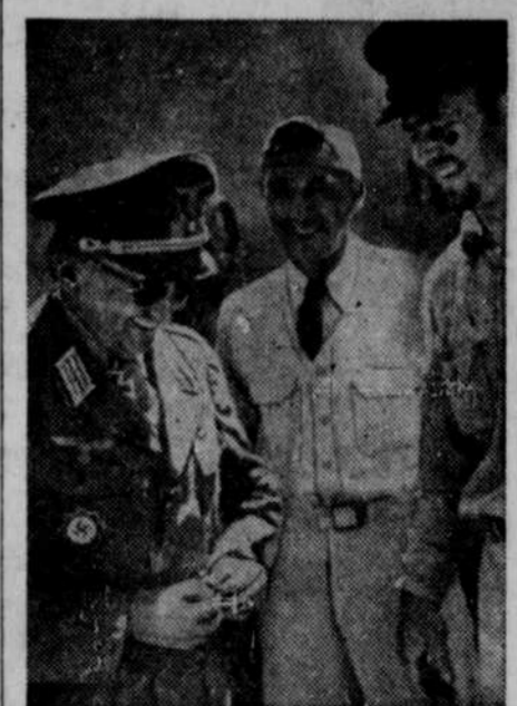
Although vanquished in battle, this German Afrika Korps officer is able to laugh and joke with a United States coast guard and naval officer as he leaves North Africa.

Persian Pastime Medieval Persians used to wager a finger on the outcome of one of their games. The loser would lop off the finger and cauterize the wound.