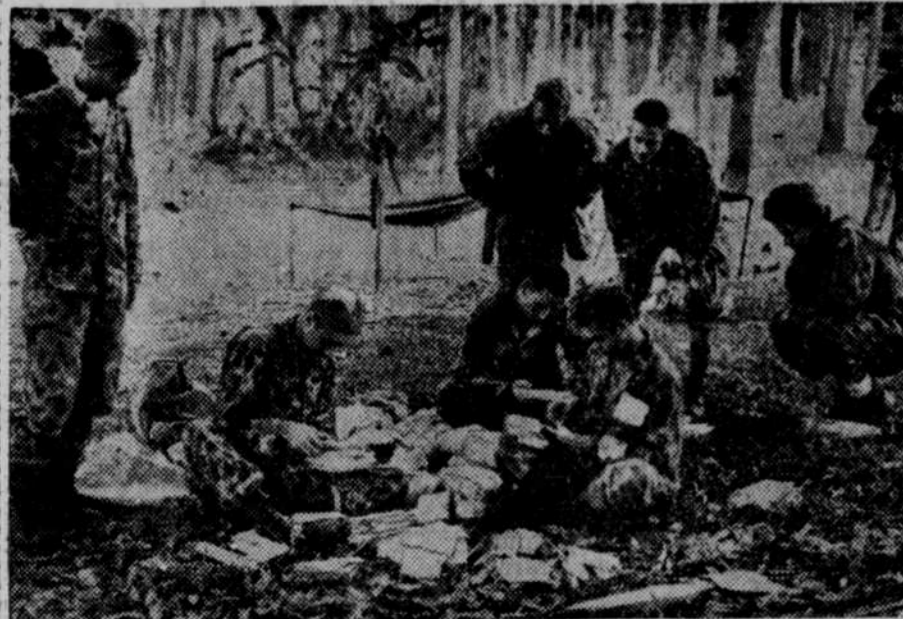
The greatest morale builder among military men—mail from home—is sorted out by men on New Georgia island just before they start out on a trek across mountains, jungles and swamps to surprise the Japs at Viru harbor. Capture of this strategic spot was the beginning of the end for the Japs on New Georgia island and the vital Munda air base.