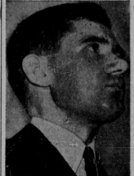
Andry Gromyko, who has been named to replace Maxim Litvinoff as Soviet ambassador to the United States. He has been attached to the Russian embassy and was in charge between Oumansky's recall and Litvinoff's arrival.