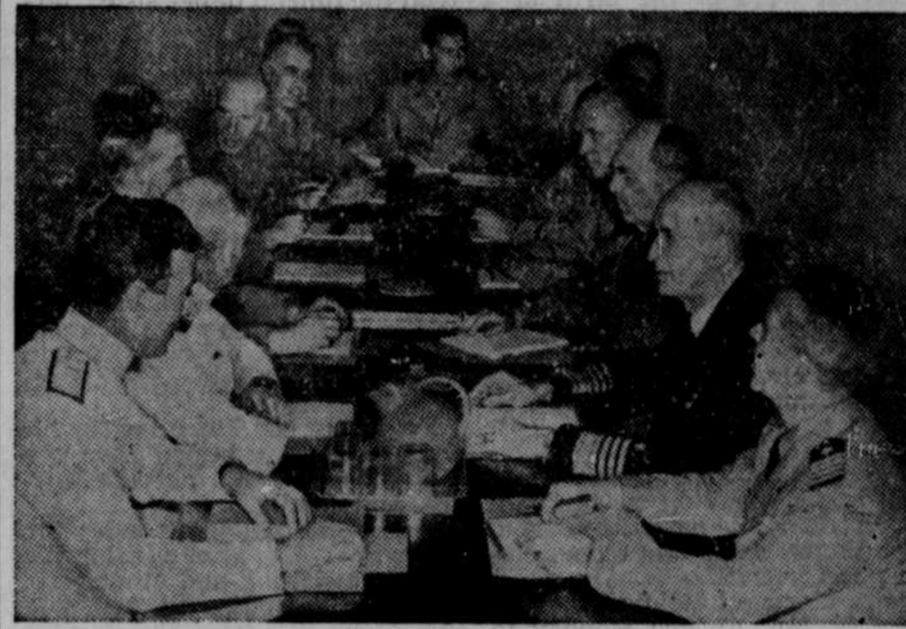
Chiefs of staff of the army and navy of the United States and Great Britain gather around a conference table to formulate new plans to cause the continued retreat of our common enemies. At the end of the Quebec conferences it was announced that "the military discussions of the chiefs of staff turned very largely upon the war against Japan."