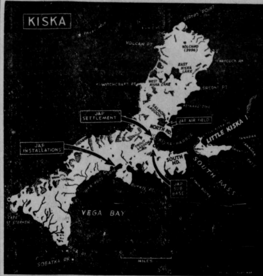
For the first time in this war, Japanese forces fled from a base without offering any resistance, and American-Canadian troops took over the Aleutian island of Kiska pictured above. This victory frees the North American continent from an immediate Japanese threat. The enemy at one time was reported to have 10,000 troops on Kiska. As in the Sicilian campaign, the area was shelled and strafed heavily by ships and planes. On 15 occasions naval surface units stood off shore and poured 2,300 shells into Japanese positions. Within 14 days various types of Allied planes raided Kiska 106 times, subjecting Japanese forces to the heaviest bombings carried out against them so far.