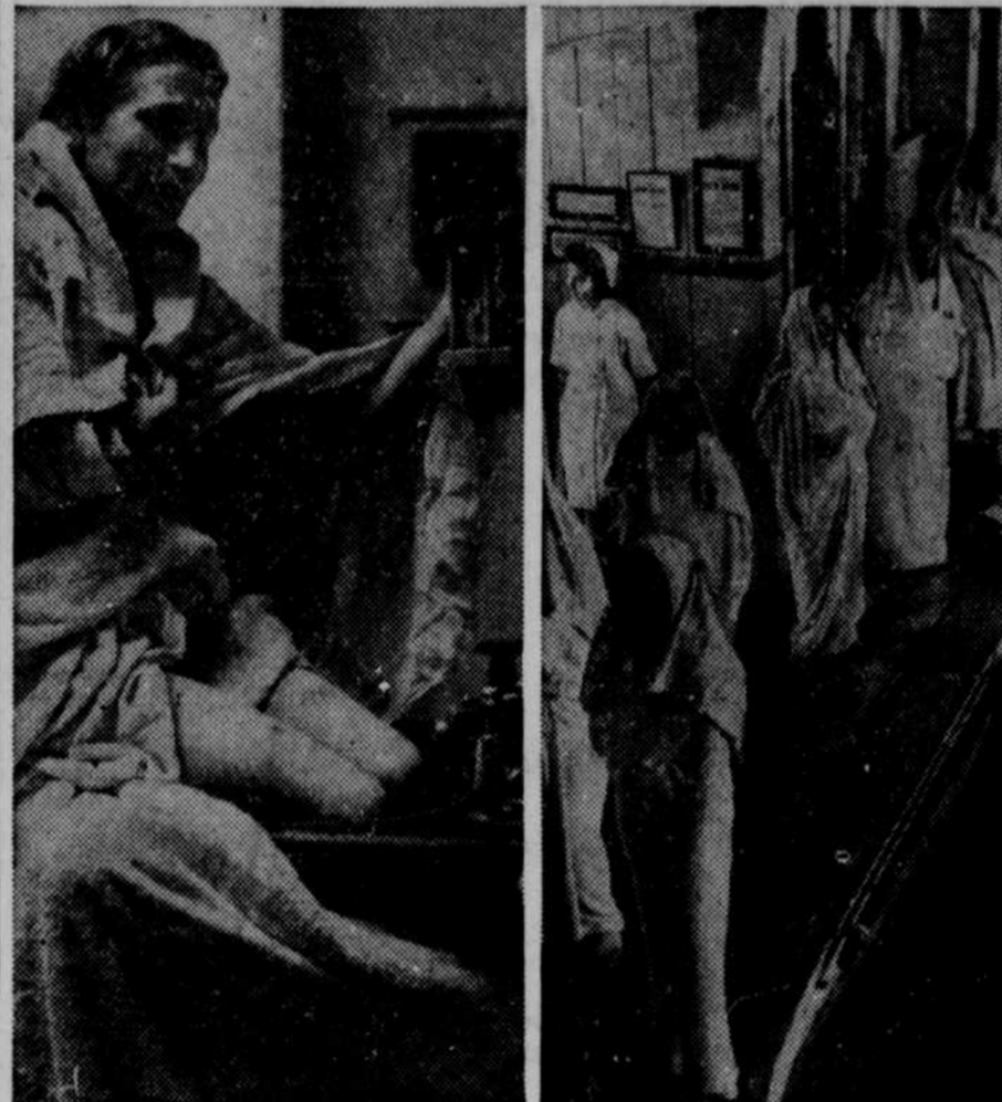
A new British policy for war workers gives them treatment at leading spas. Left: A mother of seven children uses an hourglass to time herself at the Droitwich Springs in England. Right: Wrapped like mummies, these workers are shown at the famed saline baths.