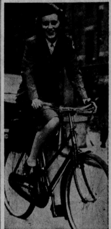
A bicycle is Miss Kathleen Kennedy's mode of transportation as she goes about her duties working for the American Red Cross in London. She is a daughter of Joseph P. Kennedy, former American ambassador to Britain.