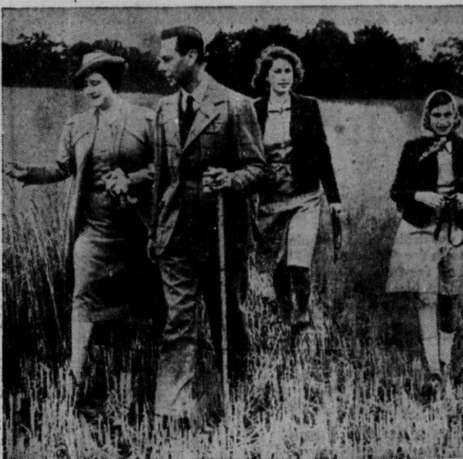
Even King George's private golf course has been plowed up to be used for cultivation under Britain's wartime production policy. He is shown with Queen Elizabeth, Princess Elizabeth (rear left) and Princess Margaret Rose, inspecting the crops being harvested on his former golf course.