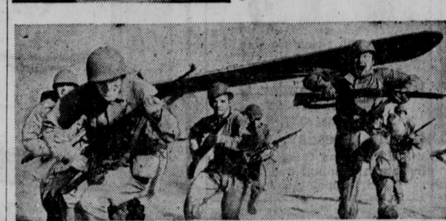
Troops leap from the glider and charge through a protective smoke screen to take nearby enemy installation by surprise. Just such attacks marked the largest air borne troop operations in history which began at about 10 p. m. the night of the Sicilian invasion.