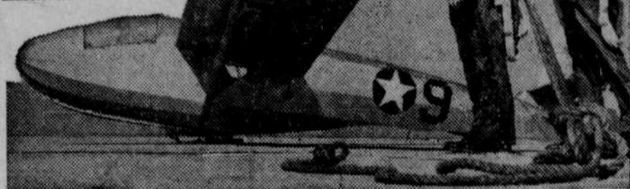
The training of glider pilots begins in light planes like this. After eight weeks they progress to larger sailplanes, the transport gliders.

High above Sicily groups of gliders dip earthward as silently as the air which flowed over their streamlined surfaces. They swoop to a stop in some remote farm field. Men, heavily armed quickly step from the gliders, then dash for cover. The only sound is the booming of nearby enemy and invading force fire. At the rear, enemy lines are thrown into confusion by a barrage from grenades and howitzers. The glider borne troops are at work. With its fire divided the enemy fails to stop the invading troops who take a beachhead and rapidly advance inland.