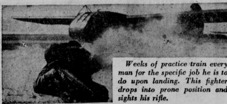
Weeks of practice train every man for the specific job he is to do upon landing. This fighter drops into prone position and sights his rifle.