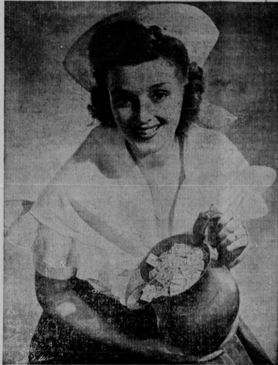
The modern Molly Pitcher will greet you throughout the nation on August 4th when brigades of Mollys will tag every buyer of War Bonds and Stamps. They will carry on the tradition of the Revolutionary War heroine who has gone down in history because she aided her fighters at the battle of Monmouth in 1776.