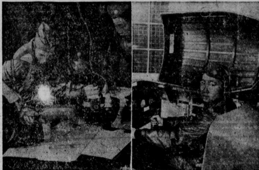
Cadets receive instructions before a routine training flight. They receive lessons in English in their primary training and learn aviation terminology in both English and Chinese. This young man is mentally flying without actually leaving the ground. He is learning instruction in flying in a link trainer which duplicates flying conditions.