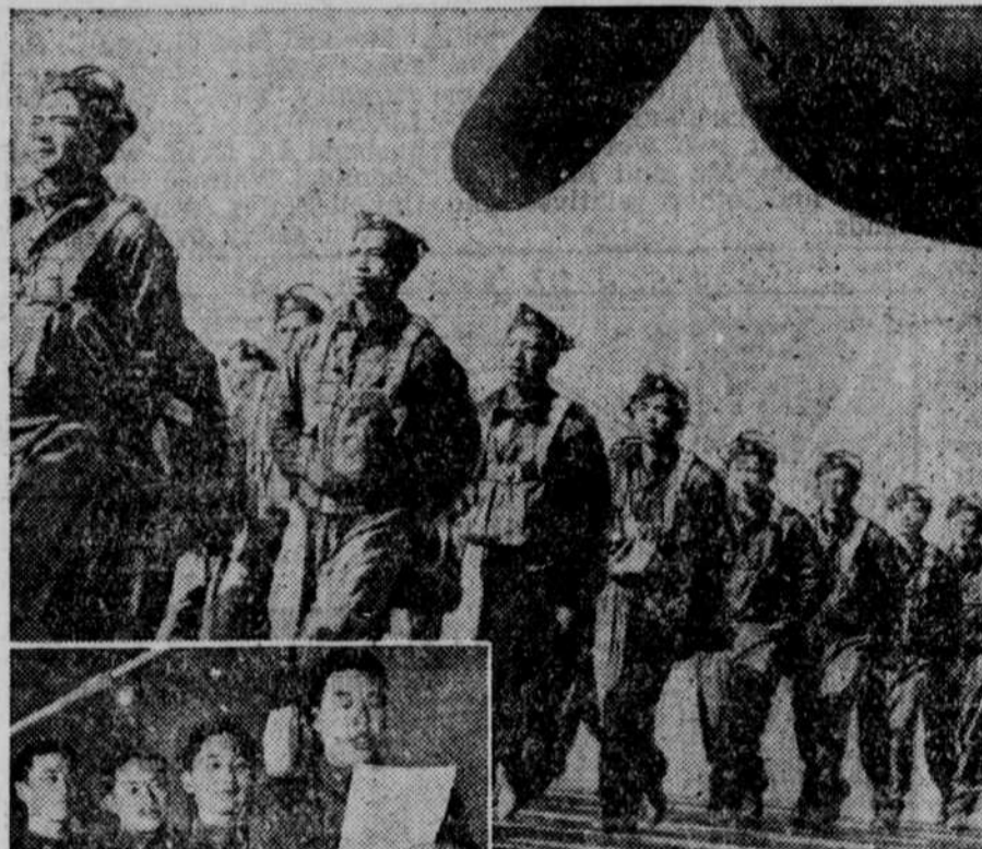
Military drill such as the contingent of cadets above are executing is taught by special Chinese officers who accompanied them from China. The cadets are carrying full equipment. At left, cadets record greetings to their relatives which will be shipped to China and broadcast there.