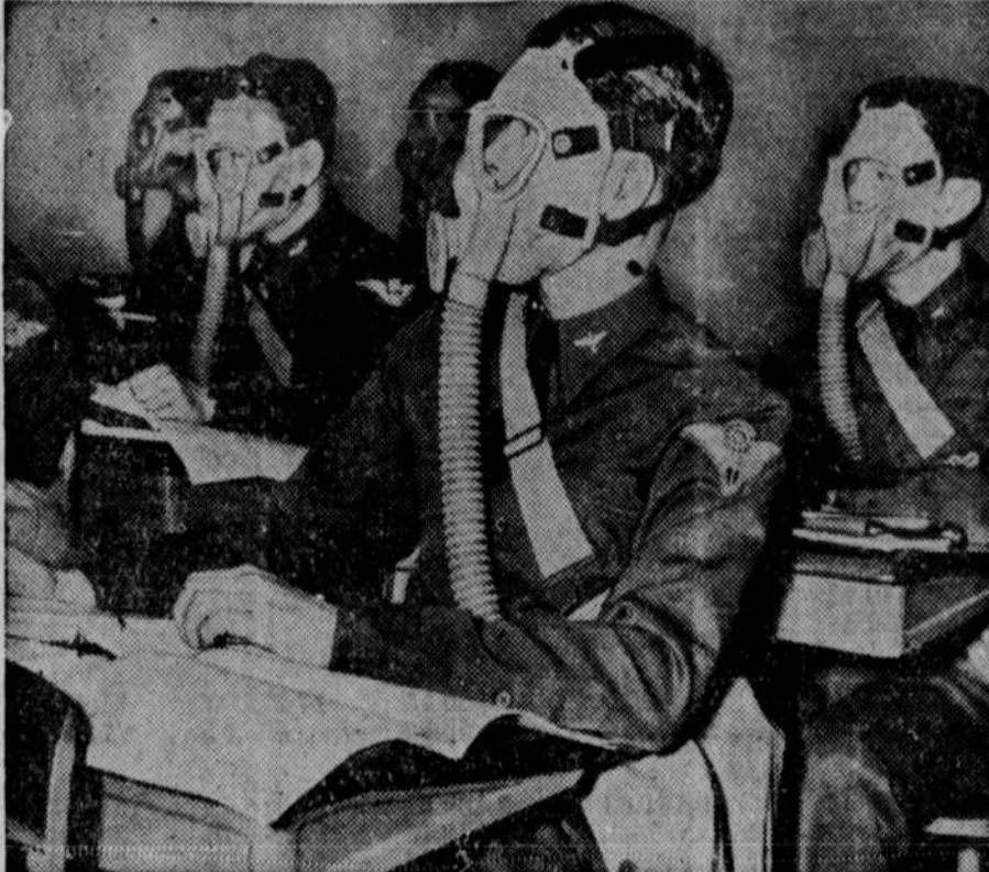
At Thunderbird field cadets wear gas masks in classrooms to make their training realistic. The Chinese front is the first area where gas has been reported used in this war. President Roosevelt issued a stern warning that we would reply in kind if our enemies used gas against our allies.