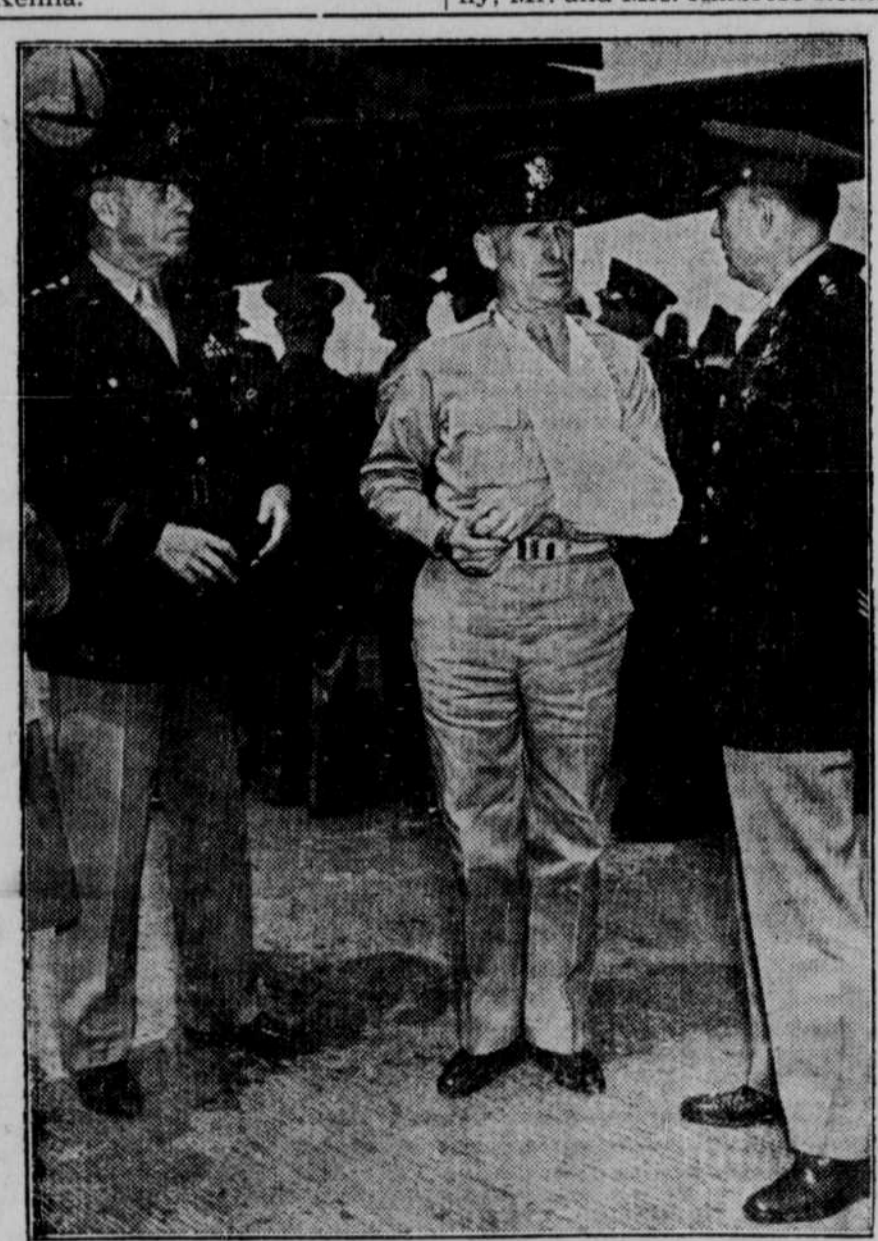
WOUNDED GENERAL RETURNS FROM BATTLE —Lieut. Gen. Leslie McNair, commanding Army Ground Forces, (center) wounded on the Tunisian front, relates experiences with Lieut. Gen. Ben Lea (left) and Lieut. Gen. Joseph T. McNarney (right), Deputy Chief of Staff.