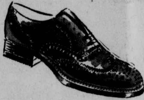
WELL-BUILT DRESS SHOES FOR MEN! $3.79

Comfortable open-toed unlined ghillies; tailored spectators for business and semi-dress; comfortable elasticized pumps for dressy comfort; and open-toed black gabardines for special occasions.