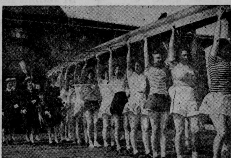
The historic Charles river in Cambridge, Mass., where Harvard masculine crews practiced and raced for many decades, is now the scene of a training headquarters for WAVES. A group is shown carrying their shell from the boathouse. They learn to row, handle a small boat, and other water lore.