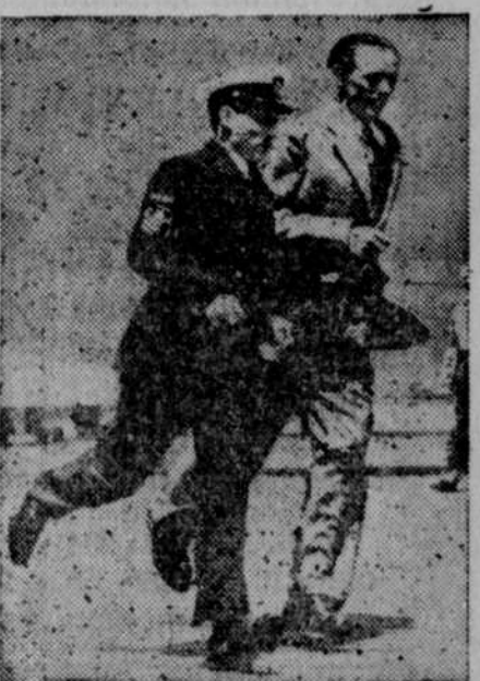
Gunder Haegg, Swedish distance runner, limbers up with Greg Rice, America's speediest two miler, after Haegg arrived in New York for the National AAU championship track meet.