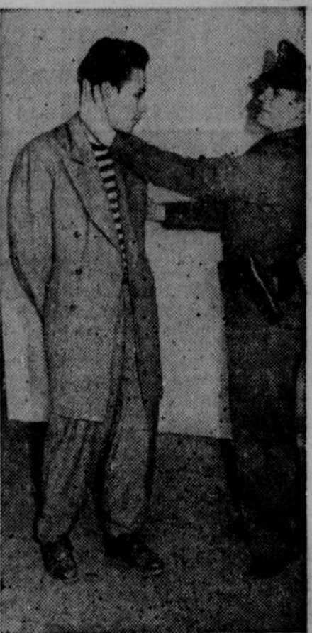
Servicemen and zoot suit wearers fought a small war of their own in Los Angeles, sending many youths like the one above to jails and hospitals. The servicemen were stripping the "zooters" in revenge for previous assaults.