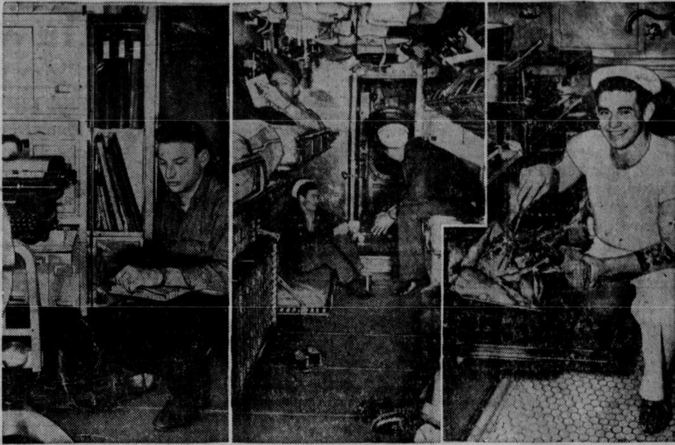
The USS Cuttlefish, a modern submarine, was built to provide comfortable quarters for its crew as well as to raise havoc with the enemy. Its facilities include a reception room, shower, and radios used solely for amusement. At left, a yeoman keeps records in the sub's office. Those records show that the Cuttlefish has sunk one Jap warship and three Jap merchant ships although it was launched very recently. At center is the crew's quarters, and at right, the cook smiles as he prepares turkey for dinner. The spacious engine room and other compartments of this sub belie the visions of cramped living conditions so often associated with submarines. The Cuttlefish is powered with Diesel engines and has the latest safety developments in its escape hatch.