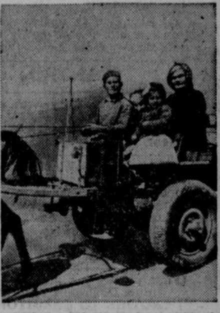
With the Axis cleaned out of North Africa, refugees like the ones shown above can move back into their homes. These people are returning to Bizerte aboard their carriage which is fitted out with springs, rubber tires, and a wheel assembly from a Rolls Royce automobile.