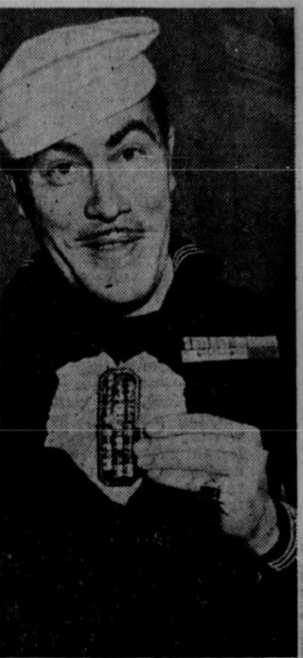
"You guys better get out of here while the getting's good." That's what the characters on this imitation leaf told the Japs on Kiska Island. The leaves were dropped by U. S. aviators to enemy forces who are supposed to have an aversion for the leaves, supposedly from a Japanese Kin tree.