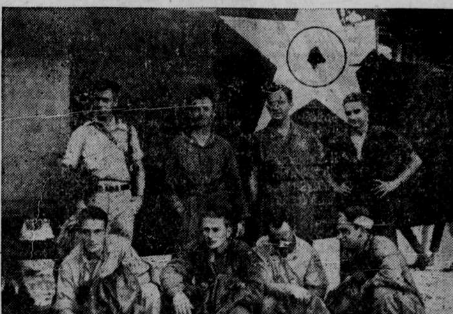
Officers and crewmen of a Liberator B-24 bomber are pictured beside their plane somewhere in the Southwest Pacific shortly after raiding a Japanese base at Gasmaja, New Britain. A Jap Zero pilot scored a bullseye through the center of the bomber's marking star but failed to bring the plane down. Four other heavy bombers took part in the raid.