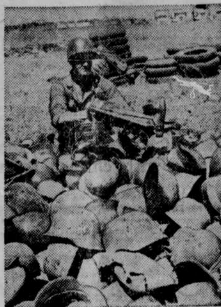
Apparently Axis troops are using one-legged men. An American soldier is shown examining an artificial leg which was left on a Tunisian battlefield by some German or Italian soldier who is literally on his last leg. Artificial limbs are a rarity on a battlefield where men are assumed to be in perfect condition.