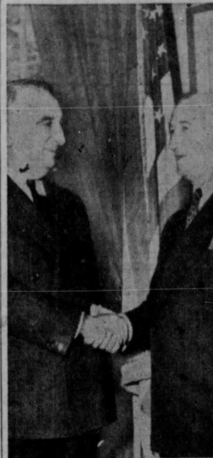
Judge Fred M. Vinson (left) who was named director of the Office of Economic Stabilization, replacing James F. Byrnes (right), who was appointed director of the newly created Office of War Mobilization. They are shown congratulating each other.