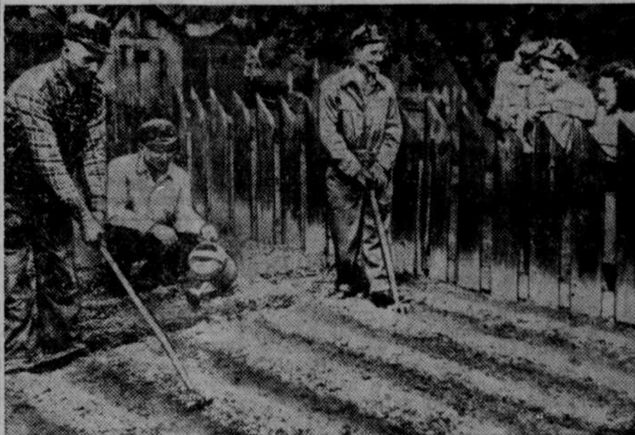
These coal miners are shown working on their victory gardens after leaving their posts in the mines. For the second time within a month virtually all mines employing UMW members were paralyzed by lack of manpower. A nation-wide dim-out to eliminate all nonessential use of electricity and a 25 per cent curtailment of all train travel were mentioned as possible coal saving devices should they be necessary.