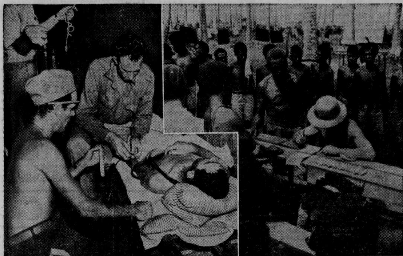
At the site of some of the bitterest fighting of the war, a senior medical officer of the United States naval construction battalion is shown, at left, giving a blood transfusion to a Seabee in a foxhole on Guadalcanal island in the Solomons. At right, several husky natives line up to receive their pay as stevedores. The Seabees—men of the naval construction battalion—are making a base of this island which was wrested from the Japanese after a long battle in which both sides suffered heavy losses in planes, ships, and men.