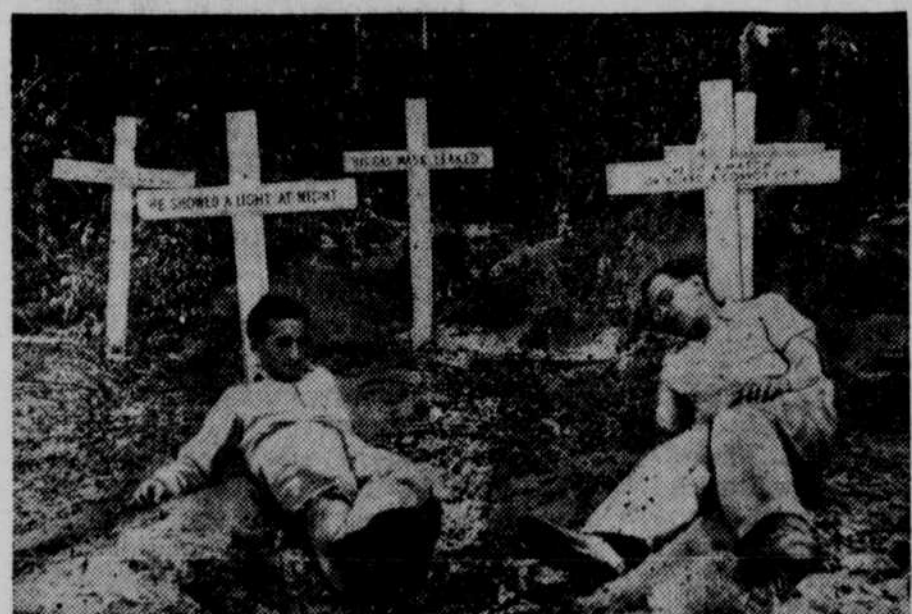
Two photographers recline in the "cemetery" at the army air forces school of applied tactics at Orlando, Fla. Serving as warnings to students about to engage in real warfare the epitaphs on the crosses read as follows: "He showed a light at night." "His gas mask leaked." "He lit a match on board a convoy ship." This school gives the final polish to army fliers by putting them under actual combat conditions.