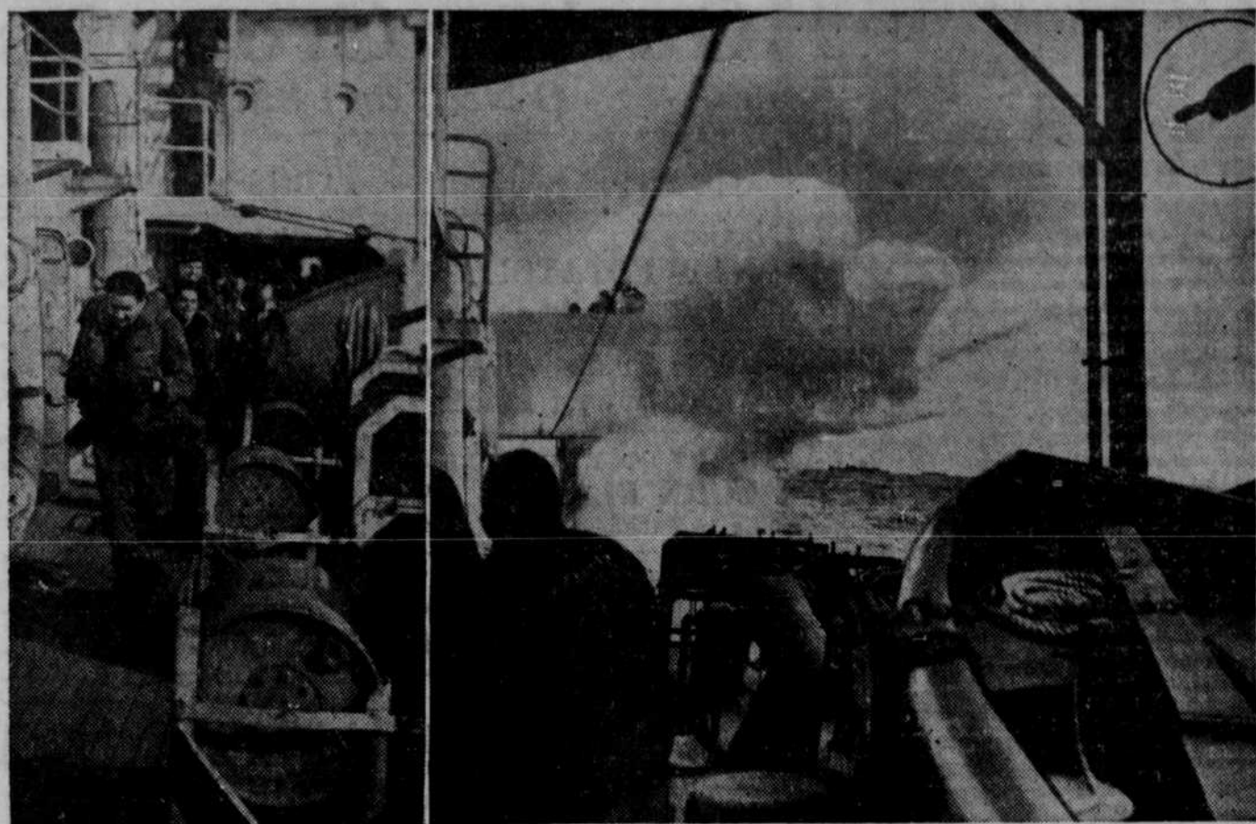
Crewmen aboard the United States coast guard cutter Spencer run to their battle stations (left) as a submarine is sighted attacking a convoy in the North Atlantic. Judging from the broad grins the men seem pleased to get a crack at the sub. Seconds later a depth bomb (right) is flying through the air from one of the Spencer's guns. The terrific concussion caused by the depth charge forces the submarine to the surface where the Spencer's guns are poised to deliver a final barrage which will send the undersea raider to its end.