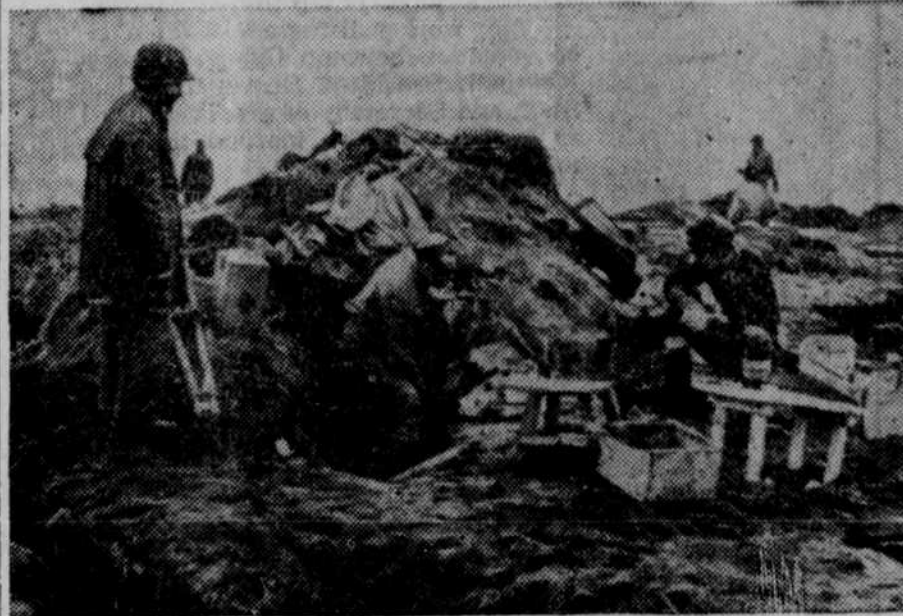
Holes like the one above connected with tunnels were the last posts occupied by the Japanese on Attu Island. These United States sailors are examining Japanese medical equipment left by the routed enemy. According to a Japanese radio broadcast the invading Americans annihilated all Japanese forces attempting to hold the island.