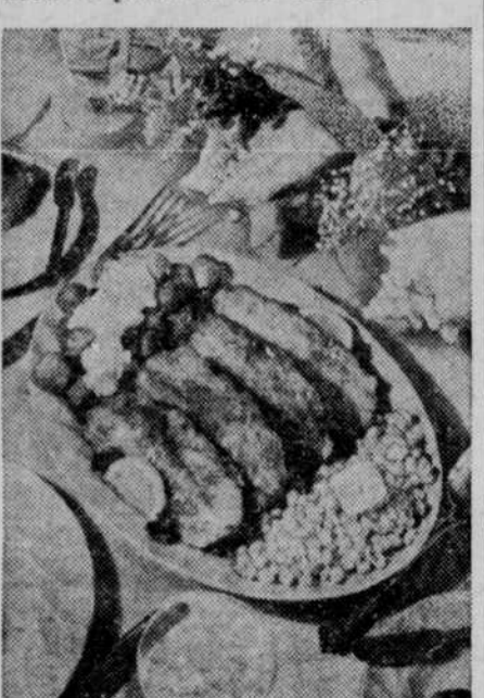
A platter of fish with broccoli and corn fulfills a good portion of daily dietary requirements.

Note: Chopped shrimp, flaked tuna or minced clams or oysters may be used in place of the salmon.