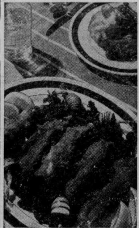
Fish fillets served with juicy lemon wedges and generous garnishes of radish roses and parsley make an attractive main dish.

Repairs on depreciation on the dwelling occupied by the farmer or on his personal or household equipment are not deductible. It is not permissible to claim as a separate item depreciation on livestock or any other property included in the farmer's inventory, as such depreciation is taken care of in the reduced amount of the inventory at the close of the year. However, depreciation may be claimed on livestock acquired for work, breeding or dairy purposes which are not included in the inventory of livestock purchased or raised for sale.