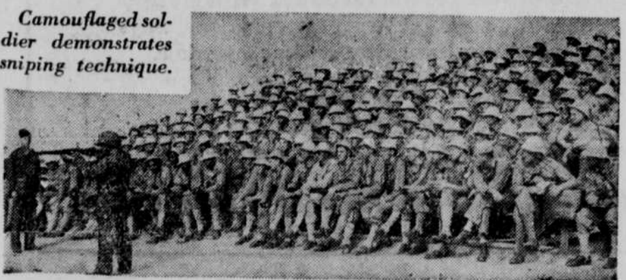
Camouflaged soldier demonstrates sniping technique.