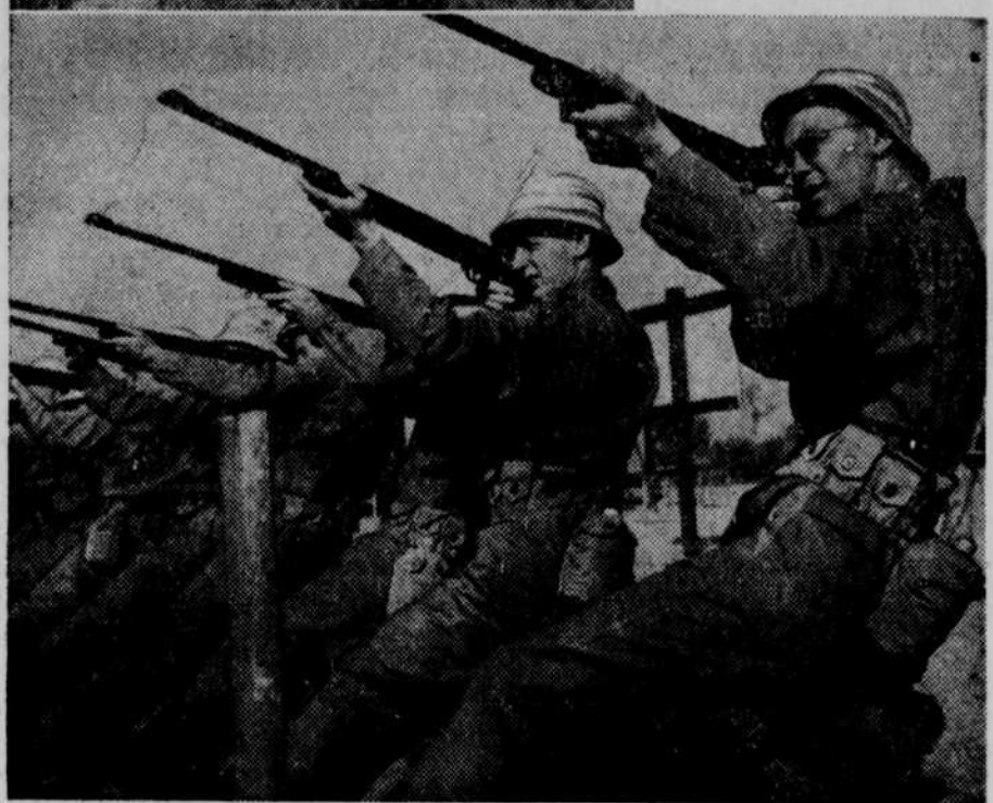
Here the officer candidates learn to shoot straight and fast. They are following a moving aerial target in the course of training in anti-aircraft firing.