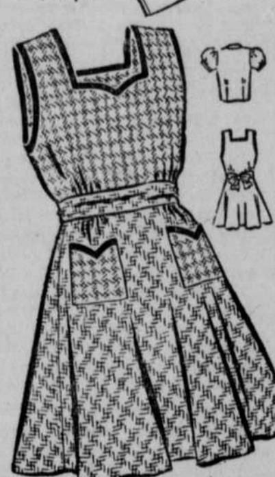
Blouse and Jumper.

HERE'S a juvenile jumper outfit which has extra prettiness—in the soft, curving lines of the jumper and in the round Peter Pan collar and short puffed sleeves of the blouse. Any little girl will look "nice as pie" in it—yet it is very practical and can be made at next to nothing cost.