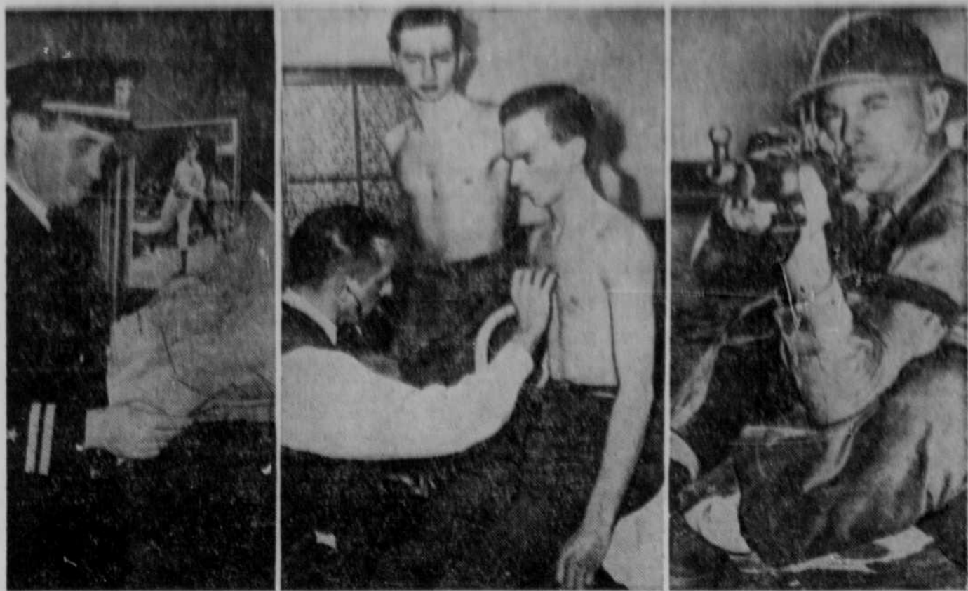
Men in all walks of life are answering Uncle Sam's call for fighters. In photo at left, Lieut. Charles Gehringer, former Detroit Tiger slugger, is shown leaning on a wall decorated with baseball photos as he studies a map of the United States. Center: Two sons of the late emperor of Austria and Hungary are examined at Fort Myer, Va., for induction in the U. S. army. They are Karl Ludwig Hapsburg and Felix Ludwig Hapsburg (seated). The boys enlisted as privates. Picture at right shows Stirling Hayden, yachtsman husband of Madeleine Carroll, slinging lead on the rifle range at Parris Island marine corps recruiting station.