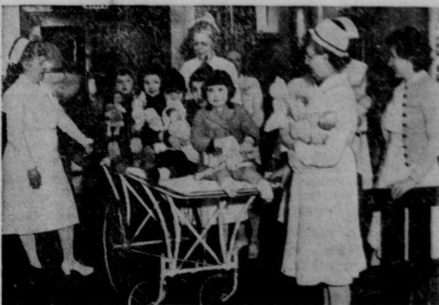
With severe cuts in fuel rations of non-residential users in eastern states bringing supplies to about 45 per cent of normal, the Neponset children's hospital at Rockaway, N. Y., was emptied of its little patients so the hospital could be closed. Bedridden evacuees are shown being carried from the hospital.