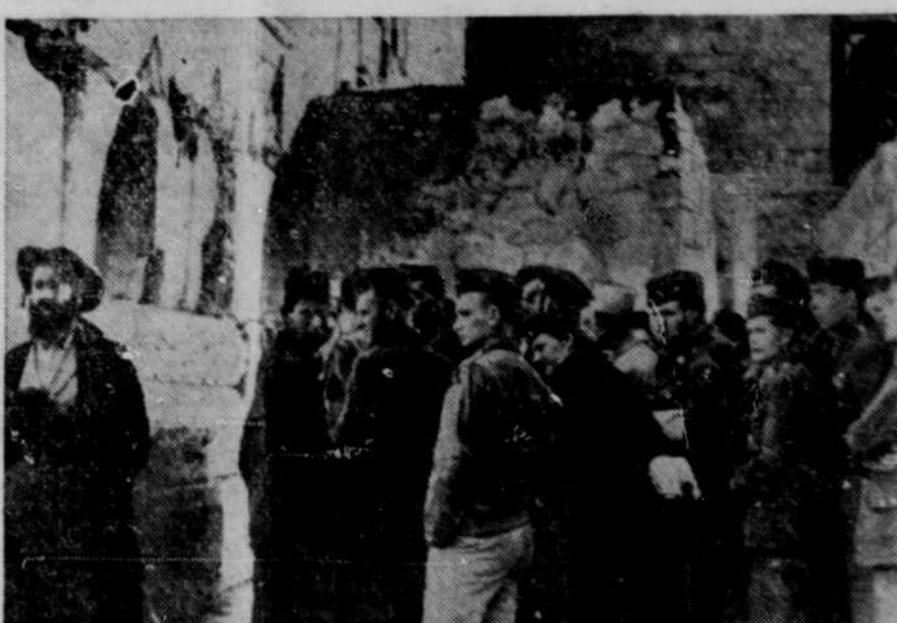
Taken on a tour of the Holy Land by the hospitality committee of the Jewish agency for Palestine, these American soldiers are shown at the famous wailing wall in Jerusalem, the only existing relic of Solomon's temple. They are watching a bearded "chacid" (left) devoutly saying his prayers.