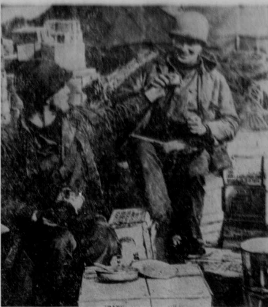
Alaskan scouts dine outdoors in season in the Aleutian Islands. "In season" means when it isn't raining there. For a warm current in the Pacific (we used to call it the Japan current) keeps snow and frost from the bleak islands, but it encourages rain—and how! Here one of the scouts passes a piece of cherry pie to his pal.