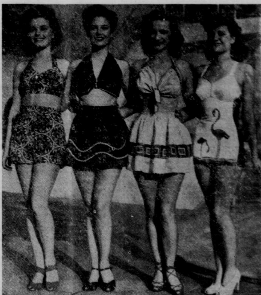
Just to remind you that somewhere in the world the sun is shining, and that it'll be shining on you, too, some day, presented here is a preview of what the well dressed mermaids will be wearing on the beaches next summer. This preview took place at Los Angeles, where it is summer most of the time.