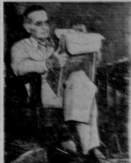
Adm. William F. Halsey predicts complete victory over the Axis in 1943. He warned the dictators, "We are just starting now." Of Tojo, he said: "You started something which will make you wish you had died when you were a baby." Admiral Halsey is shown above, in his new quarters in the South Pacific.