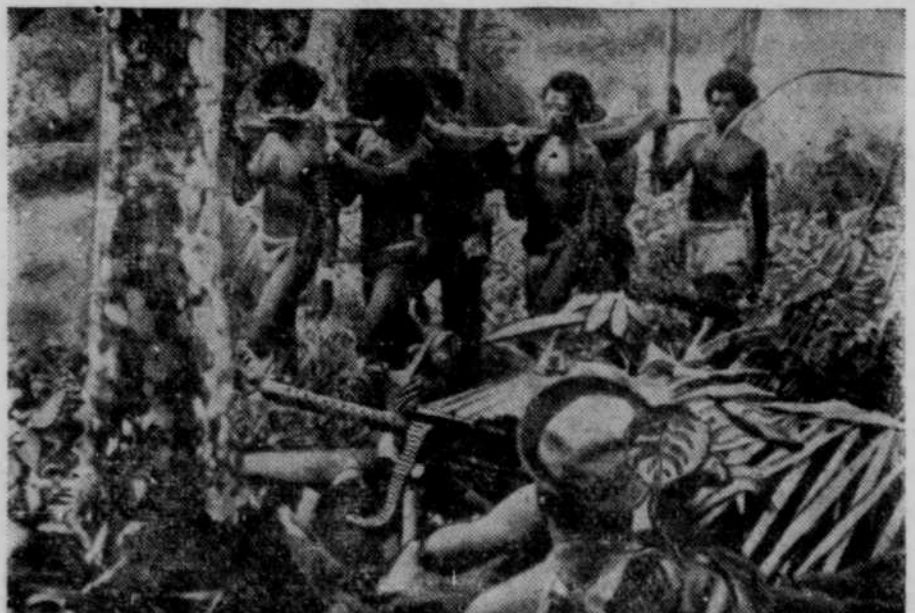
Natives, who know New Guinea territory even better than the jungle-hardened Aussies and Americans, carry the wounded past a machine gun nest. Transporting the injured from the line of battle is merely one important function of these dark-skinned men and boys who act as porters, guides and carpenters.