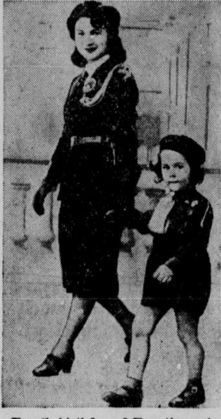
Fourth birthday of Egyptian princess, Ferial, was a happy one. Ferial is shown with her mother, Queen Farida, in their girl guide outfits on the palace balcony, where they reviewed a birthday parade by that organization, which is similar to our Girl Scouts.