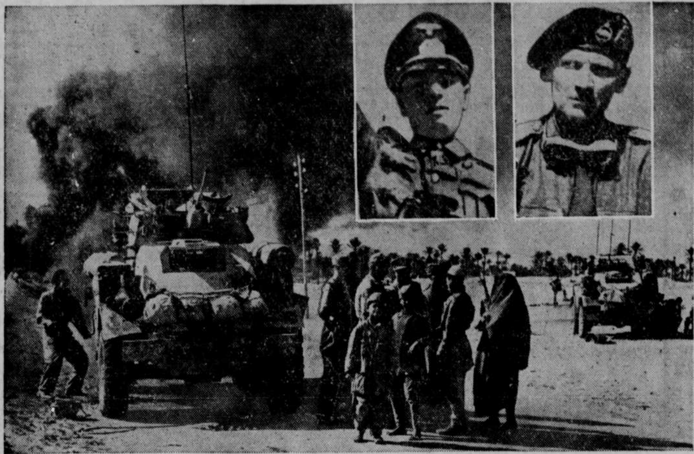
Britain's eighth army has been hard on the heels of Gen. Erwin Rommel's much-vaunted Afrika Korps, pushing them westward towards Tripoli. Photo at left shows local Arabs, friendly to the once-again-invading British army, gathered around British armored cars when the British occupied a wrecked town in the Libyan desert. Dense smoke from a burning tank fills the background. Insets: Left, General Rommel, leader of Axis desert forces, and Lieut. Gen. Bernard Montgomery, commander of Britain's eighth army.