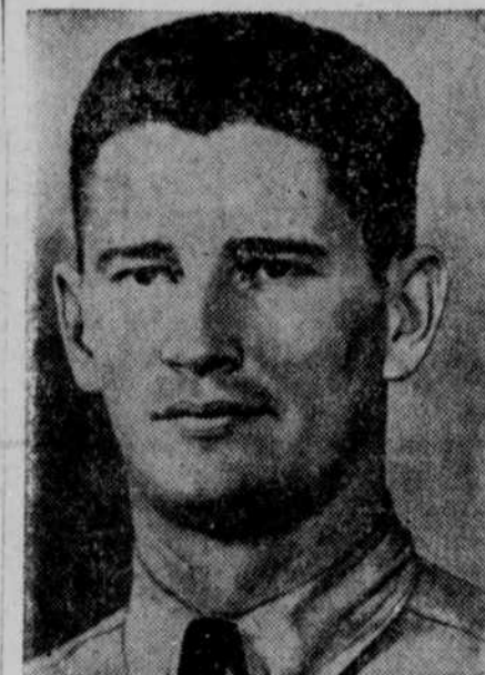
Capt. Joe Foss, 27, of Sioux Falls, S. D., who is the champ of all aces stationed on Henderson Field, Guadalcanal. Foss has shot down 22 of the 450 Jap planes bagged at this base.