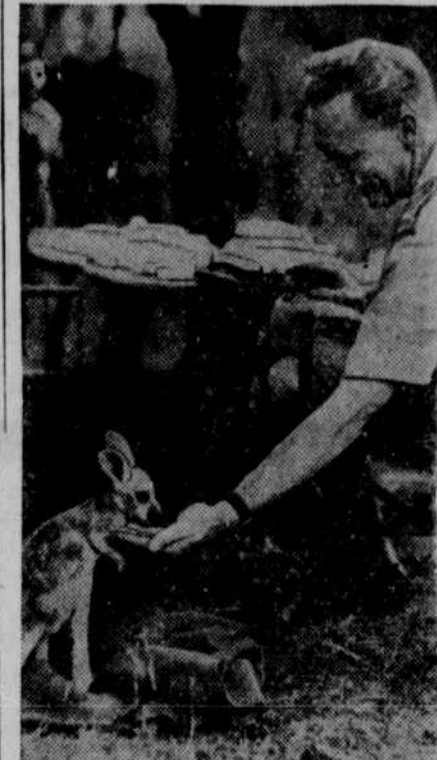
The gagster who accused this baby kangaroo of being kicked out of its mother's pouch for eating crackers in bed, might know by this picture that the youngster, despite the fact that it is on its own, is doing very well, thank you. Open air mess is picnic time, and a generous officer like this one (commander of an Australian armored division) proceeds to make life easy for the baby vagabond.

SING A SONG OF KITCHEN THRIFT SINK YOUR DIMES IN WAR SAVINGS STAMPS