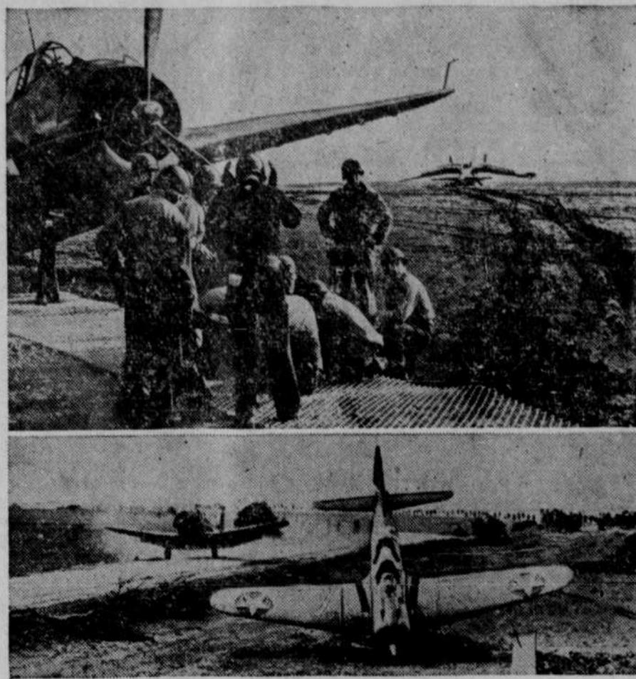
The airport at Safi, French Morocco, offered hard going for navy planes which landed as the field was captured from the French. In picture at top, men are laying a metal strip for takeoff of the torpedo bomber before which they are working. These metal strips have since played an important part in Allied air operations in Tunisia. Below: A navy dive bomber lies nose-down in a ditch near the Safi airport. Another takes off, using the roadway for a runway.