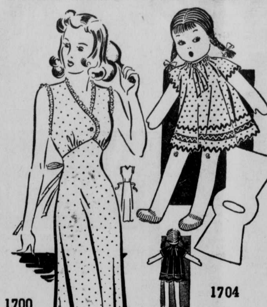
1700 Gown and Jacket 1704

goes along to be snuggled! Here's a grand gift for very young children.