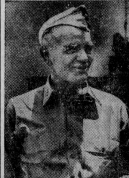
Vice Admiral William F. Halsey, whose smashing victory in Round 2 of the Solomon Islands battle eliminated many Jap warships. Halsey is a sailor's sailor and doesn't follow any of the rules.