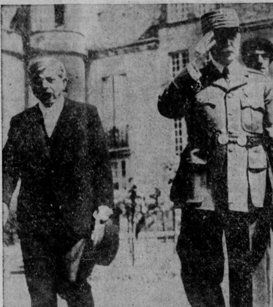
This photo, published in a German propaganda magazine, shows Pierre Laval with Marshal Petain, aged chief of state of France, as they inspected troops at Vichy before the Nazis took over what was left of France. Petain solemnly named Laval fascist dictator and Petain's presumptive heir to replace Admiral Darlan who "sold out" to Allies.