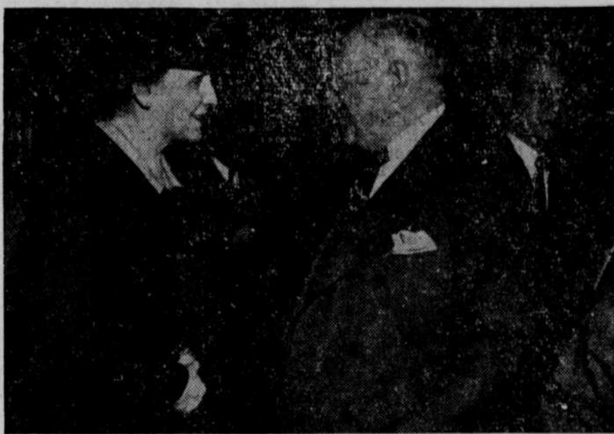
Mrs. Nellie Taylor Ross, director of the U. S. mint, chats with Sen. Robert Wagner of New York, chairman of the senate banking and currency committee, when Mrs. Ross appeared before that committee to testify. The group is considering a request for authorization to substitute other materials for the strategic metals now used in minor coinage.