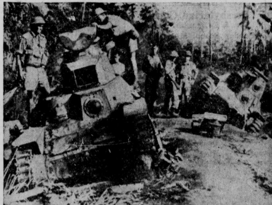
Australian and American soldiers inspect Jap war tanks knocked out in the New Guinea jungle, where the brown invader is being pushed back to his beach-heads, after advancing almost to Port Moresby. These tanks are lightly armed and very vulnerable.