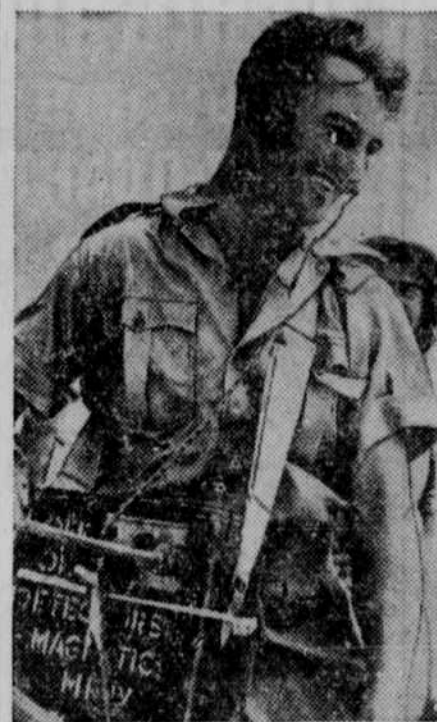
Mines, which take the place of barbed wire, are playing an important role in the war on the African front. The British mine detector is the best bet to counteract these hidden monsters. When the device detects a mine, certain sounds reach the earphones of the sappers, and they go and render the mine useless. Their work requires an unusually high degree of skill and courage. The detector, until now a little mentioned weapon, played an important part in the recent Allied victory in Egypt. Picture shows a sapper holding a mine detector.