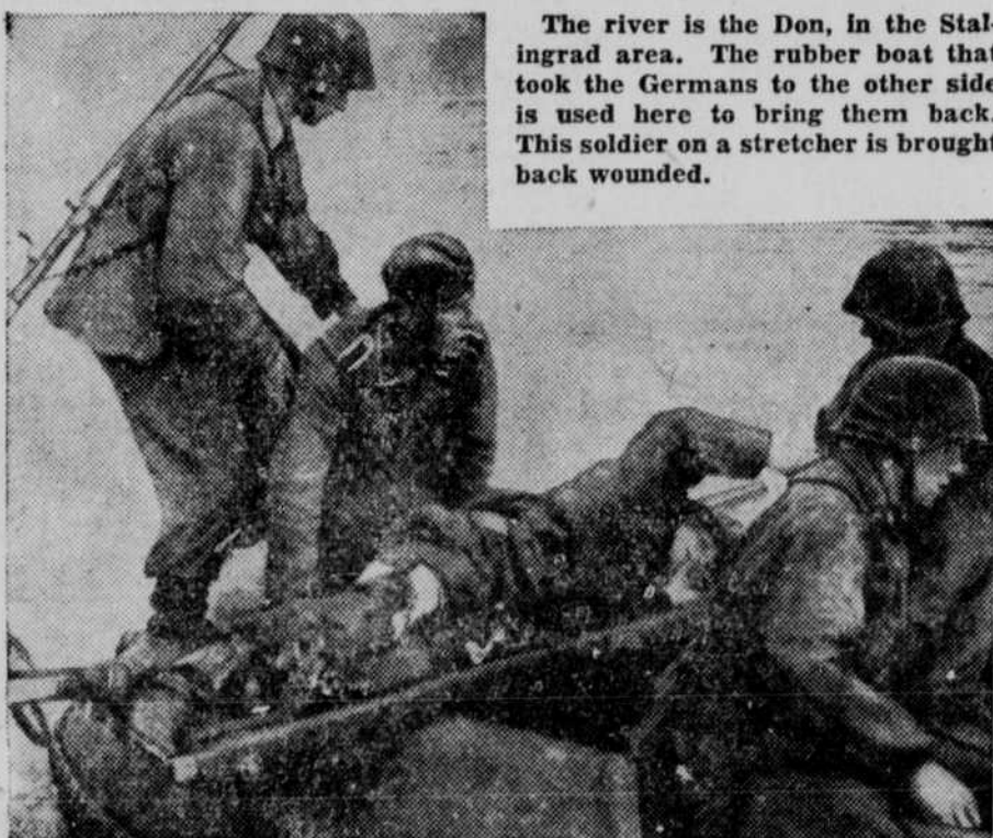
The river is the Don, in the Stalingrad area. The rubber boat that took the Germans to the other side is used here to bring them back. This soldier on a stretcher is brought back wounded.