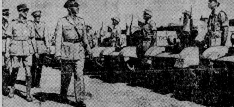
General Alexander, commander in chief of the British Middle Eastern forces, recently decorated a number of Free French officers and men who distinguished themselves at Bir Hacheim. At top Free French Infantrymen are shown as they were reviewed by the C-in-C. Lower photo shows General Alexander inspecting speedy Bren gun carriers and crews.