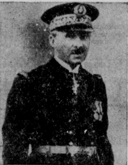
One of the big question marks has been the ultimate destination of the French fleet, which was anchored at Toulon. Admiral Laborde (above), commander of the fleet, was quoted by Vichy as having declared allegiance to Marshal Petain.