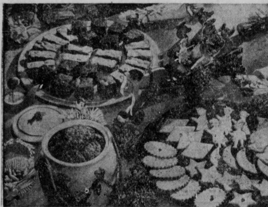
Fill the Christmas Cookie Jar! (See Recipes Below.)