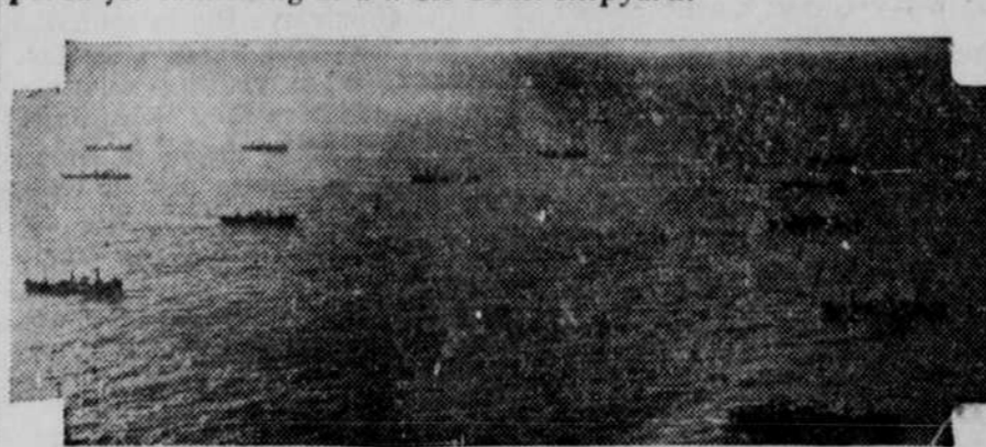
Sturdy cargo ships fill the sealanes leading to all fronts.