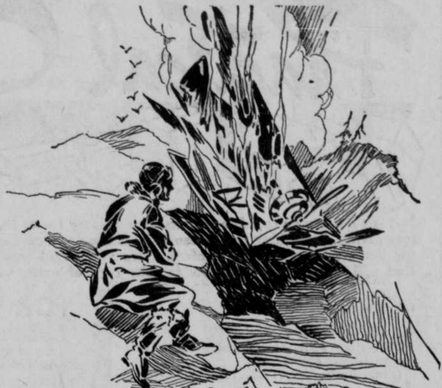
"They didn't get away," he observed in a voice devoid of all triumph.

He did a little sum on a slide rule, to check his ground speed, looked at his watch, and reached for his earphones. He smiled at the newness of the 'phones and the newness of the compact little radio set. They