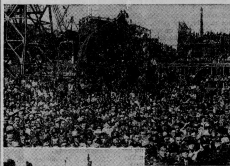
Above: A noontime throng of workers at the Calship yards pose for their picture. In the background is a large pre-fabricated section of a Liberty ship's prow. Left: A Liberty ship goes to swell the ranks of the Victory Fleet.