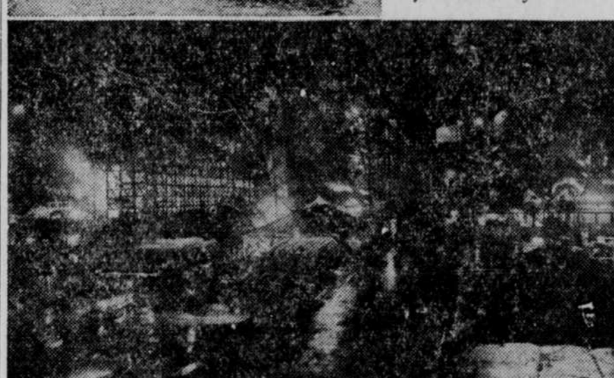
Twenty-four-hour shift prevails as three Liberty ships are prepared for launching at a West Coast shipyard.