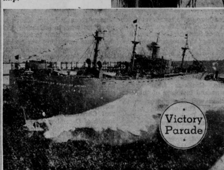
Sidewise launching of an EC-2 Liberty ship at a Gulf Coast port.