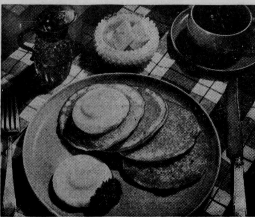
It's a Good Morning With Flapjacks in Syrup! (See Recipes Below.)