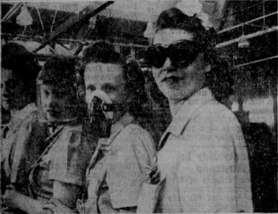
These girls wear various types of protective headgear while they produce the tools to whittle down the Axis. The girl at the right provides the touch of the eternal feminine with a flower in her hair. (Photos approved by war department.)