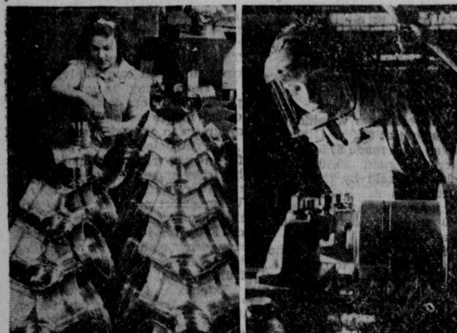
And here is an ex-laundry girl doing an important bit to help wash up the Axis. She is proud to be helping Uncle Sam.