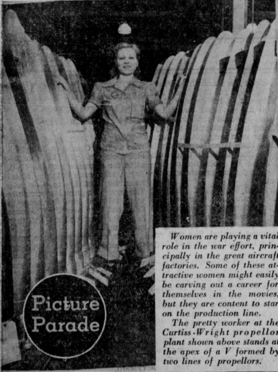
Women are playing a vital role in the war effort, principally in the great aircraft factories. Some of these attractive women might easily be carving out a career for themselves in the movies, but they are content to star on the production line. The pretty worker at the Curtiss-Wright propeller plant shown above stands at the apex of a V formed by two lines of propellers.