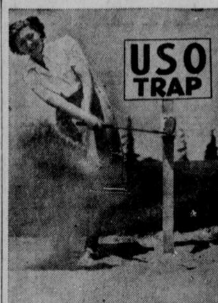
Sand traps lure quarters for the USO on Los Angeles golf courses. A handy bank is waiting to receive a 25-cent piece every time the golfer lands in a bunker.