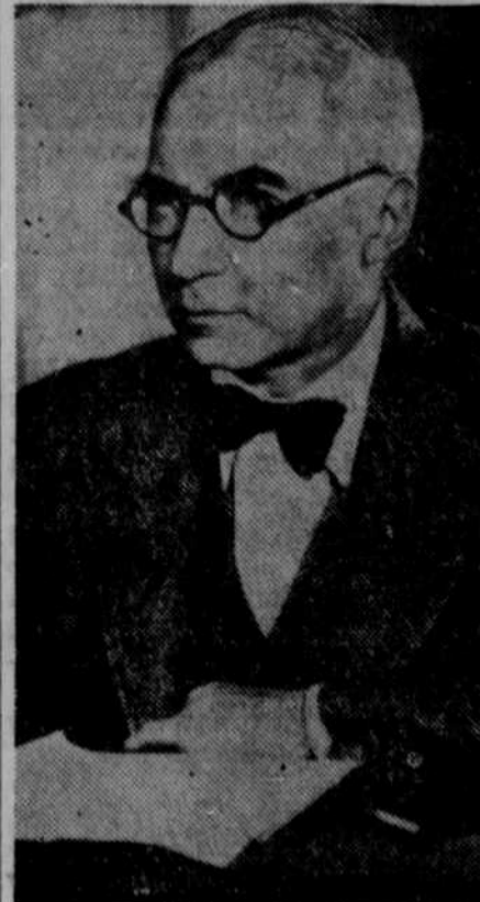
Elmer Davis of New York, who has been appointed chief of the Office of War Information by President Roosevelt. The 52-year-old former school teacher and radio commentator has supreme authority to deal with the press, radio, film industry and all other news sources, either federal or private, and answers only to the President.