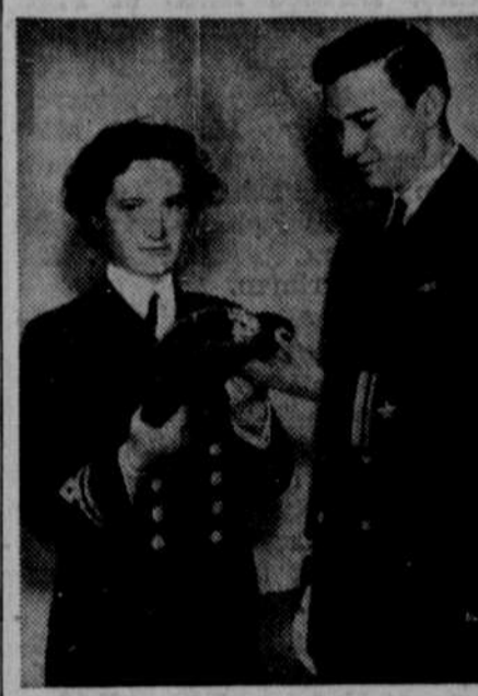
Lieut. Franklin D. Roosevelt Jr., son of the President, chats with an officer of the women's royal naval service after his arrival in London.