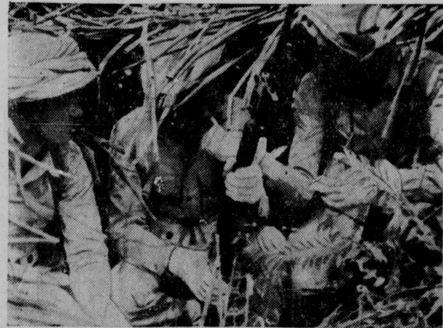
This photo, from somewhere in the Caribbean area, shows U. S. troops in the course of their vigorous training for bush warfare, while becoming acclimated to the intense heat prevalent in these tropic outposts. A jungle fox hole is seen, well camouflaged.