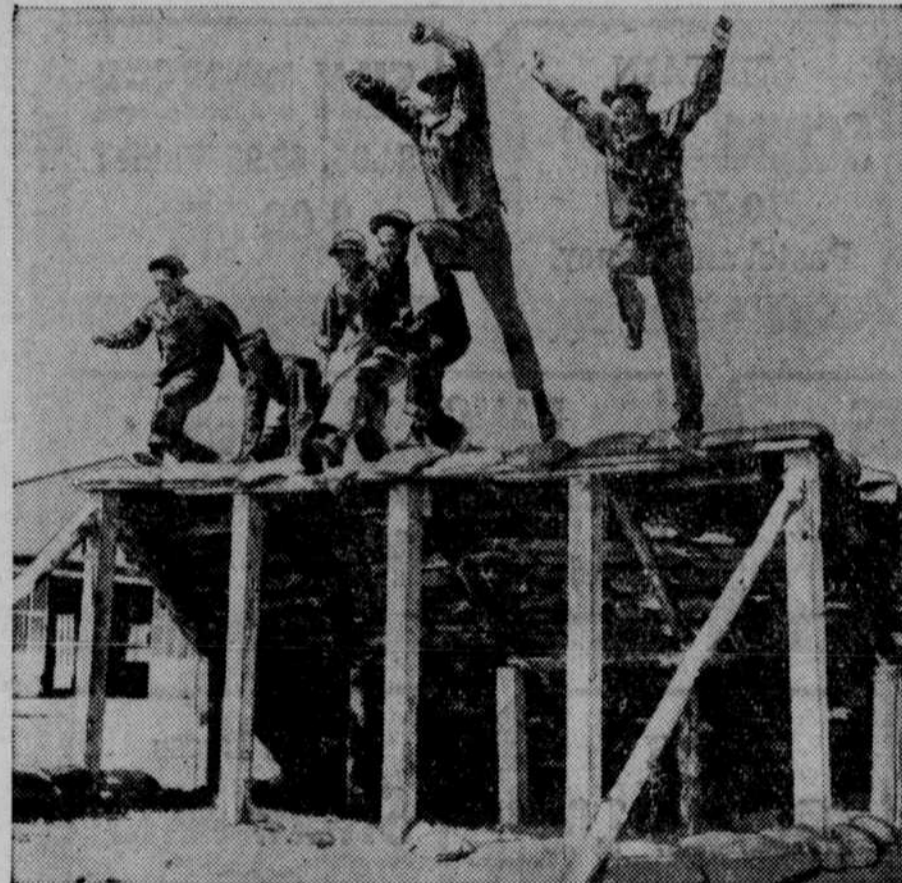
A seven-foot high collection of logs, sandbags and dirt, piled to a 45-degree angle, is really no obstacle to these boys at Selfridge Field as they go over the new 220-yard obstacle course, designed to toughen them up. At this side of the obstacle is a four-foot ditch filled with sand. There are hurdles, tunnels and jumps where a miss means a mud-bath.