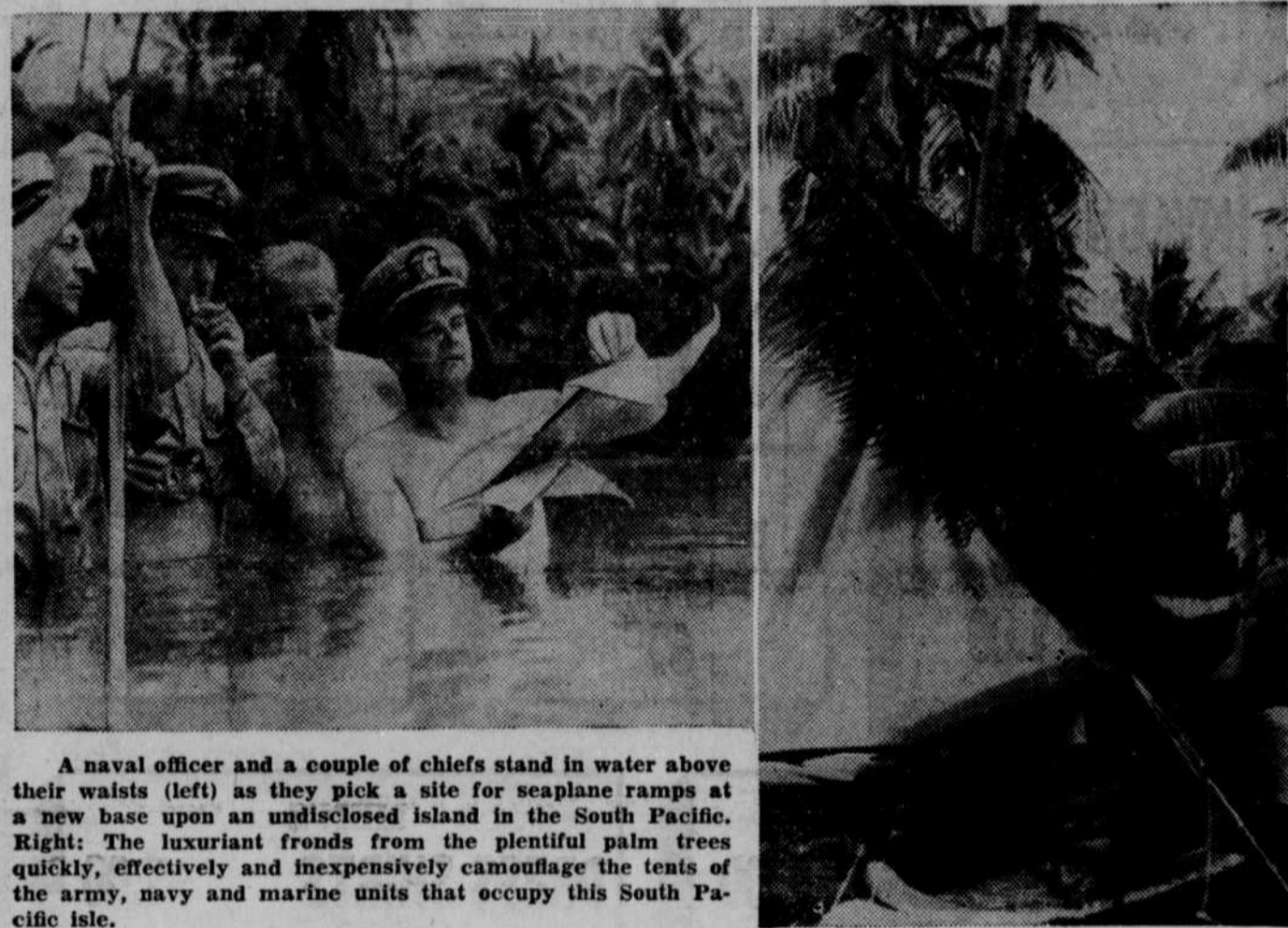
A naval officer and a couple of chiefs stand in water above their waists (left) as they pick a site for seaplane ramps at a new base upon an undisclosed island in the South Pacific. Right: The luxuriant fronds from the plentiful palm trees quickly, effectively and inexpensively camouflage the tents of the army, navy and marine units that occupy this South Pacific isle.