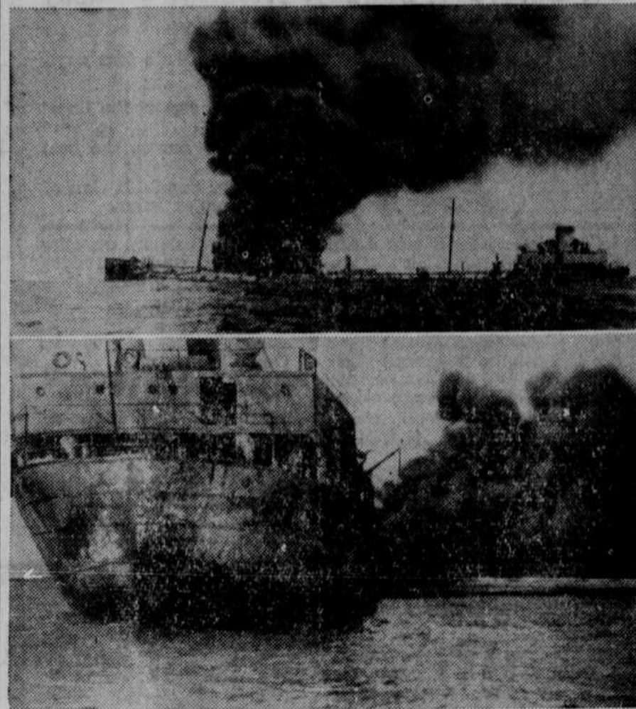
These pictures of a sinking tanker were taken by the radio operator from a lifeboat. The tanker was blasted with shells fired almost at random as the men took to the boats, after the torpedo struck. Top: The flaming tanker wallows in the Atlantic, hundreds of miles from South America. Below: The tanker veers around in the wind as this picture was taken, just before its final plunge.