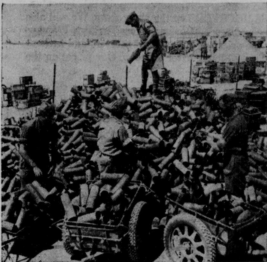
This pile of shell cases is part of the huge collection of material salvaged from the battlefields of the Libyan desert by the British. The cases will be used again, for they are of valuable brass and copper. In many instances the British have taken Italian guns and ammunition and have used them against their former owners.