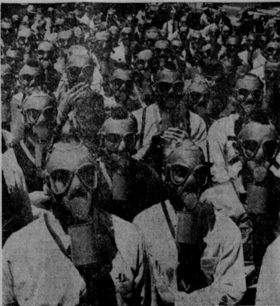
Above is a general view of a gas mask drill which was held in Oakland, Calif., after civilian defense officials began distributing more than 20,000 gas masks to 10 Alameda county communities, as well as parts of three other counties. Masks will go to volunteer defense workers specified by the Office of Civilian Defense.