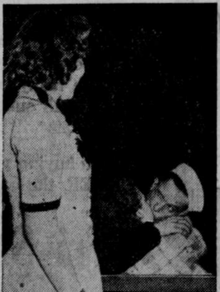
"Just one gal is enough for me," says an old song, but this sailor seems to be of a different turn of mind. While his arms are quite full, his wink speaks volumes.