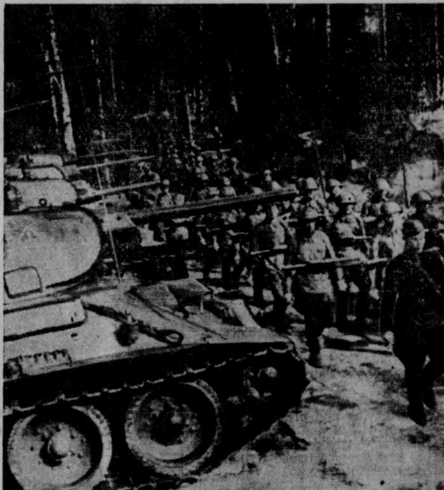
Red army infantrymen are shown in marching formation after they had been unloaded from the tanks that carried them to the deployment point near the front line, somewhere on the long battle line that reaches from the Baltic to the Black sea. Russians claim that these tanks have proved superior to the German juggernauts that crashed through France two years ago.