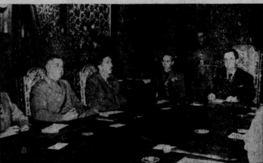
Mexico has now entered the war against the Axis. This action makes her a belligerent ally of the 26 other United Nations. Picture shows Manuel Camacho (extreme right) and his cabinet which voted to join the United Nations at war, following the sinking of the two Mexican tankers in the Gulf of Mexico. Formal protest by Mexico was rejected by the Axis.