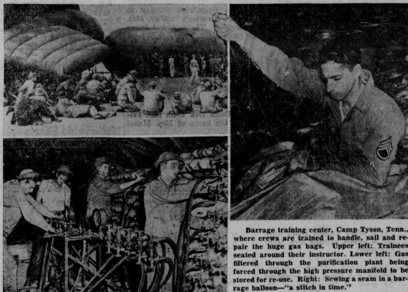
Barrage training center, Camp Tyson, Tenn., where crews are trained to handle, sail and repair the huge gas bags. Upper left: Trainees seated around their instructor. Lower left: Gas filtered through the purification plant being forced through the high pressure manifold to be stored for re-use. Right: Sewing a seam in a barrage balloon—"a stitch in time."