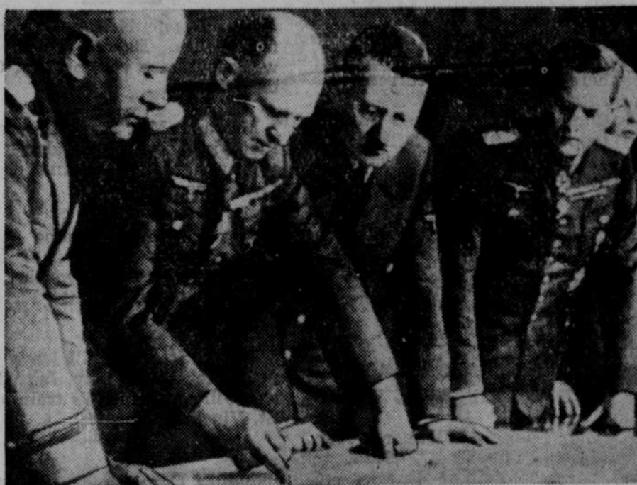
This historic picture just received in the U. S. shows the meeting at Salzburg, Austria. General Jodel, second from left, explains to Mussolini and Hitler a difficult point on the map. Japan was not represented.