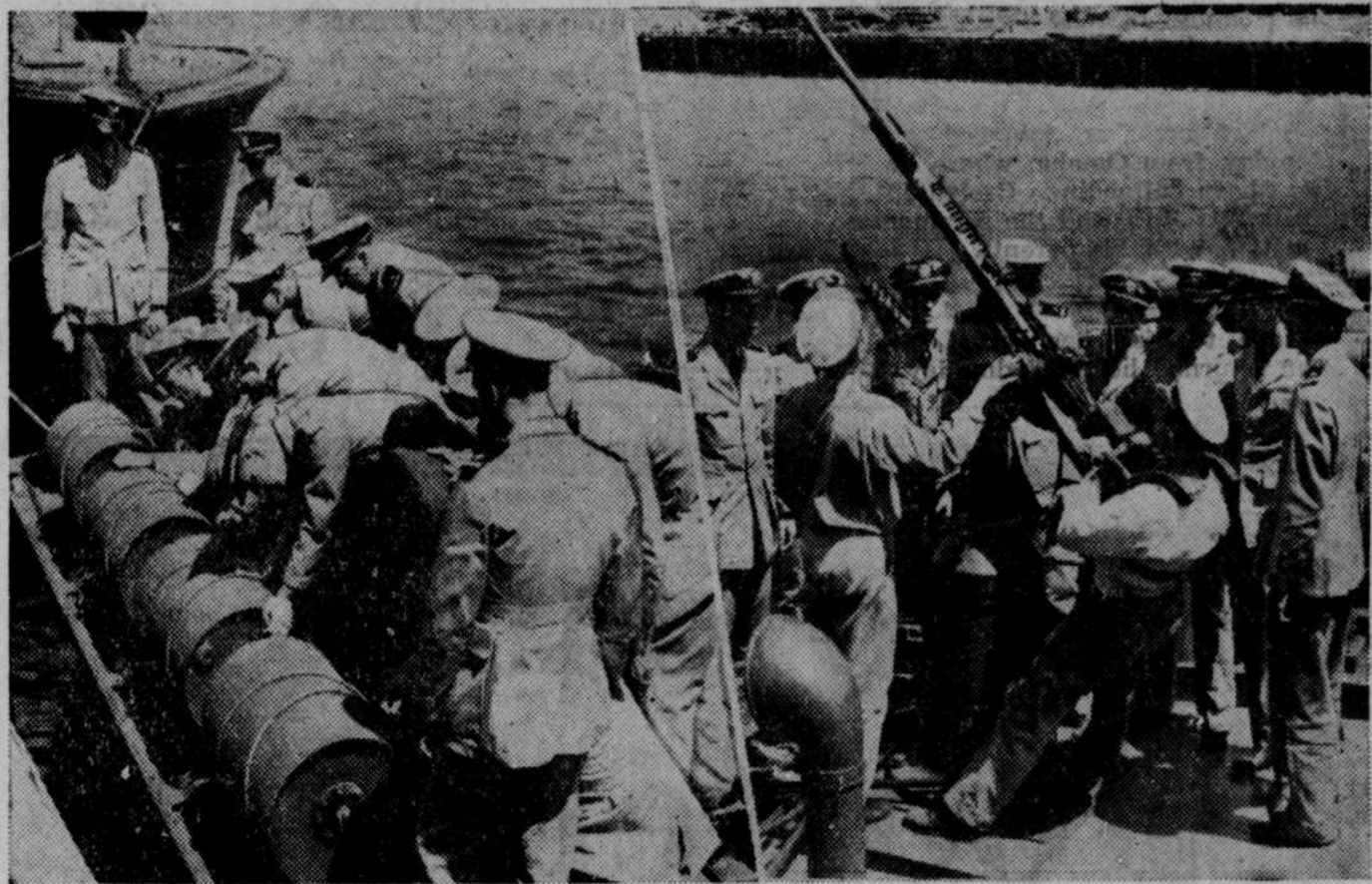
The successes of our motor torpedo fleet in Philippine waters have brought a flood of applications to the navy from young officers who want to serve aboard the boats. Special schools have been set up for this purpose. At the left a group of officers is receiving instructions in the use of depth bombs. Picture at right shows a group of them gathered about an Orlikon automatic anti-aircraft cannon.