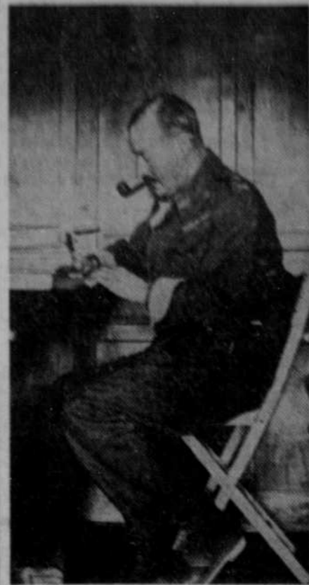
This being a war of movement, Lieut. Gen. Neil Ritchie, general officer commanding Britain's Eighth army in Libya, believes in mobile quarters. He has fitted out a big caravan to serve in this capacity. Above he is shown working at his desk in his office on wheels. The whole outfit is mounted on a truck body.