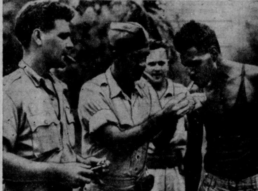
The Australians have long been in the habit of calling the aborigines "black fellows." American officers somewhere in the bush region of northern Australia are being palsied walsy with a "black fellow" here.