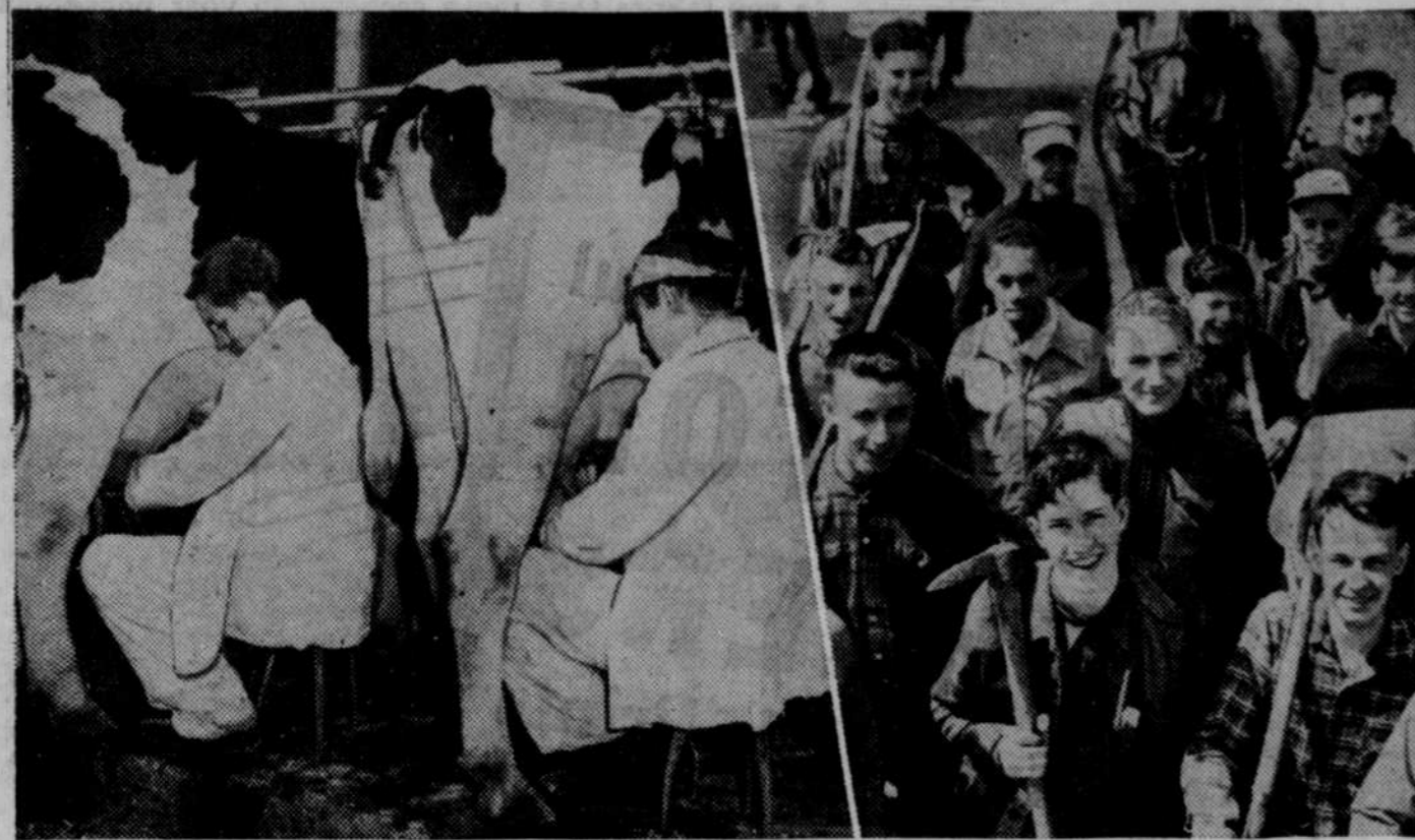
There is a threatened shortage of farm labor this year. In upstate New York alone 25,000 men and boys are needed this summer, and some 7,000 boys from city high schools have enrolled for farm training. Many of these are being trained at the State Institute of Agriculture in Farmingdale, L. I. At the left you see students at work in the dairy section of the institute. Right: Some of the students who are taking a course in farming.