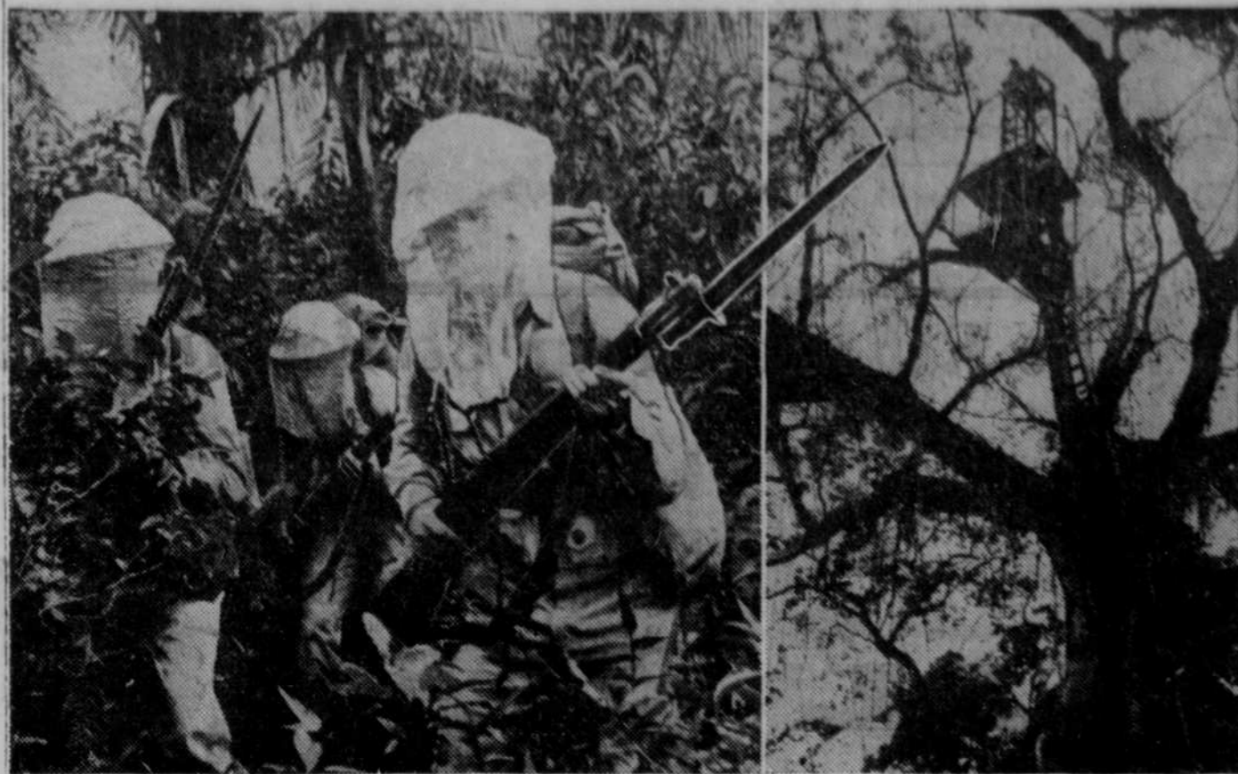
Protected from hordes of ferocious mosquitoes by veil-trimmed helmets, a party of U. S. troops is shown (left) scouting in the tough jungle country of Surinam, better known as Dutch Guiana, one of the places where we now maintain forces to protect American interests. Right: A U. S. army lookout high in the trees of the Surinam brush. The keen eyes of the observers posted there spot any strange activity in the jungle.