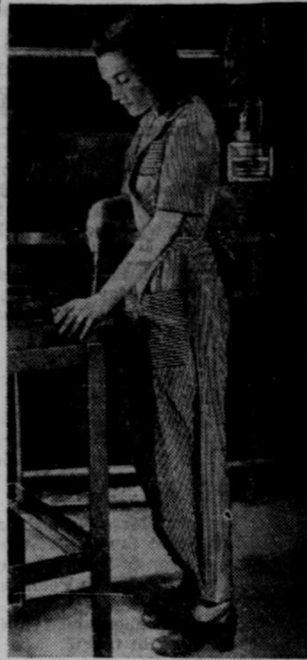
Above is shown the correct way to stand at a bench and do your bit for the war effort. The straight back, high chest and equal distribution of weight on the feet will keep this girl working long after others who assume wrong positions are tired.