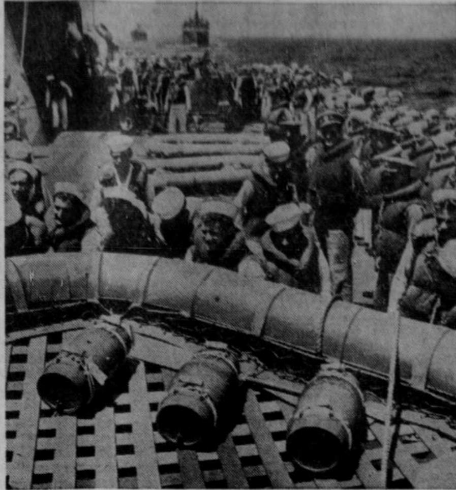
At Sea . . . You are somewhere on the broad Atlantic aboard a unit of the U. S. navy's Atlantic task force, currently doing a job of conveying. What you are now looking at is an "abandon ship" drill, in which the ship's personnel go through all the motions without actually going over-side. In the background are other ships of the convoy. (Approved by U. S. navy.)