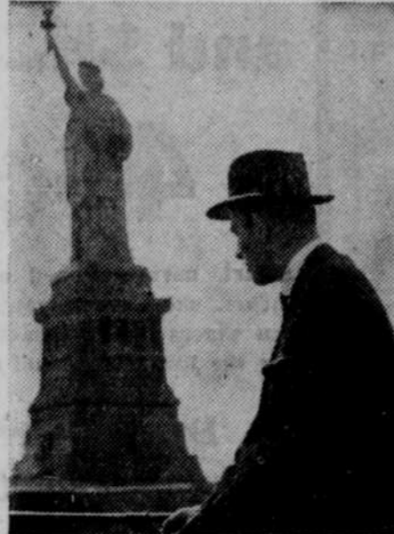
Lord Halifax, British ambassador to the U. S., pays his first visit to the Statue of Liberty. Here he gazes at the symbol of freedom from the boat that took him to Bedloe's island.