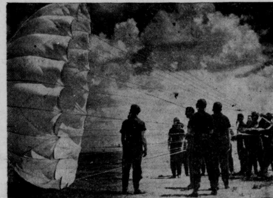
Aviation cadets at Goodfellow Field, San Angelo, Texas, grapple with a billowing parachute on a windy day. You'll appreciate the difficulty of their task if you have ever opened up an umbrella in a gale.