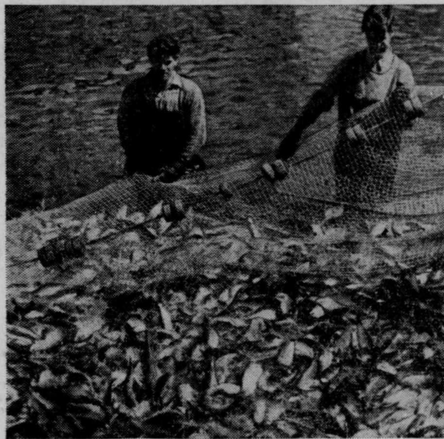
Every year millions of herring have swarmed up the Taunton river to spawn at the headwaters near Middleboro, Mass., and have been caught by Indian traps and white men's nets. This year, the U. S. army has put in its order. Photo shows hundreds of herring being pulled in with a dagnet. In this spot the daily catch runs up to 1,000 barrels.