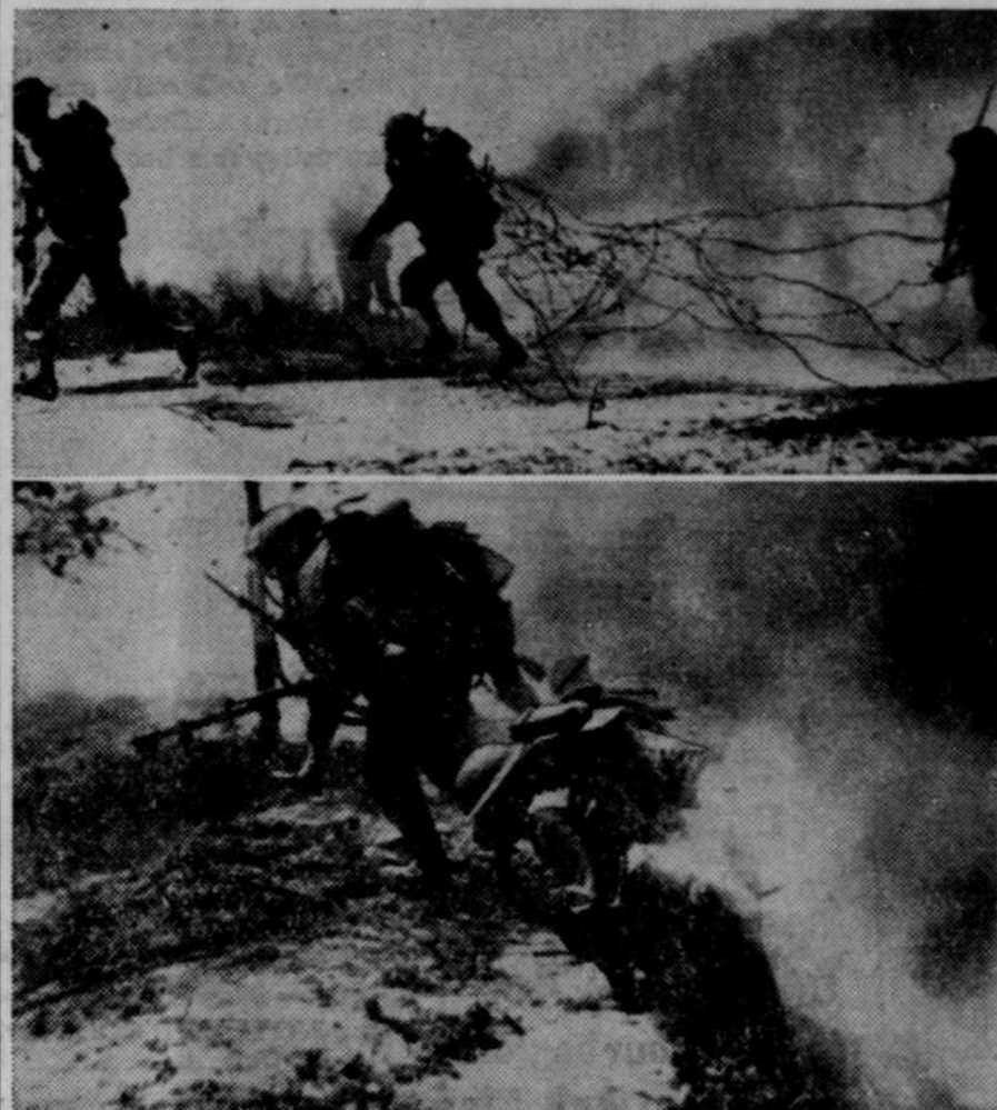
These future engineers are training at the engineers replacement center, at Fort Belvoir, Va. Upper photo shows them, after having cut out a barbed wire obstacle, advancing under a protective smoke screen. In the photo below they are leaving their trench and advancing under a protective smoke screen to a point of combat.