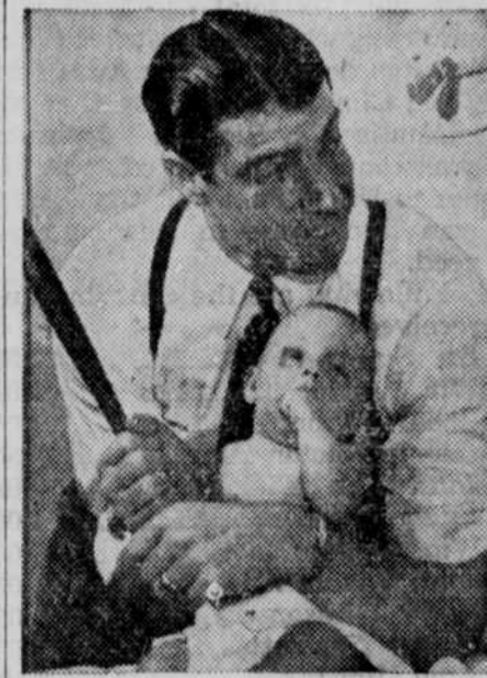
Joe DiMaggio, star outfielder of the New York Yankees, initiates his son into the mysteries of hitting technique. With a tutor like dad Joe Jr. can't help but be colossal.