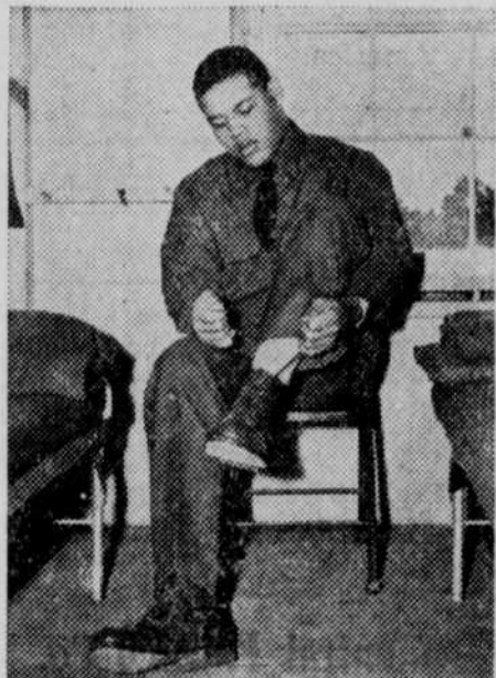
Private Joe Louis puts on his army brogans at Camp Upton, L. I., as he begins army life routine. The champ entered the army day after he pinned back ears of Buddy Baer.