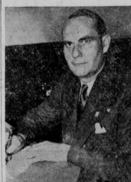
William L. Batt, chairman of the new requirements committee created by Donald Nelson, war production czar, to allocate raw materials for war and civilian defense.