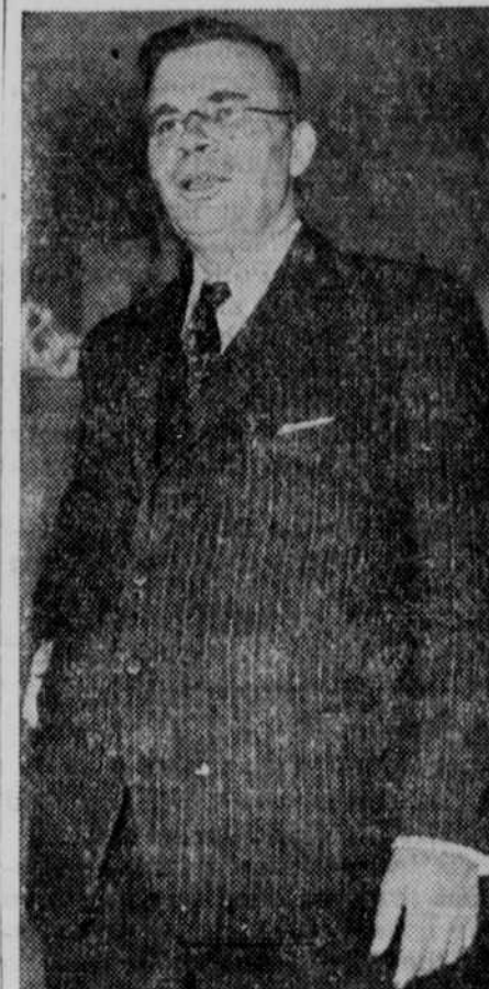
Lieut. Gov. Gen. Hubertus Van Mook of Netherlands East Indies, shown at Netherlands club, New York. He described the Netherlands East Indies as a barrier to Axis aspirations in the Pacific, and called them a bridge for the Allied forces between Australia and India. He said their loss would lessen the United Nations' chances of winning the war.