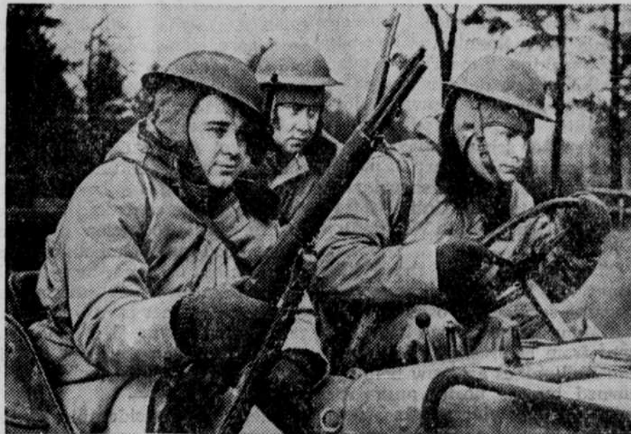
With the new winter combat clothing issued by the quartermaster corps, these boys of the fourth armored division are ready for really cold weather. Their new duds include wool-lined combat helmet, alpaca-lined parka, olive drab all-wool mufflers and gloves, and wool-lined jacket and trousers. The boys here are riding a "Jeep."