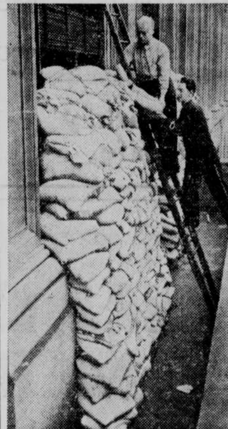
Completing the job of placing sandbags outside the office windows of Hotel Bossert in Brooklyn. The barriers were installed so the hotel organization could keep functioning in case of an air raid.