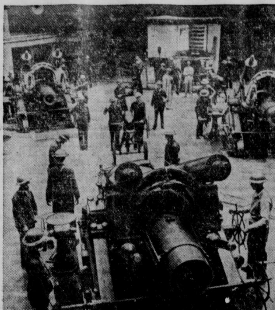
Huge 12-inch mortar guns manned by United States coast artillery gunners at Fort Corregidor, in Manila bay, Philippine Islands, which was bombed by Japs. In one attack, in which 21 enemy planes participated, four bombers were shot down by anti-aircraft fire from the heavily guarded fortress.