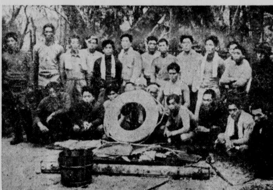
These survivors of a Japanese fishing schooner which went ashore at Guam now are believed to have landed on purpose, and not accidentally as believed at that time. It is suspected they used this trickery to reach Guam and obtain vital information before war with the U. S. The navy had previously excluded Japs from the island.