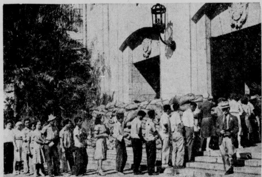
This censor-approved photo which was received from Honolulu shows Honolulu automobile owners lined up over two blocks on the first day, waiting at the city hall to get their gasoline ration tickets. Note the sand bag barricade on each side of the entrance. This is for the protection of the armed guards.