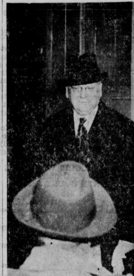
Maxim Litvinov, Russian ambassador to the U. S., leaves the White House after conference with President Roosevelt and Prime Minister Churchill. The U. S. and British leaders conferred separately with representatives of the allied nations as they laid the broad outlines of the democratic victory blueprint.