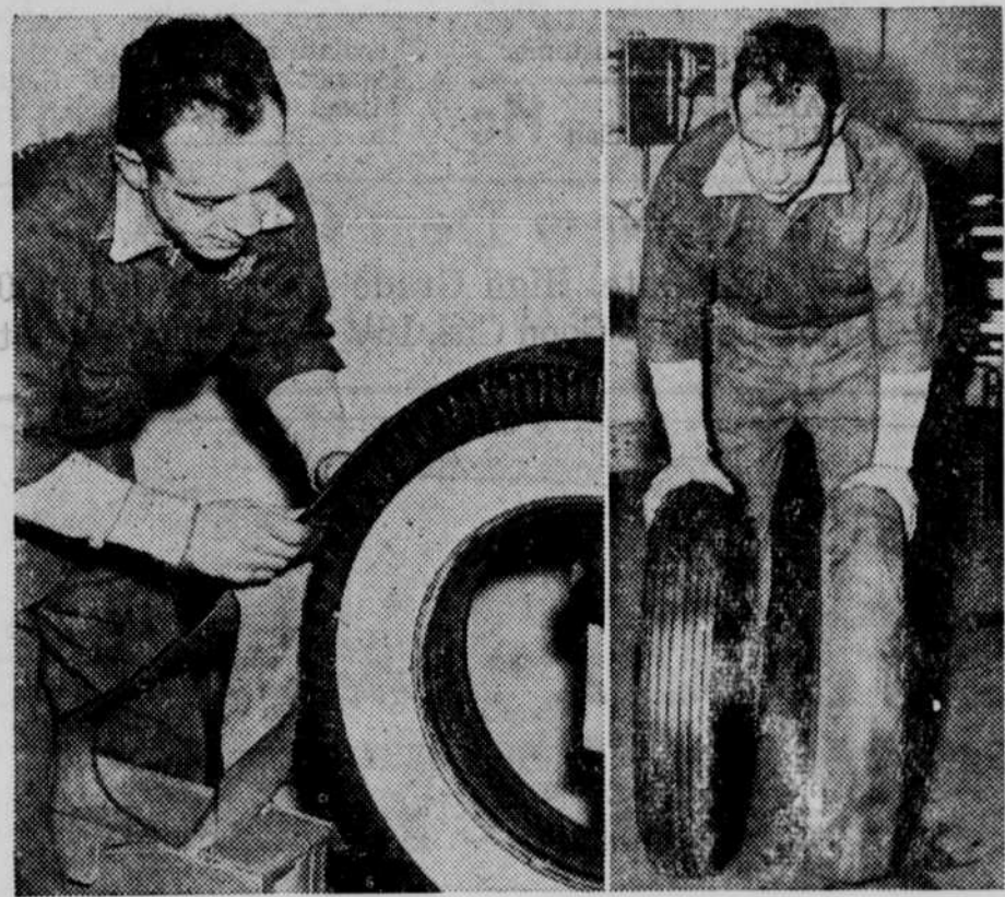
We will all have to do without new automobile tires for the present. Next best thing is a retreading job on your old ones, if they are too smooth for safety. At left you see a re-treading operation in progress. A "camel back," or new rubber top, is vulcanized to the old casing to give a new gripping tread. At the right is shown how a worn-out tire compares with one that has just been given a face lift, or a new tread. The recapped tire is at left; the old "smoothy" beside it.