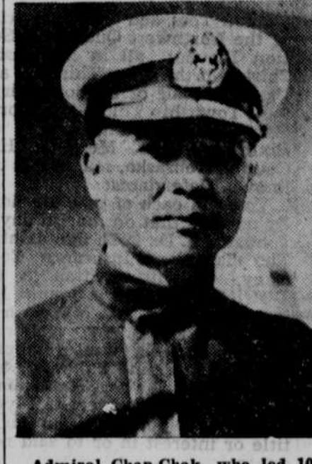
Admiral Chan-Chak, who led 100 British and Chinese in dash from Hong Kong, in five naval speed boats, engaging Japs in series of battles for four days, finally reaching safety.