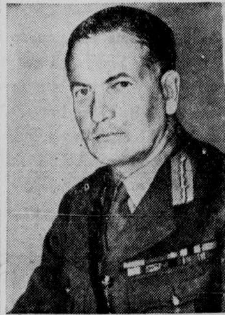
Lieut. Gen. Sir Henry Pownall, new British chief in the Far East, who succeeded Sir Robert Brooke-Popham. His first job was to stem the Jap invasion of Malaya.