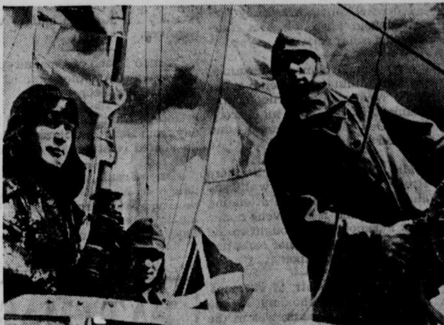
These determined men of the Russian navy are on the lookout for Nazis. While valiant Red land forces are putting the pressure on the retreating Germans, the navy is ready to counteract any Nazi surprise that may come via the sea lanes.