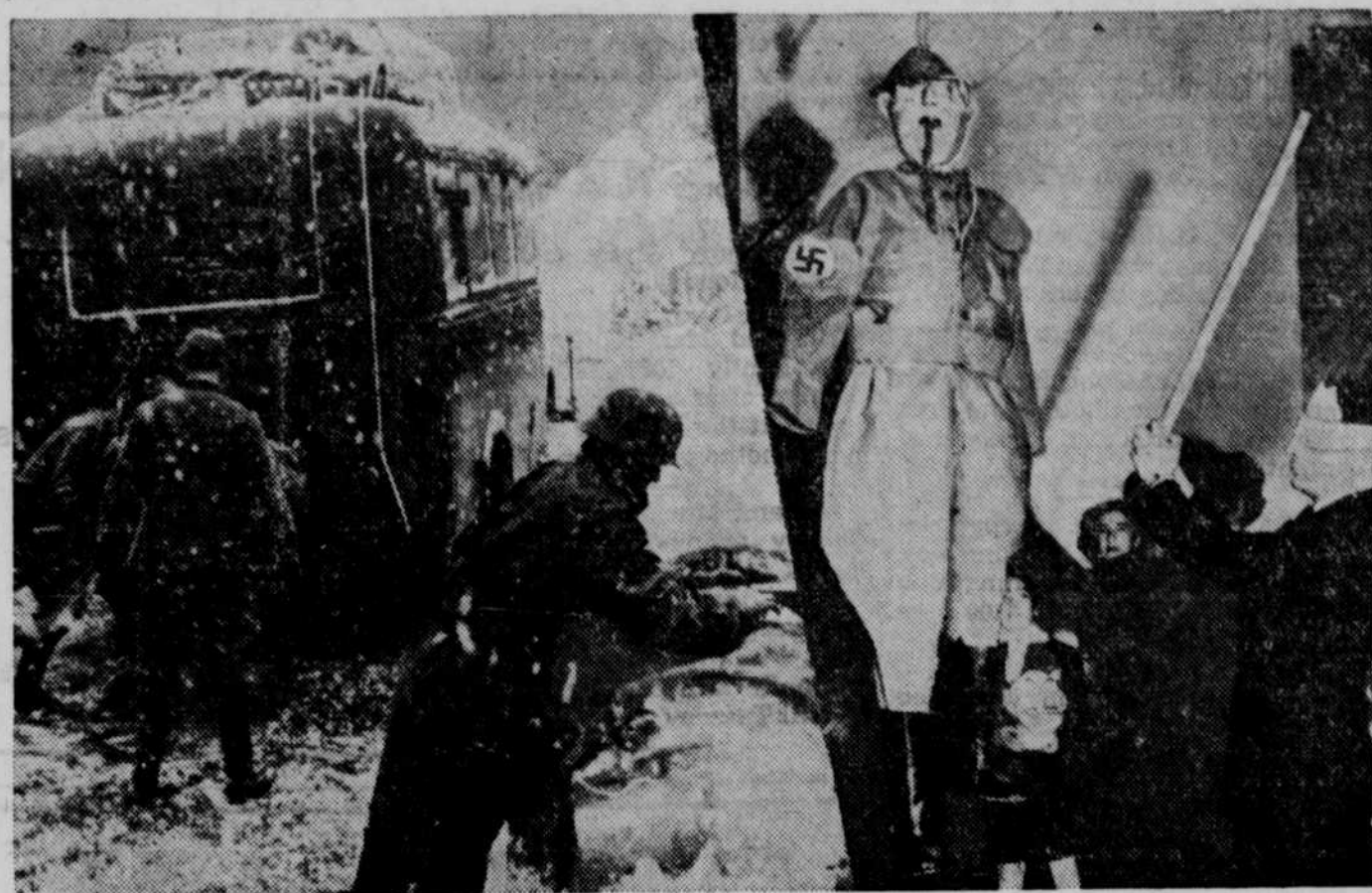
From Germany comes a photograph (left) passed by the propaganda bureau containing the following admission: "A German motorized unit stalled by snow on the Eastern front." Thus did Old King Winter take a crack at Adolf. And here is Jacques Soustelle (right), representative of the Free French, taking a crack at Hitler in Mexico City, at ceremony known as the breaking of the "pinata." As the pinata in this case was an effigy of Hitler, Jacques found new strength in his arm.