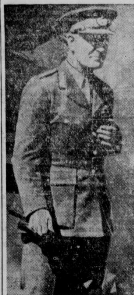
Gen. Sir Archibald Wavell, who assumes supreme command of the Allies in the Southwest Pacific area, one of the greatest battle fronts of history. American, British, Australian, Dutch, Chinese, Indian and Malayan units make up his command.