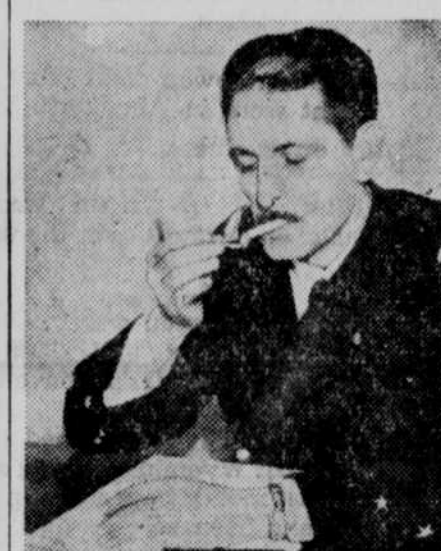
Adm. Emile Muselier of the Free French navy, whose capture of the islands of St. Pierre and Miquelon proved embarrassing to the U. S. state department, who feared it might anger Vichy to the extent of complete collaboration with Berlin.