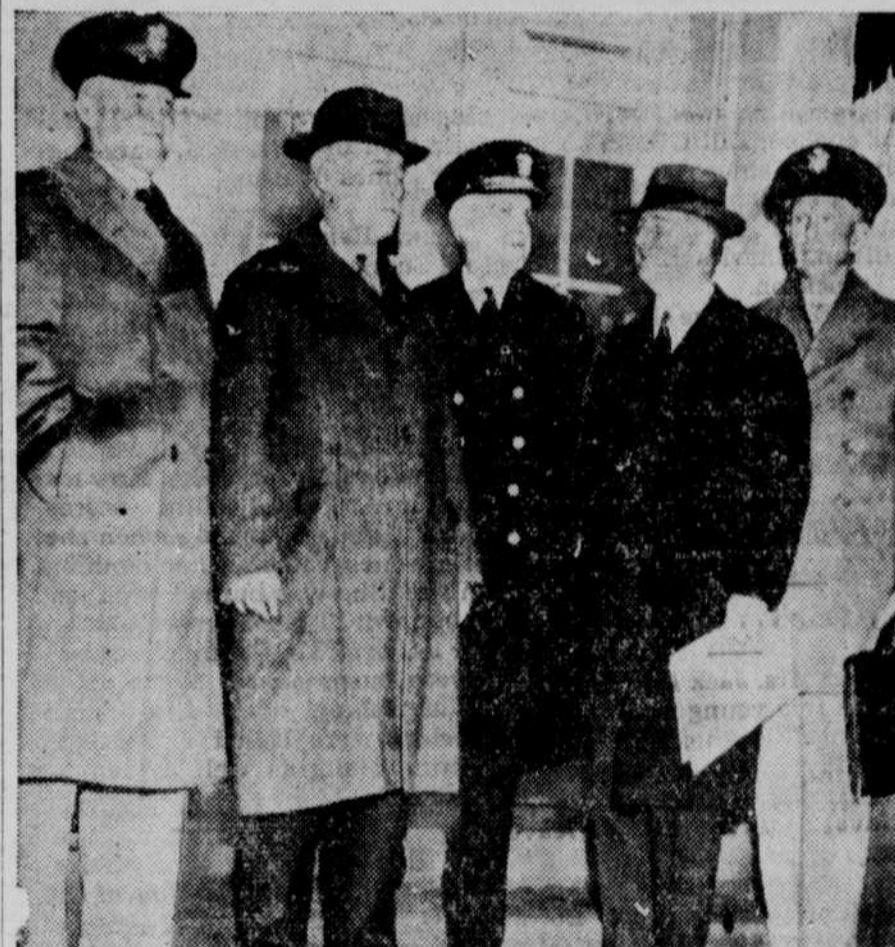
President Roosevelt and Winston Churchill called the first meeting of the U. S.-British war council at the White House, to draft a "unity of action" grand strategy program for all anti-Axis nations. The U. S. contingent is shown here. Left to right: Maj. Gen. H. H. Arnold, chief of army air corps; Secretary of War Stimson; Adm. H. R. Stark, chief of naval operations; Secretary of Navy Knox; Gen. Geo. C. Marshall, U. S. army chief of staff.