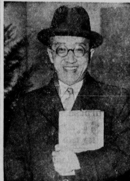
Chinese ambassador, Dr. Hu Shih, leaves White House with book, "The Personal Papers of Franklin D. Roosevelt," presented by staff and autographed by the President.