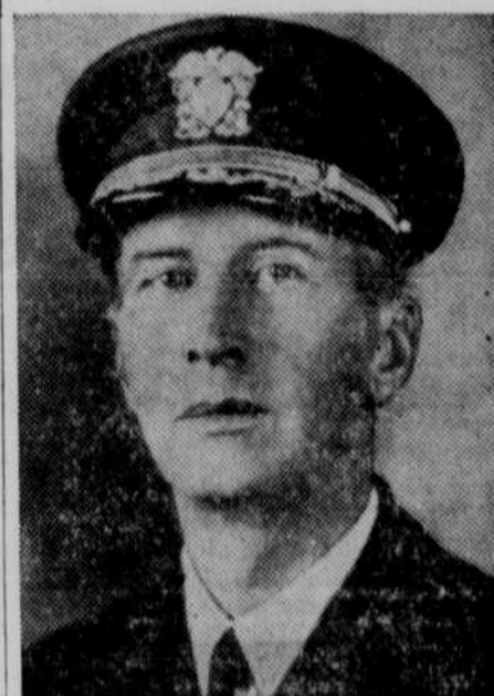
Admiral Earnest J. King, commander in chief of the United States fleet and in supreme command of all naval operating forces in Atlantic, Pacific and Asiatic waters.