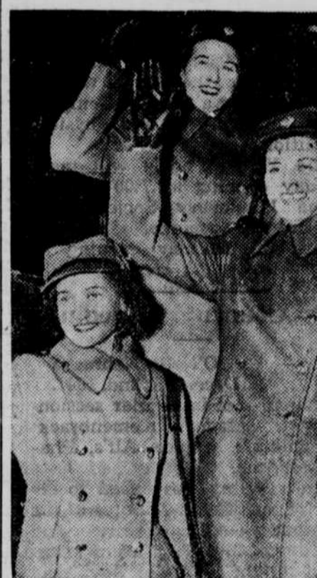
First members of the Canadian women's army corps to leave Canada on active service are shown as they left Ottawa for Washington, D. C., where they will take over duties formerly performed by men at the Canadian legation. All are company sergeant majors.