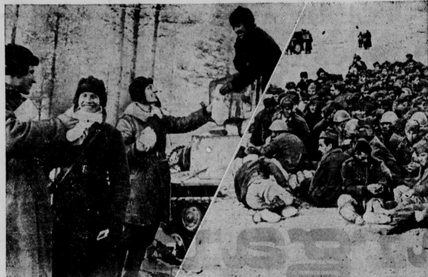
Smiling cheerfully as they push German forces back the way they came, members of this Russian tank crew (left) halt for brief pause in their march westward, for lunch. Rigors of the Russian winter seem to have no terrors for these hardy soldiers. Right: These Italian prisoners in the Libyan desert seem too miserable to attempt to escape, and yet they are guarded carefully before being shipped to a concentration camp.