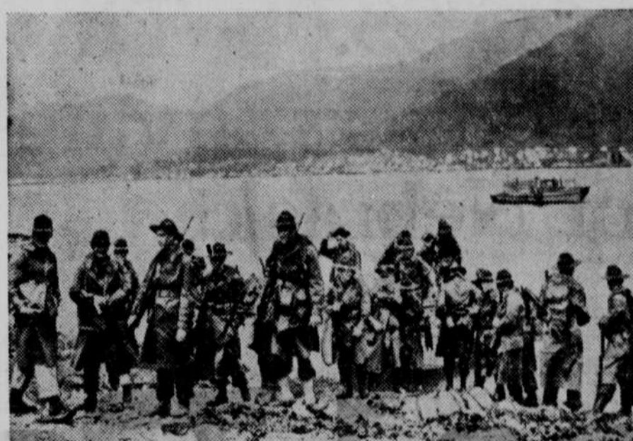
This soundphoto, which was taken somewhere in the bleak wilds of Alaska, shows United States troops landing at an Alaskan post to man our most northern frontier. These troops have received special training for duty in this bleak outpost, and can be expected to give a good account of themselves against all comers.