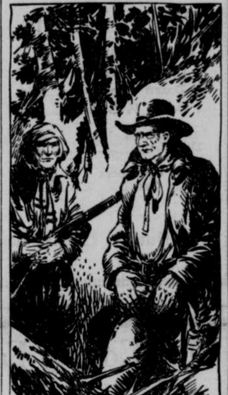
"They're taking an awful chance," Roper said.

Shoshone nodded. "They ain't all said, "I lay thinking about this time in the cabin all of the time. Seems for a long time, after you was was crouched in dense brush, gun in like they must have had the girl tell asleep." A dogged stubbornness hand, as the scout appeared below 'em that she come here to meet came into his tone. "I figure we you. Naturally they'd think you can probably take the cabin. And if Roper stood up. "Steady," he knew she was coming. Most likely we take the cabin without fighting they figure that if I ain't dead I'm we've got a chance to get away. But The man in the draw jumped as carrying you word that will bring if so much as one shot is fired-Bill, If he had been struck; but as he you here a-kiting. So they're hold- the outposts will close like a b'ar raised his hands he straightened so ing her there now until they see if trap. I don't see no way we can they can't get you. I ain't watched ever get clear."