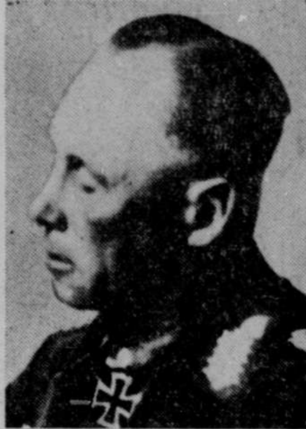
Gen. Erwin Rommel, commander of German forces in Africa, who succeeds Field Marshal Wilhelm Keitel at the Russian front, according to the Moscow radio.