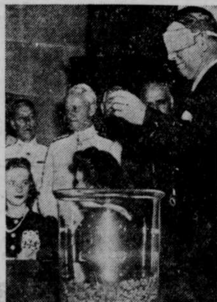
Secretary of Navy Frank Knox is shown drawing the second number in the second peacetime draft lottery. The number was 98. First number was 196.