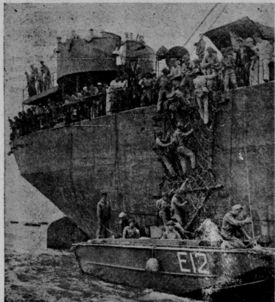
This photograph was made at Jacksonville, N. C., during marine maneuvers—first time—between army-navy and marines on beach landing practice. Transports unloaded armored cars and troops carrying equipment, etc. Photo shows marines going over the side of transport into landing boats.