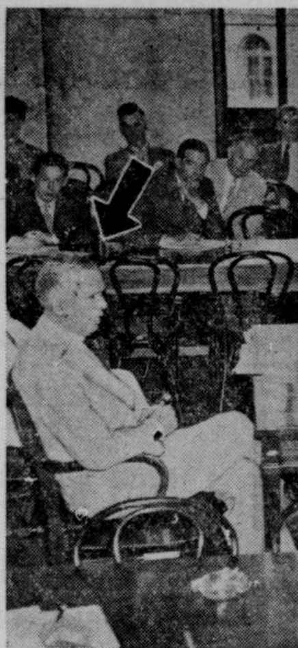
Arrow indicates Gen. George C. Marshall, army chief of staff, as he appeared before senate military affairs committee asking congress to authorize a draft army of unlimited size. He spoke of the "grave national peril."