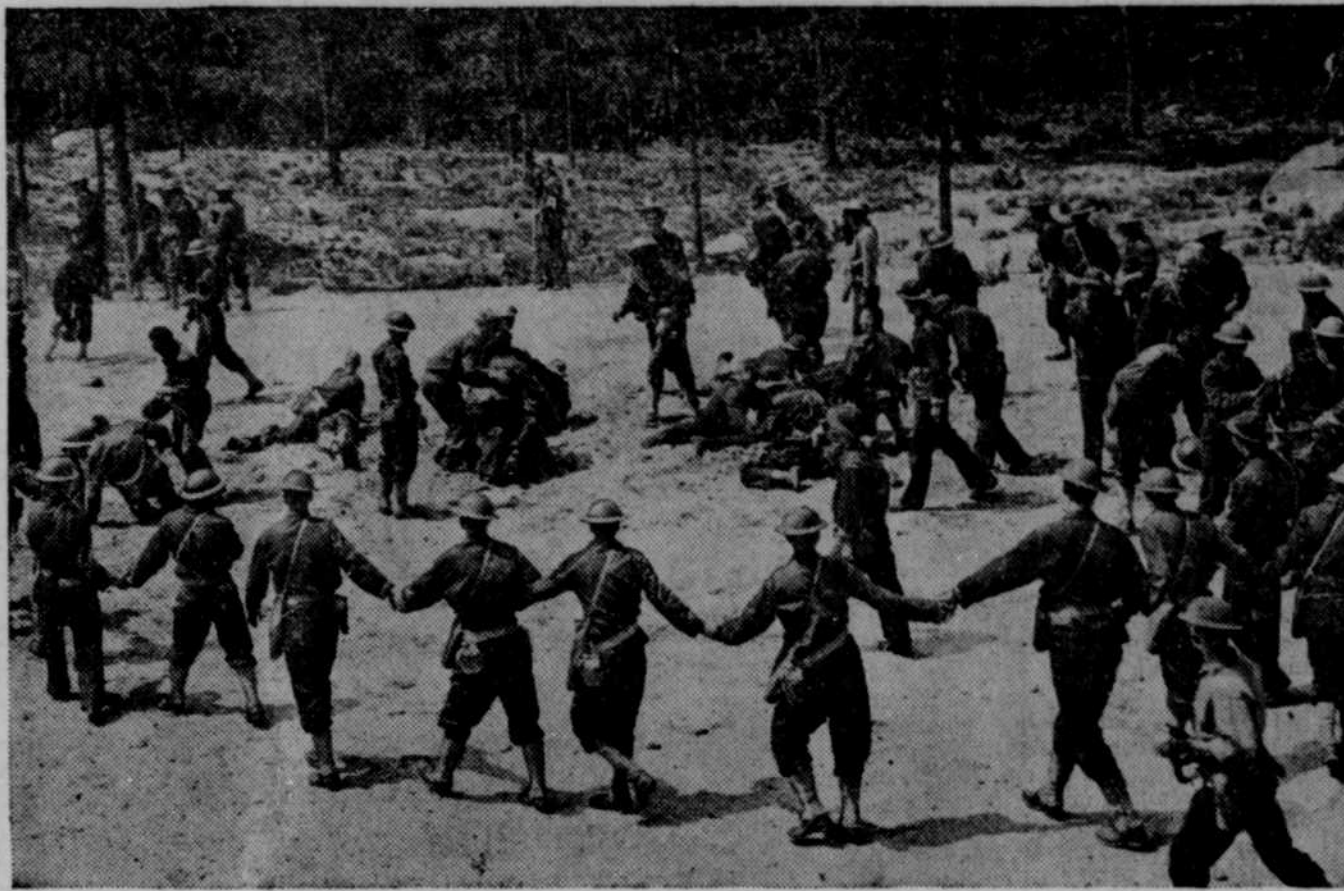
Atop Signal hill at Camp Edwards, soldiers go through a realistic maneuver designed to train them in breaking up strikes. Here soldier strike-breakers, wearing steel helmets, engage soldier strikers, wearing fatigue hats, in hand-to-hand encounter. Strikers were captured, herded back to prison pen.