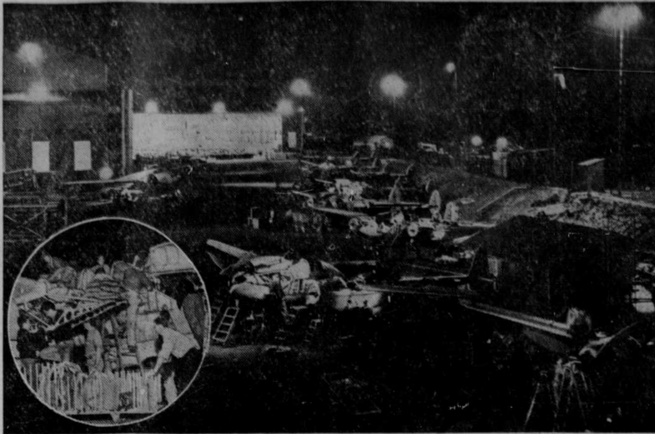
Here is a general view of the outdoor assembly line at the Lockheed Aircraft corporation's plane plant in Burbank, Calif., showing how production goes on through the night on the famous "P-38 Lightning" interceptor planes for the U. S. army and the British R.A.F. More than 12,000 employees are on night work turning out these planes. Inset shows a closeup of a crew on night duty.