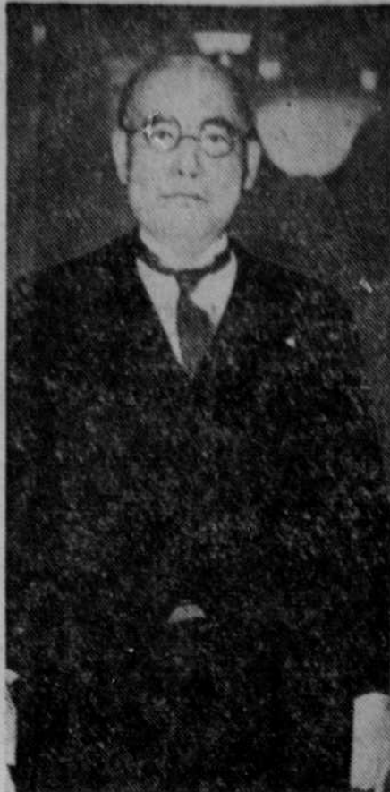
Japan's Ambassador K. Nomura, after a conference with Acting Secretary of State Sumner Welles, expressed the hope that U. S.-Japanese relations would get "better and better." Welles, however, said he told Nomura, that Japan's actions in Indo-China were a threat to U. S. "security."