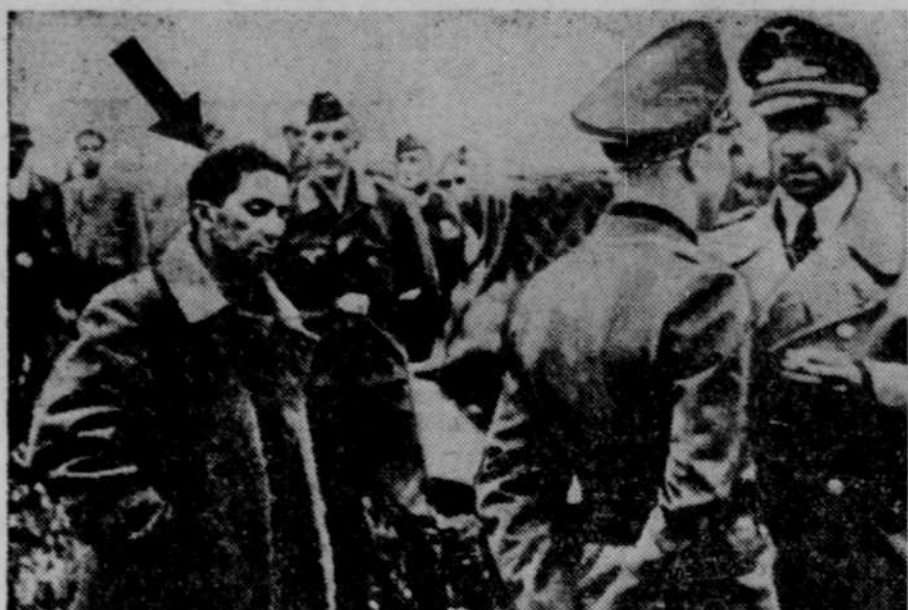
Jacob Stalin, the eldest son of Russian Premier Joseph Stalin, is shown (arrow) in a German prison camp. He was captured near Ljosno, Russia, with a number of other officers and soldiers taken by German panzer forces under the command of Gen. Rudolf Schmidt, according to a Nazi communique.