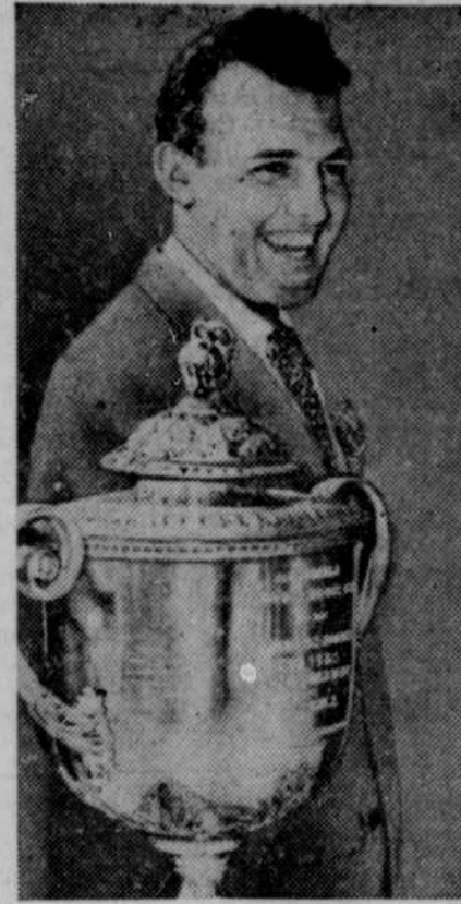
Vic Ghezzi, after nine years of trying, has won the coveted P.G.A. golfing title and cup after defeating Byron Nelson, last year's champ, by sinking a 30-inch putt. Ghezzi is shown above with his newly acquired trophy.