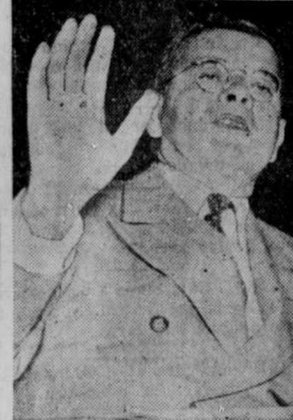
Sidney Hillman, OPM co-chief, as he testified before a house committee that within the next year, U. S. defense industries will need an added 2 1/2 to 3 million workers.