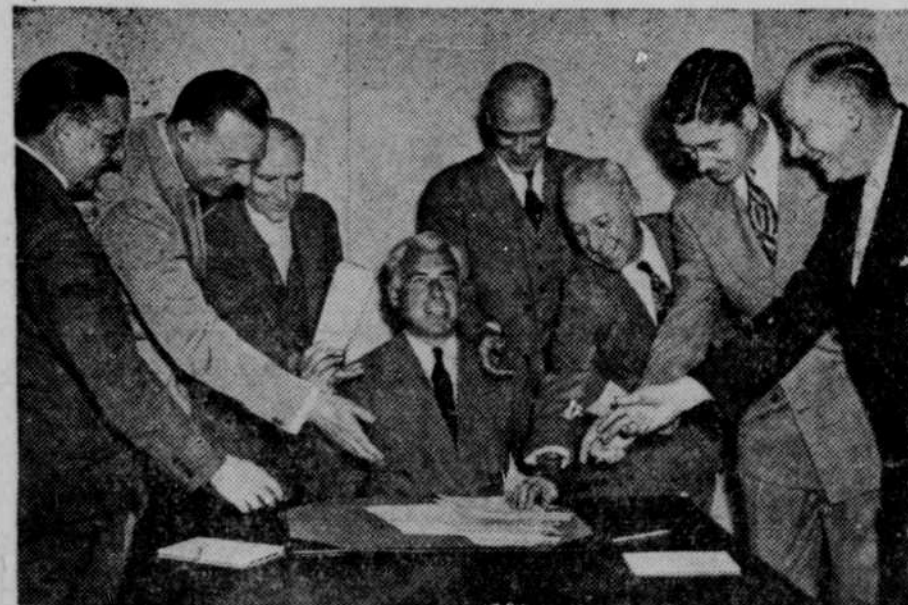
Here are some of the 262 dollar-a-year men in the defense program on their recent "pay day." Total of all payments was only $126 to the 262 workers as many of them had not worked a full year and could not receive their "total" salary. Distributing checks above (center) is Edward Stettinius, priorities director.