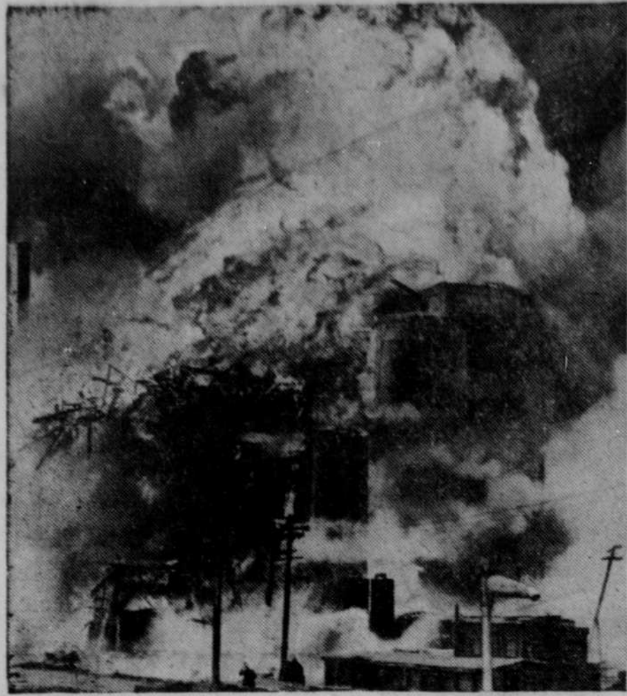
This spectacular picture was taken just as a billow of white hot flame blew off the top of a United States Grain elevator, in Chicago, during a $300,000 fire, of mysterious origin. More than 350,000 bushels of corn were destroyed. Furnace-like heat melted steel girders like butter and drove back firemen.