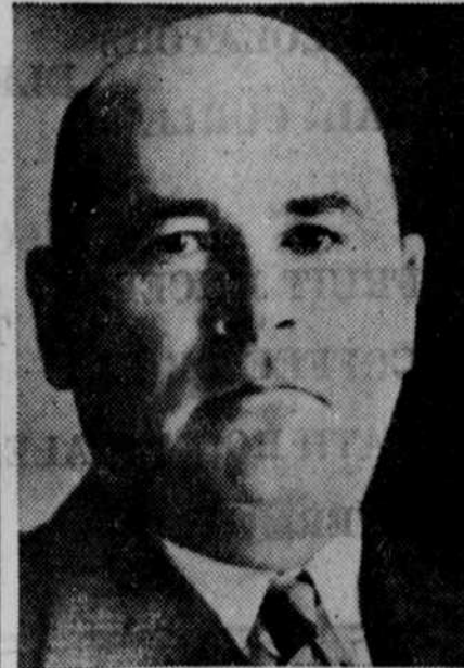
Gen. I. M. Angarita, elected president of Venezuela, succeeding General Contreras. General Angarita said he was in full accord with western hemisphere defense.