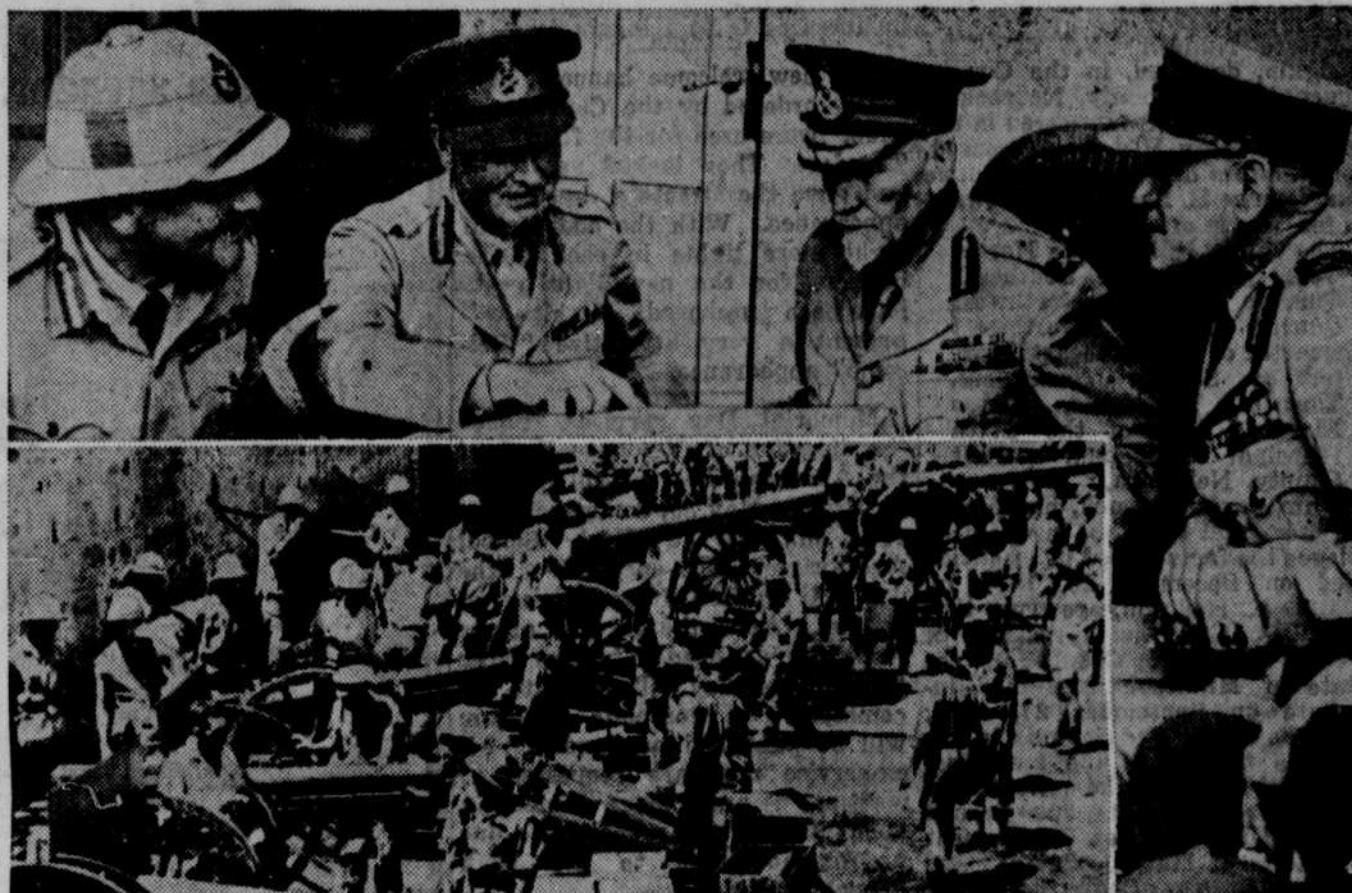
Gen. Jan Smuts (second from right), prime minister of South Africa, poring over maps of Africa with Lieut. Gen. Allan Cunningham (second from left), governor of Kenya Colony. They are shown with their aids planning the defense of Africa. Inset: South African troops who are fighting in behalf of the British empire in East Africa, with captured Italian guns and material in front of the Fort of Mega.