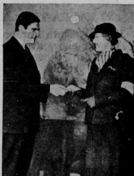
John G. Winant, United States ambassador to Great Britain, handing over a check for 70,000 pounds to Lady Reading, chief of the Women's Volunteer Service, in London. The money was sent from the American Red Cross.