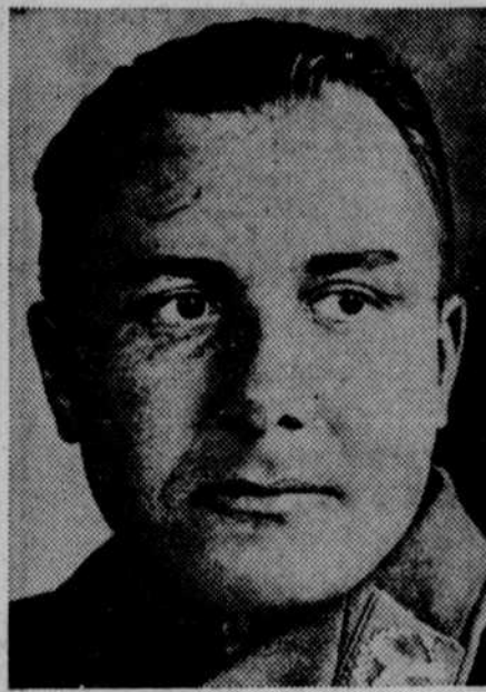
From now on the office of chancellor head in Berlin will be under control of Hitler, although the present leader, Martin Bormann (above) will remain in office. This will fill gap created by flight of Rudolf Hess, No. 3 Nazi, to Scotland.