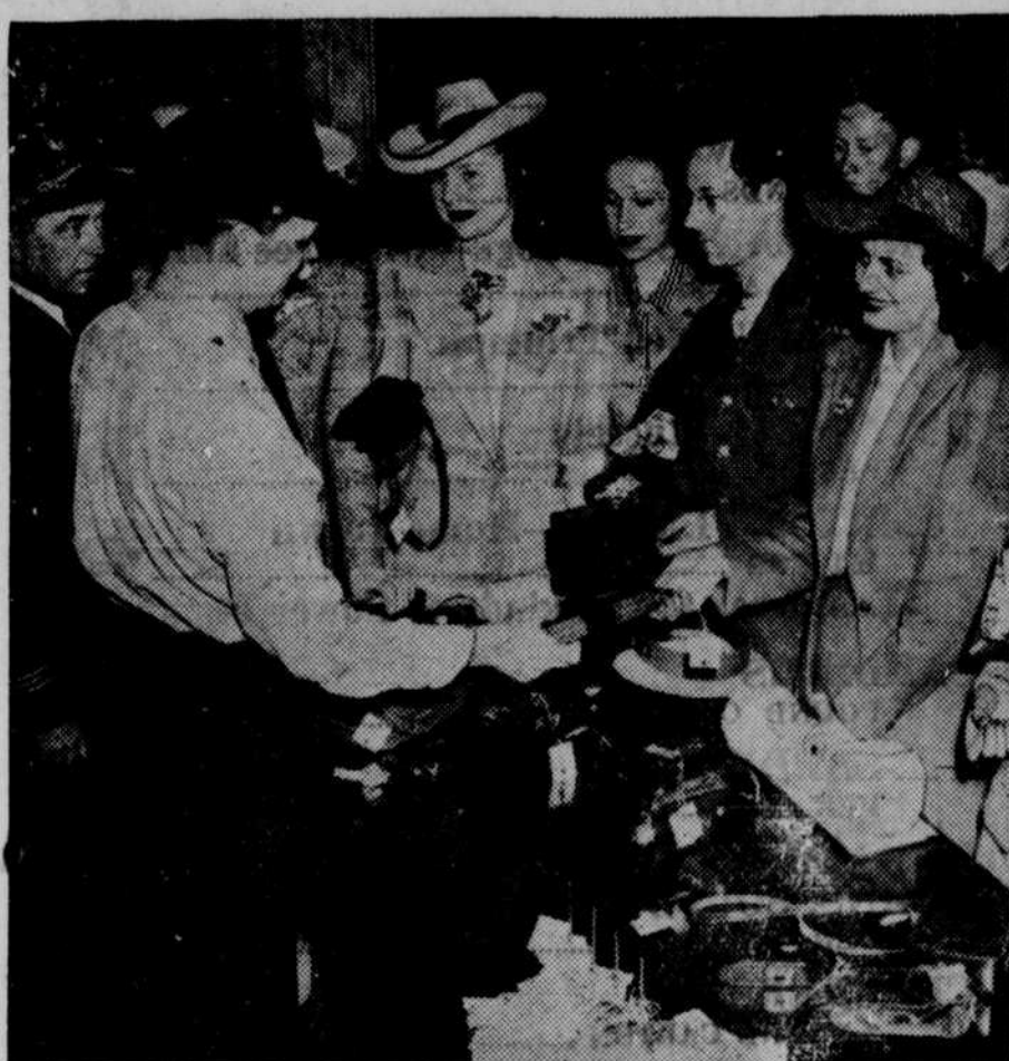
Capitol police begin checking articles carried by visitors, for the first time since World War I days, when a time-bomb exploded in the senate reception room. Acting under orders from the capitol police board, fourteen officers are stopping all visitors at the seven entrances to the building, and relieve all sight-seers of bundles, cameras, umbrellas and other articles large enough to conceal a bomb.