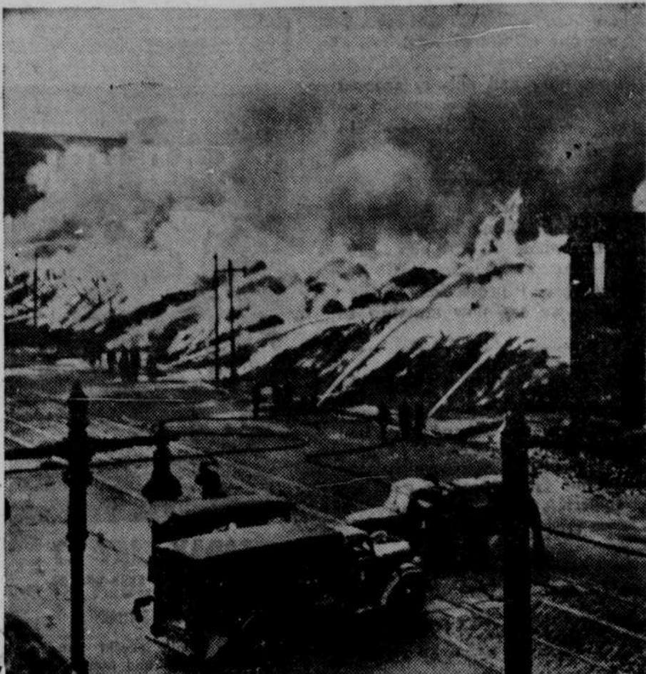
Fire swept through three city blocks of the Port Richmond section of Philadelphia, taking property toll of approximately $5,000,000 in homes and factories. A wall of water stopped the fire just short of Cramps shipyards, where large naval construction contracts are under way. Photo shows firemen fighting the blaze.