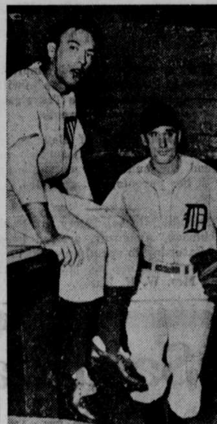
Big Hank Greenberg, (right) the most valuable man in the American league, looks wistfully out towards the diamond before starting his last game prior to his induction in the army. Several hundred friends came to say good-by.