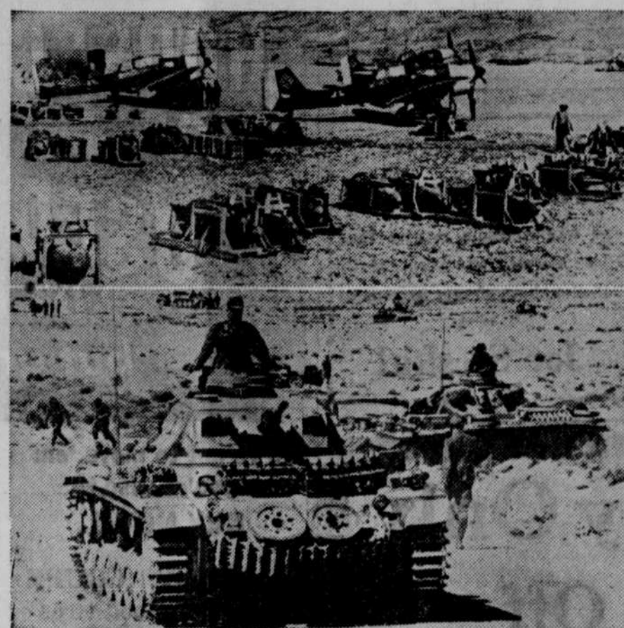
These pictures show German blitzkrieg machines at rest after victories in Greece and North Africa. At top, Stuka dive-bombing planes being serviced at a Greek airport with gas, oil and bombs. Below: Some of the huge German tanks are shown in the North African desert at El Brega, after rushing the British back into Egypt.