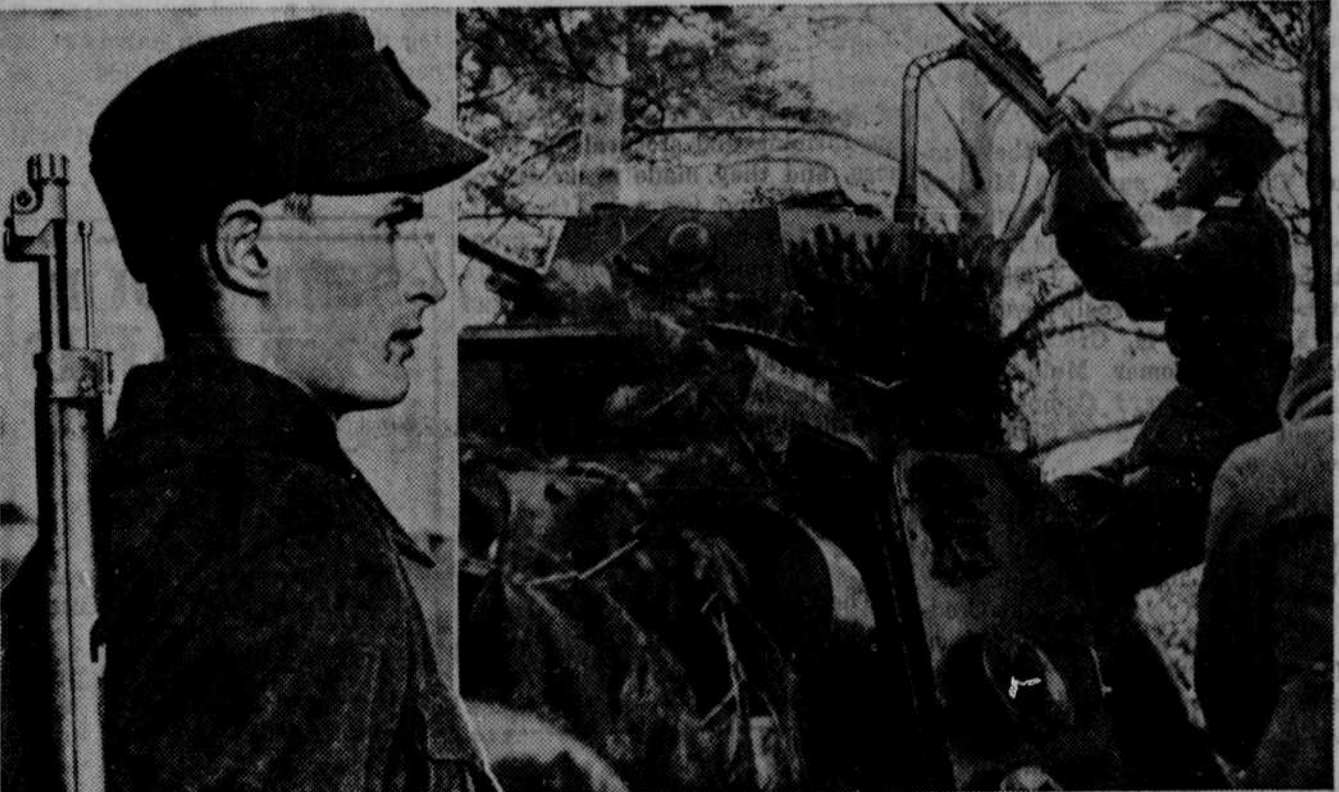
Typical of the men who are fighting for Finland's preservation is this Finnish volunteer, left, one of the thousands concentrated against Soviet forces. Right: A Finnish soldier mans a machine gun directed against the numerically overpowering Russian invaders. The gun is part of the equipment of his camouflaged tank.