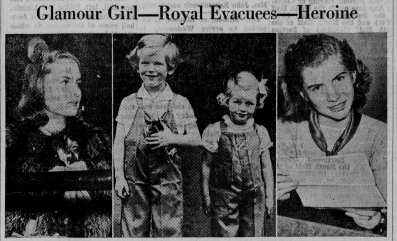
glamour to make a world-and these four not-so-very-old persons pictured here