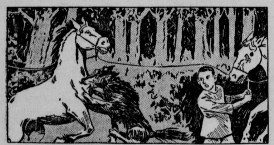
Suddenly, a lithe, gray form shot out of the woods and sank its teeth into the neck of the first horse!

It was almost dark by the time he got her quieted, and still he had the other horses to round up. It took him another 10 or 15 minutes to