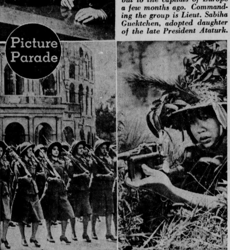
ABOVE-Amazons in Europe and Asia. At left, unsmiling young Italian women, uniformed and carrying bayoneted muskets, prepare for their coming life in the Italian colonies. At right, a Chinese woman soldier camouflages herself.