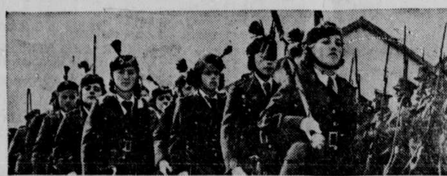
Women troops of Albania-now subjects of Mussolini.