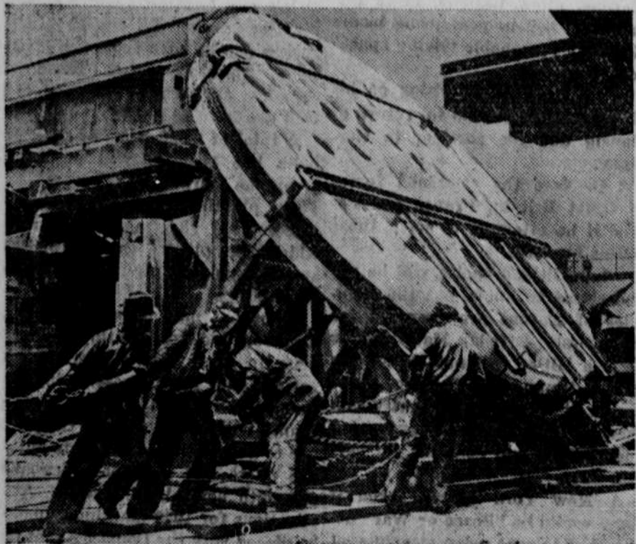
Using house-moving technique, workmen move the original 200-inch glass disc of a Corning, N. Y., glass works through a gap which was cut in a railroad trestle. An entire section of trestle and tracks had to be removed so that the huge 20-ton telescope eye and its special steel cradle could pass. The disc is the largest single piece of glass in the world.