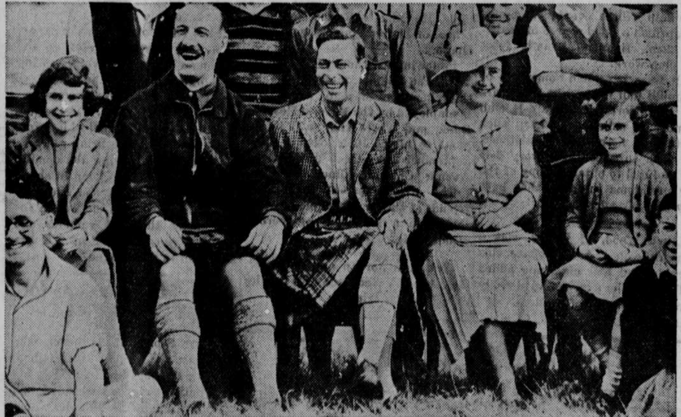
Be-killed and tie-less, King George of England appeared to have the time of his royal life when he visited the schoolboys' camp which he maintains. This year the camp was at Abergeldie, near the Balmoral castle. At left is Princess Elizabeth; beside her an aide de camp; King George is in center, then Queen Elizabeth and Princess Margaret Rose.