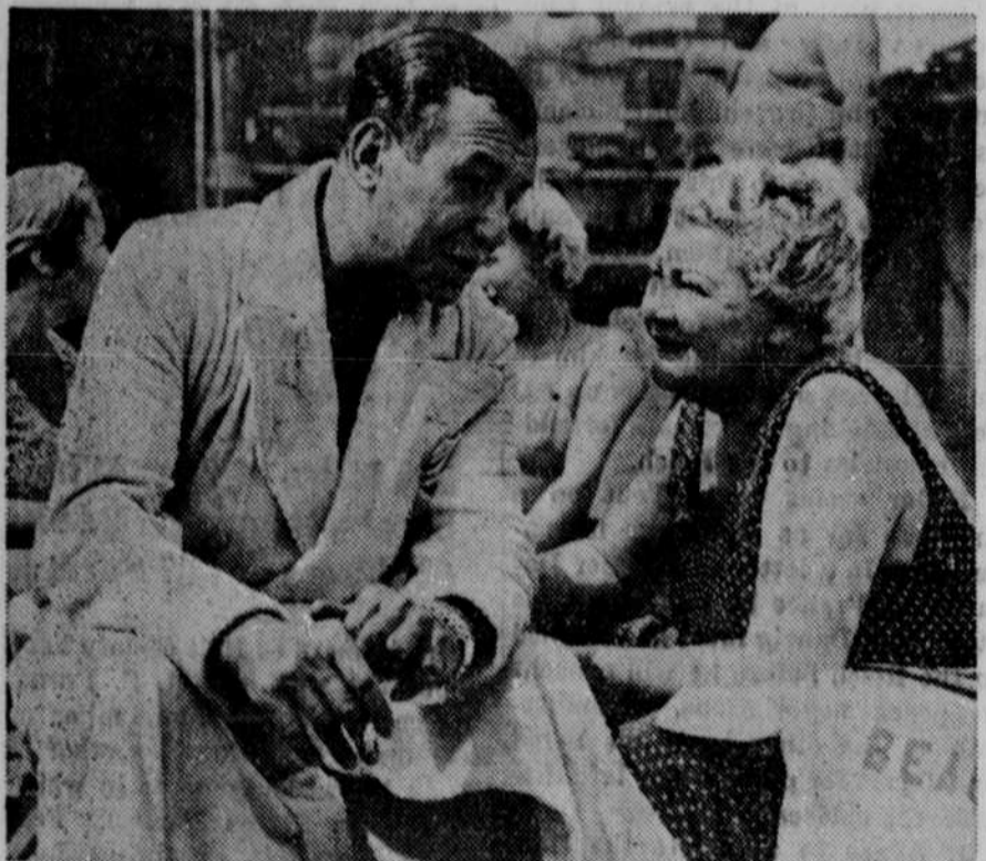
The weighty conference between Sophie Tucker, last of the "red-hot mamas," and president of the American Federation of Actors, and Harry Richman, must have been successful, for shortly afterward the American Federation of Labor ended a labor dispute centering around Miss Tucker. The A. F. of L. ordered that her organization be reinstated into the Associated Actors and Artists of America, from which it had been previously expelled. The decision was "pleasing" to Miss Tucker.