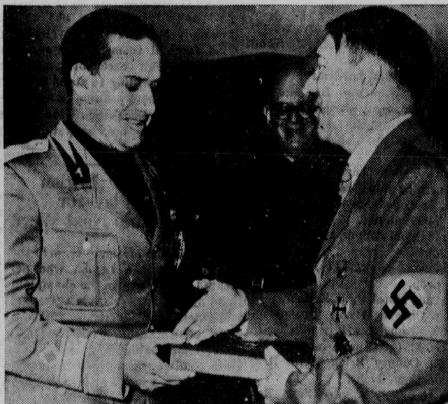
Italian Foreign Minister Count Galeazzo Ciano chats with German Reichsuehrer Adolf Hitler during conversations at Berchtesgaden and Salzburg between Ciano and Joachim von Ribbentrop, German foreign minister. Observers believed this conference brought a statement of Italy's disinclination to support Germany in a war over Danzig, also paving the way for an all-European conference to settle issues over Danzig and Italian claims against France.