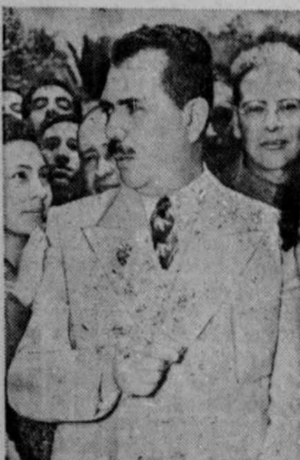
President Lazero Cardenas of Mexico, speaking recently at Tia Juana, Baja Calif., announced approval of a 2,000,000 peso bond issue for construction of a 131 mile highway from Mexicali, on the United States-Mexico border, to San Felipe, a Gulf of California fishing village. An irrigation system in the Mexicali valley will cost an additional 12,000,000 pesos.