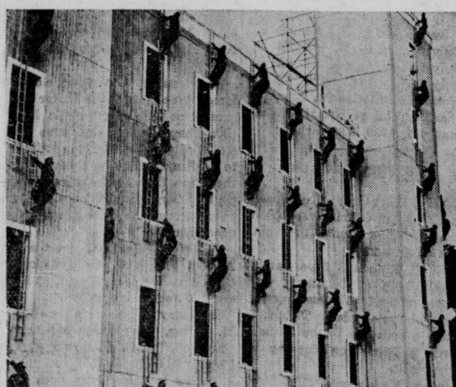
A second Nero would have little chance to fiddle while Rome burned. These young men, members of the Roman fire department, are shown at their Italian training camp as they practice rescues with scaling ladders. The fire-fighters carry out their drills as if they were engaged in military operation.