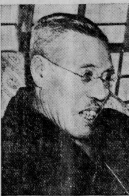
Poised in Japan's "hot seat" as war with China is augmented by an apparent war with Russia on the Outer Mongolian-Manchukuoan border, Premier Baron Kijichiro Hirayama tried to encourage his people by discrediting the Russian conflict's importance, nevertheless pointing out that Japan will continue to press her demands for fishing and forestry concessions from the Soviet.