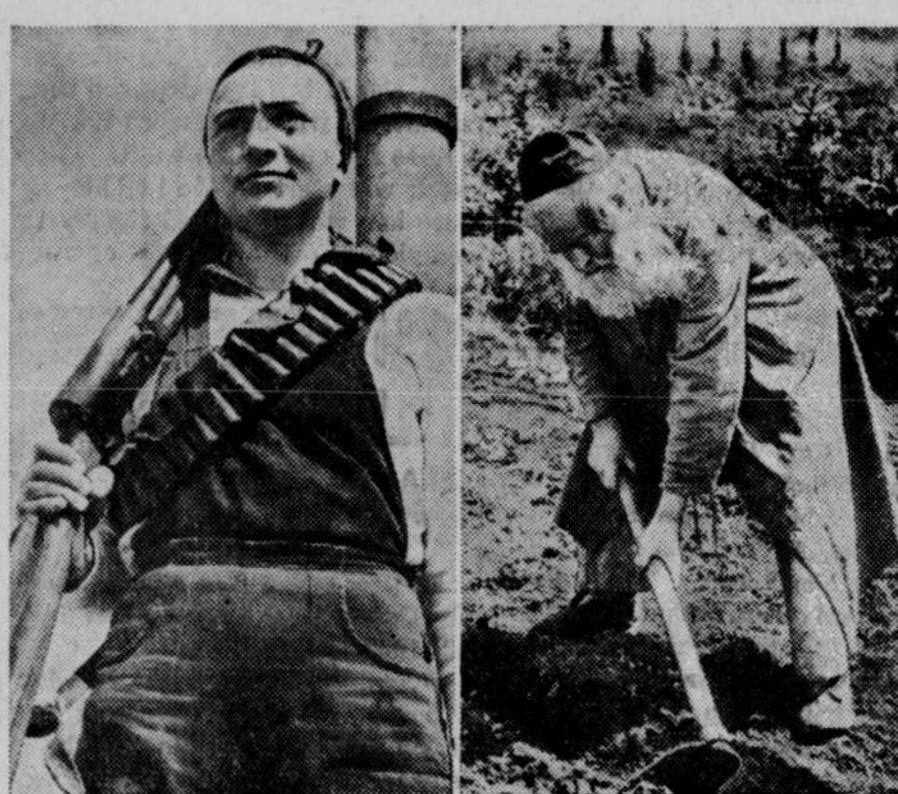
Strongly reminiscent of the pioneers who helped build America are these Jewish settlers in Palestine. A Jewish girl stands guard outside the settlement at Tel Aviv, in the Holy Land. Armed with a shotgun, she takes her turn at sentry duty while the menfolk work. Even the aged must work, remaining constantly alert for raiding Arabs who resent his seeking a homeland.