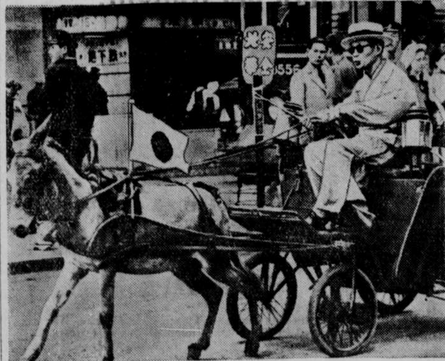
Japan's war-time economy has resulted in the reappearance in Tokyo of the old-time donkey cart, used to transport goods on even the busiest streets. Gasoline, an important munition, is so valued that a drop of it is now compared to a drop of blood. Charcoal burning automobiles, a new invention, have also made their appearance.