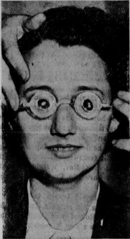
The myriad pleasures of sight have been regained for the semi-blind through use of the teleoptic magnifier, a new type spectacle lens, members of the American Academy of Optometry were informed recently. Representing the largest spectacle magnification yet achieved for distant vision, 300 per cent, the new device has already returned children in blind institutions to public schools.