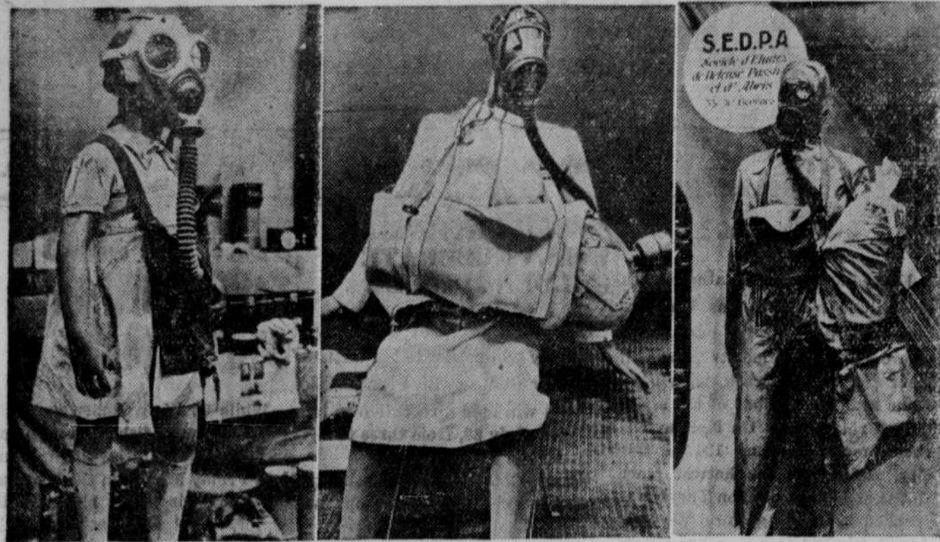
Paris, long a world fashion center, now sets the style for a new kind of apparel. The new mode, protective clothing designed for air raid safety, is more practical than fashionable. The above costumes were displayed in a recent Paris exhibit of air raid precaution clothing. Left: What the safely dressed child between four and six years old will wear if the city is bombed. Center: A specially designed gas mask for mother and child. Right: A mask suit and protected bag for carrying provisions during a time of emergency.