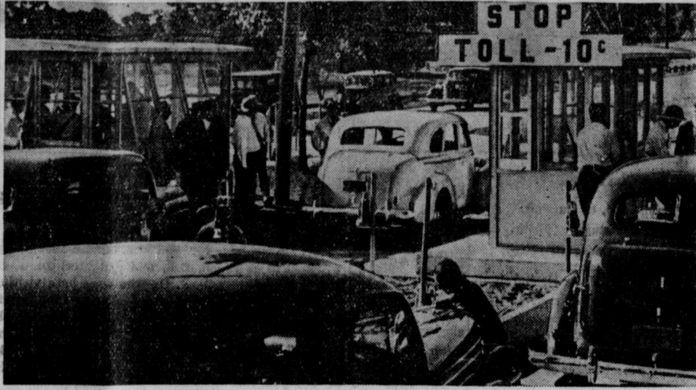
Toll roads like Connecticut's new $20,000,000 parkway system would become commonplace throughout America under President Roosevelt's original $3,860,000,000 lending plan, which provided funds for construction of self-liquidating highways and bridges. Connecticut's experience provided a bird's-eye preview of public reaction to the plan, which departs from the traditional free highway system. Many motorists protested Connecticut's 10-cent fee, but they paid anyway.