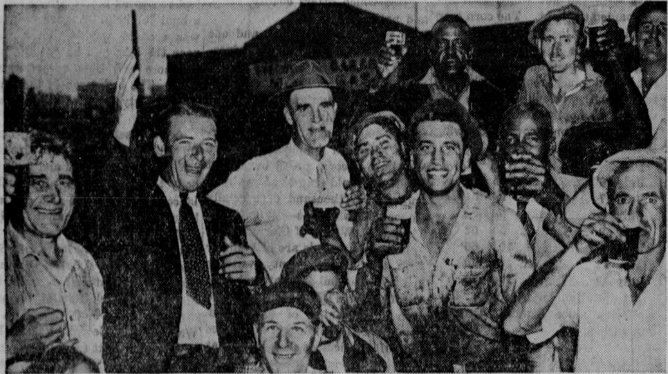
A buffet luncheon on a Forest Hills, N. Y., roof garden was the reward tendered WPA workers at the completion of a road project in that city. The luncheon was given in their honor by 125 merchants and property owners along a principal street which was widened, and was, according to the hosts, a reward for their speed and competence in getting the work done promptly, relieving traffic congestion.